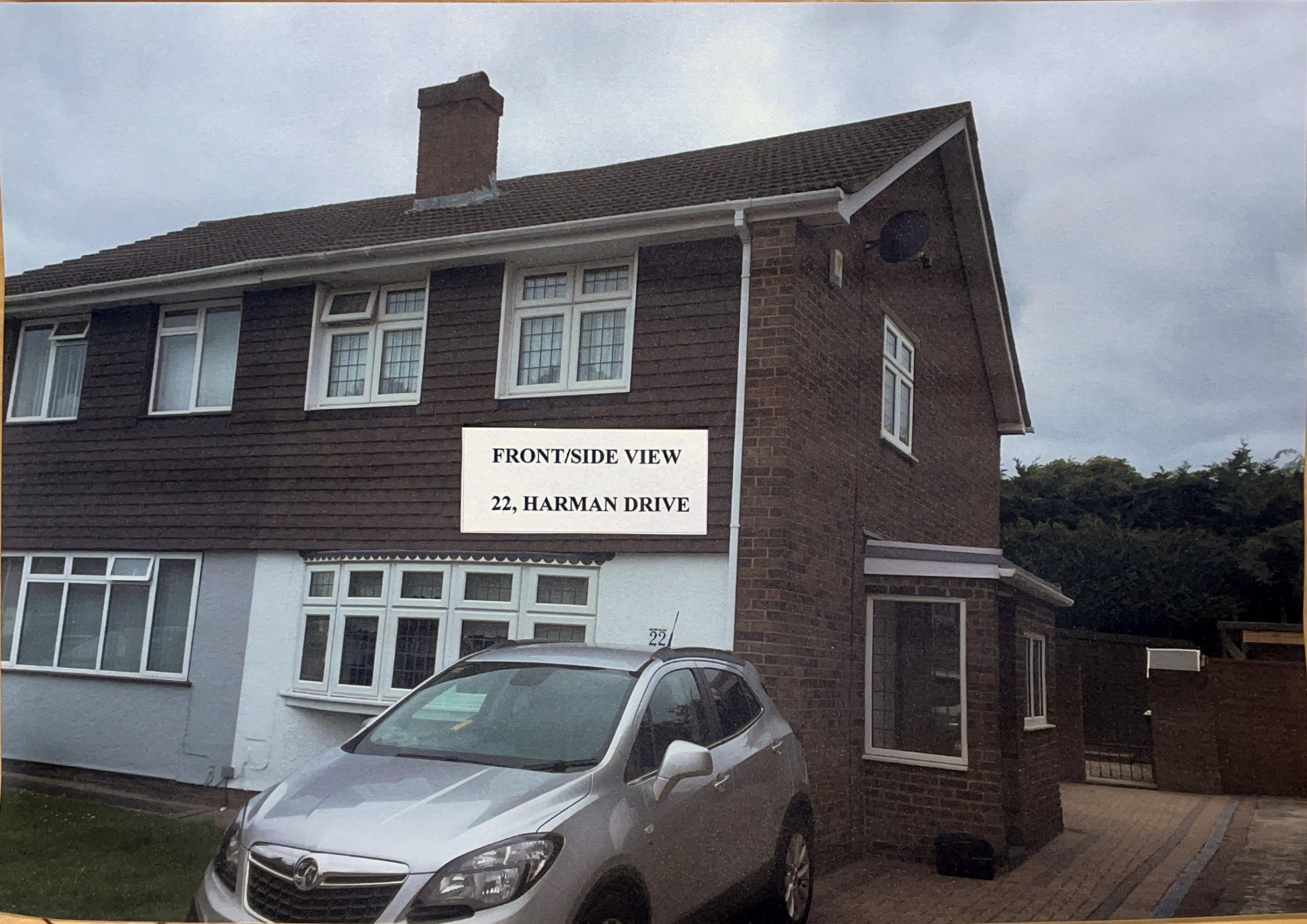
FRONT/SIDE VIEW 22, HARMAN DRIVE