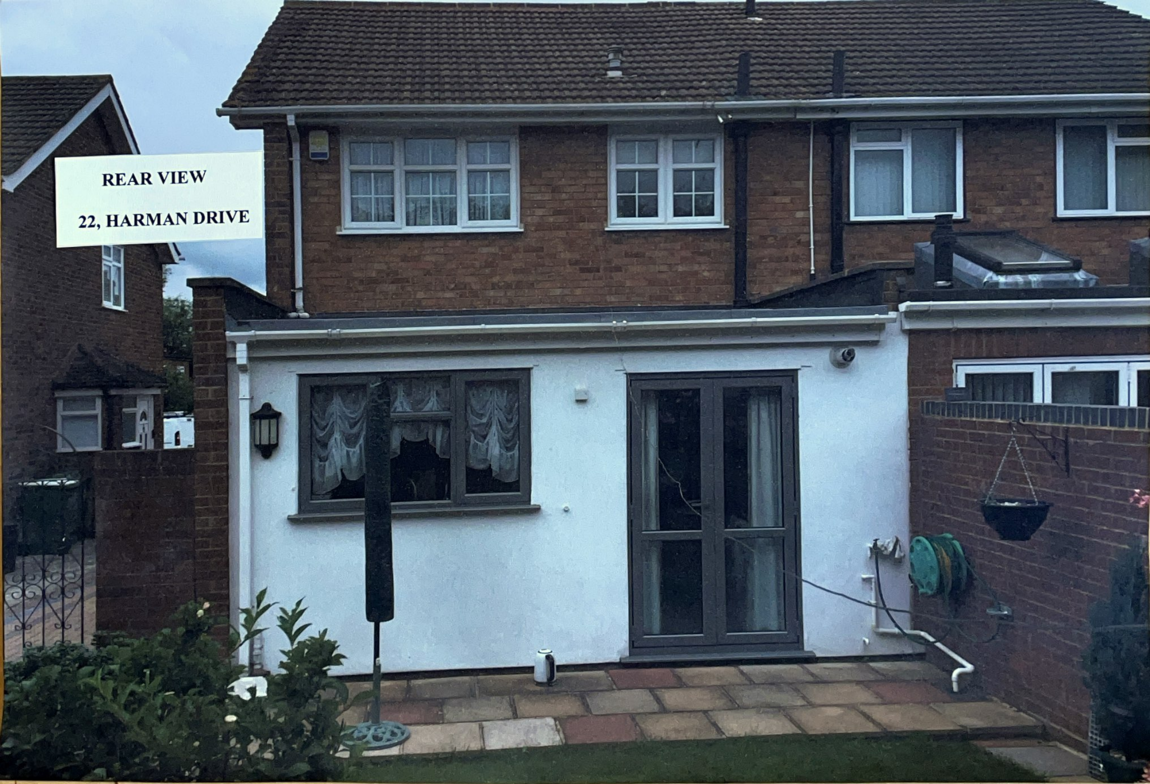
REAR VIEW 22, HARMAN DRIVE