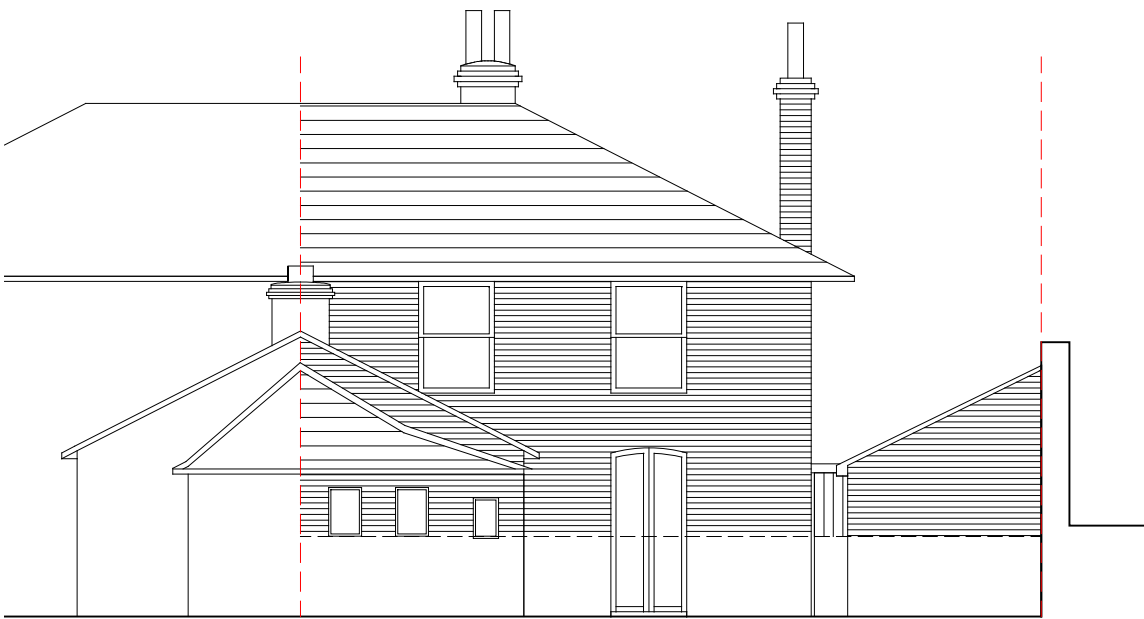
Rear / North Elevation