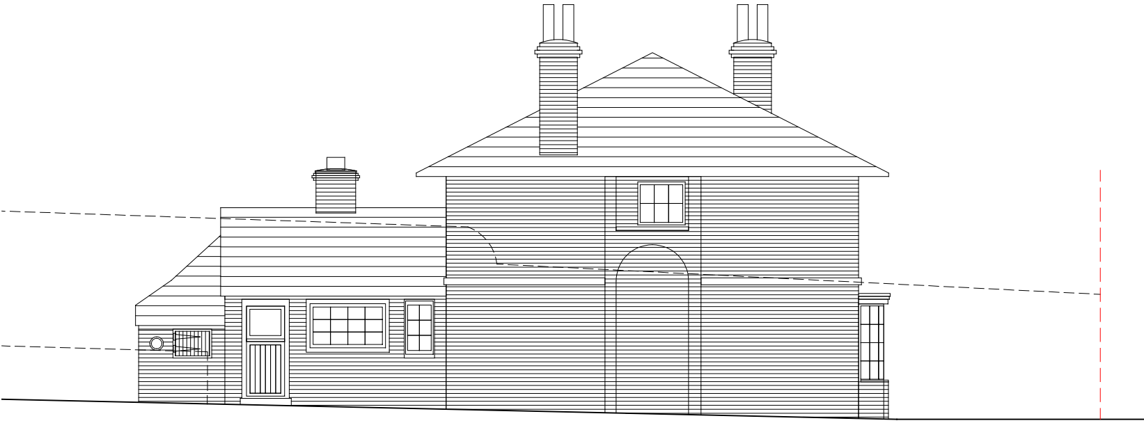
Side / West Elevation