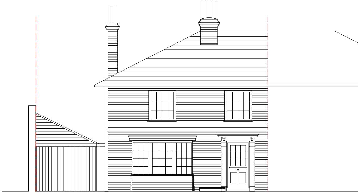
Front / South Elevation