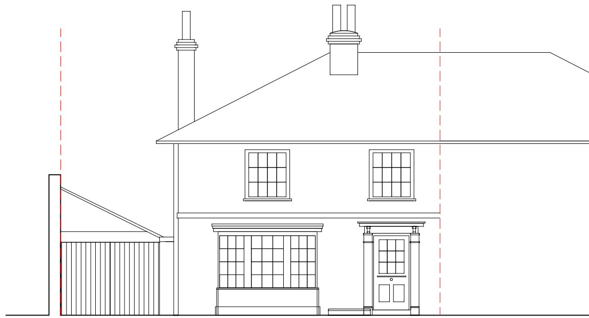
Front / South Elevation