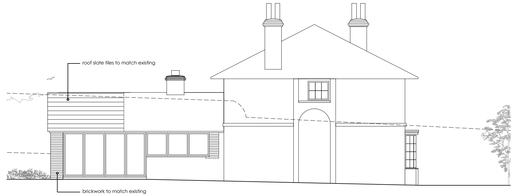
Side / West Elevation