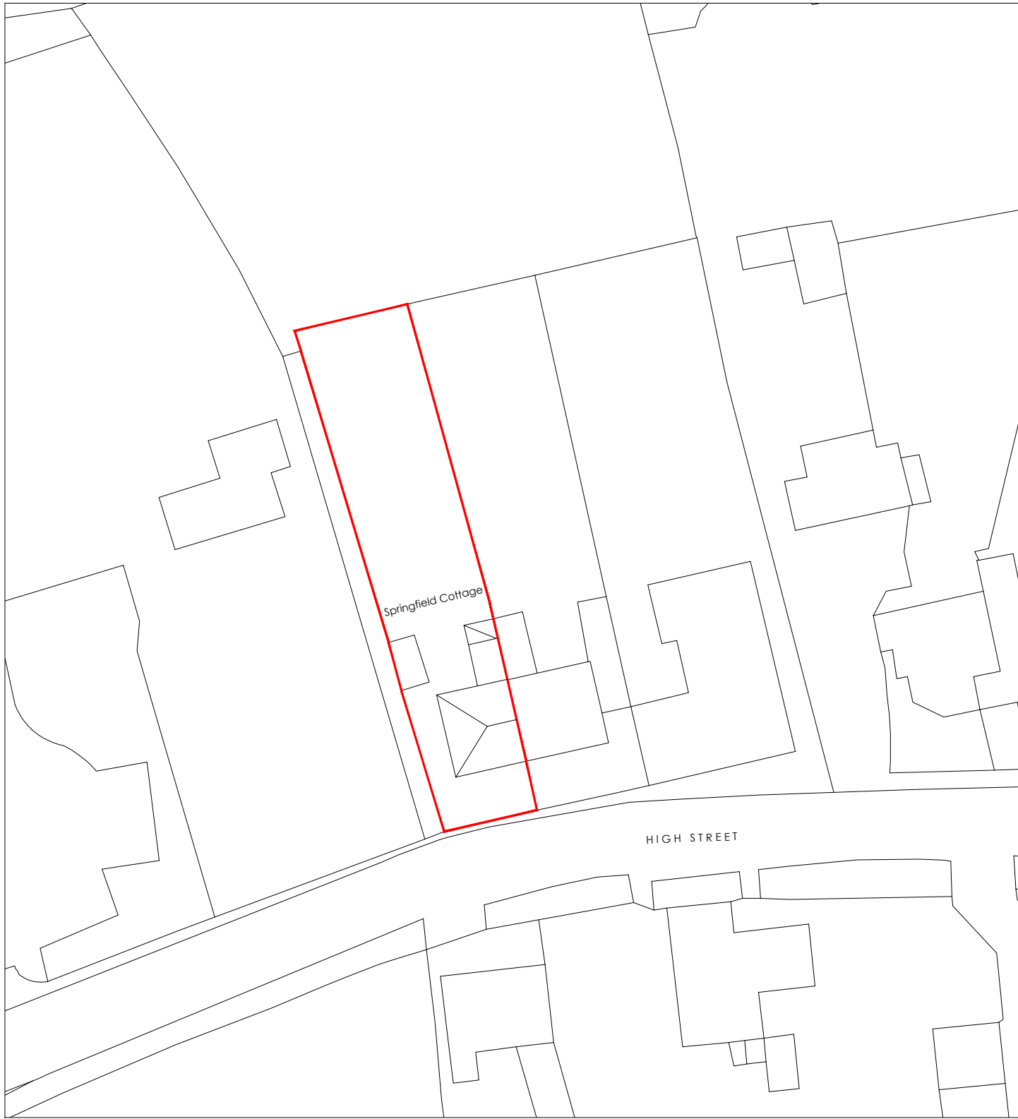
Existing Site Block Plan