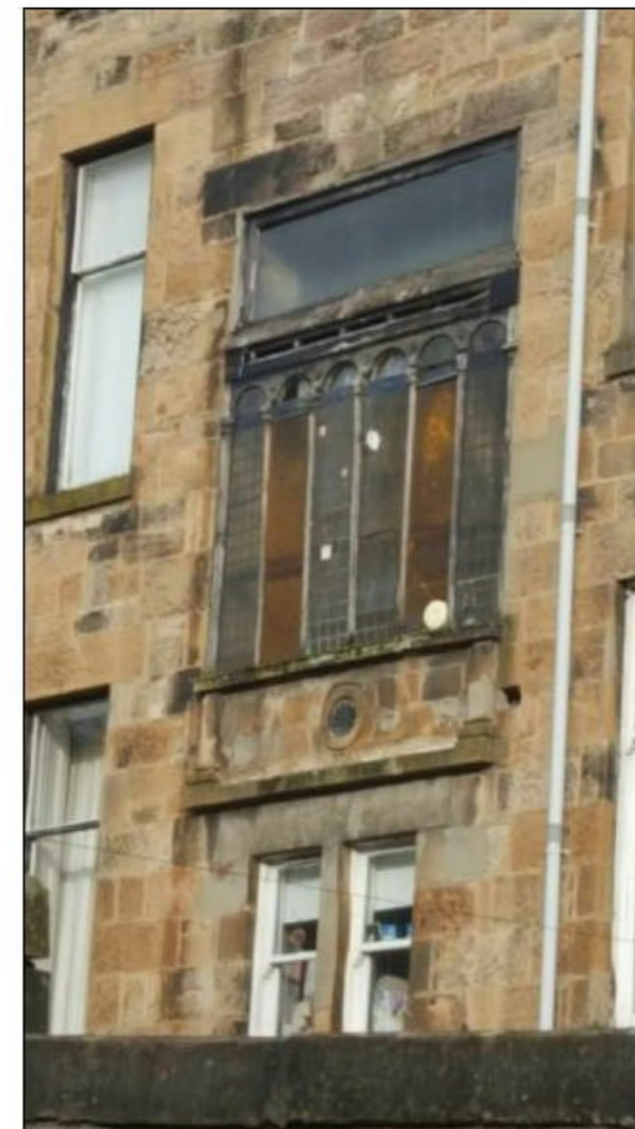
VIEW OF WINDOW