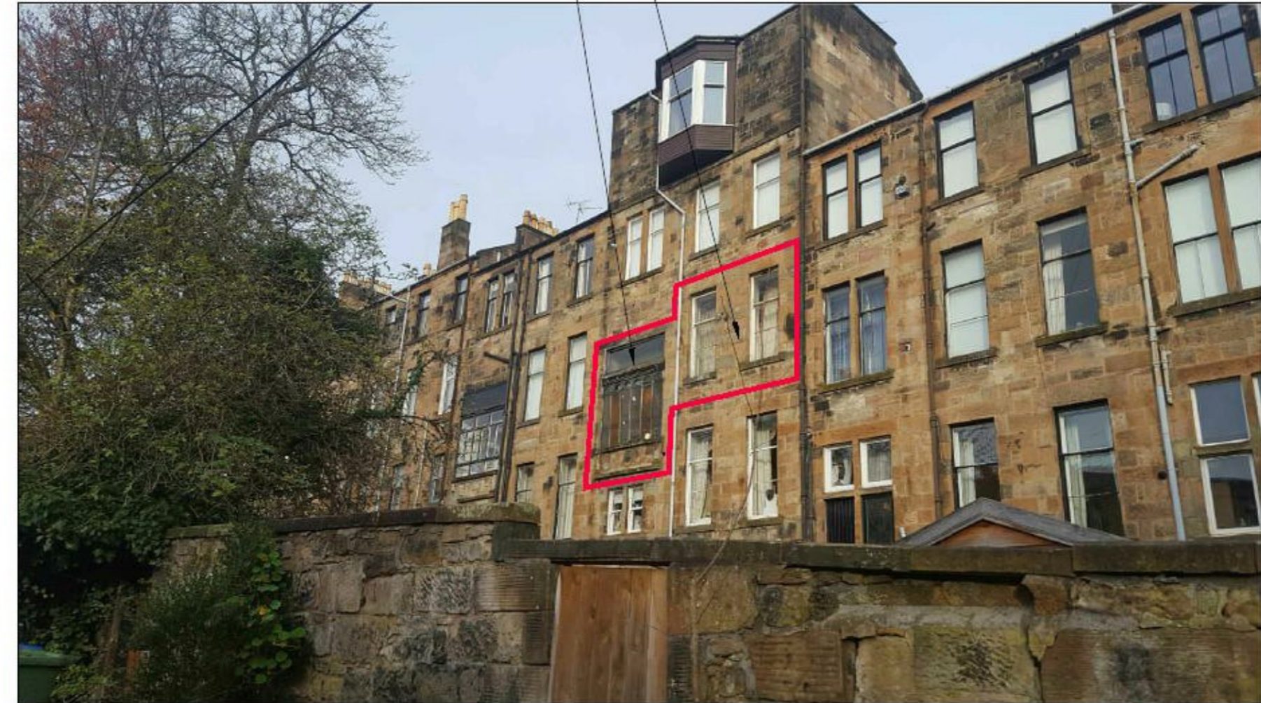
EXISTING VIEW OF REAR ELEVATION

FLAT EXTENTS OUTLINED IN RED WINDOW PROPOSED TO BE REPLACED IS WITHIN A STORE AREA OWNED BY MY CLIENT WHICH IS ACCESSED OFF THE STAIR LANDING