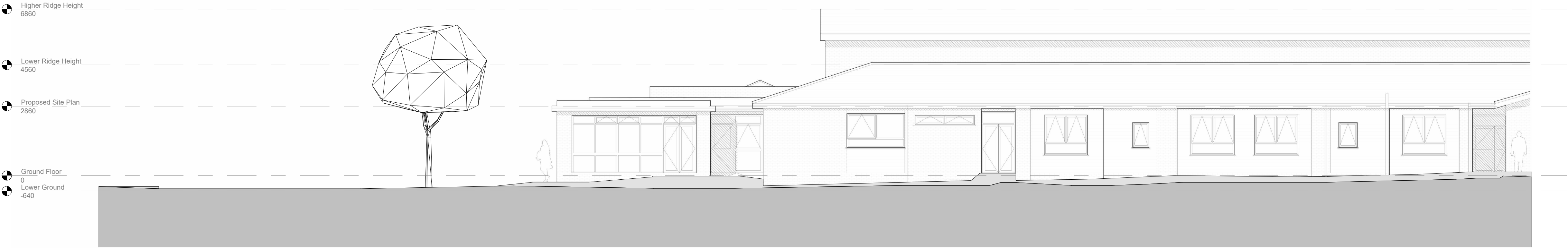
2 Existing Rear Elevation (South-East) 1:100