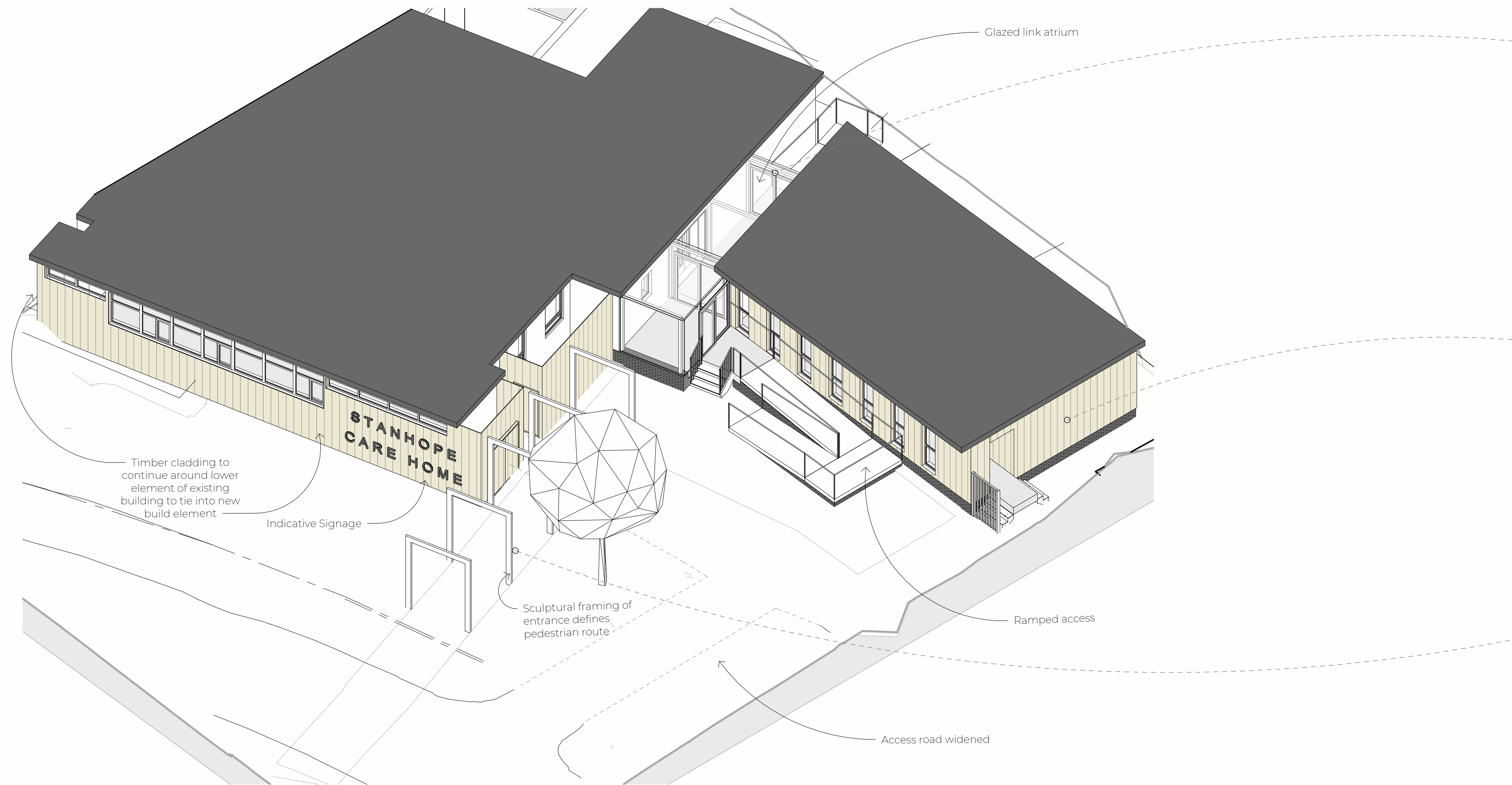
5 Site Axonometric