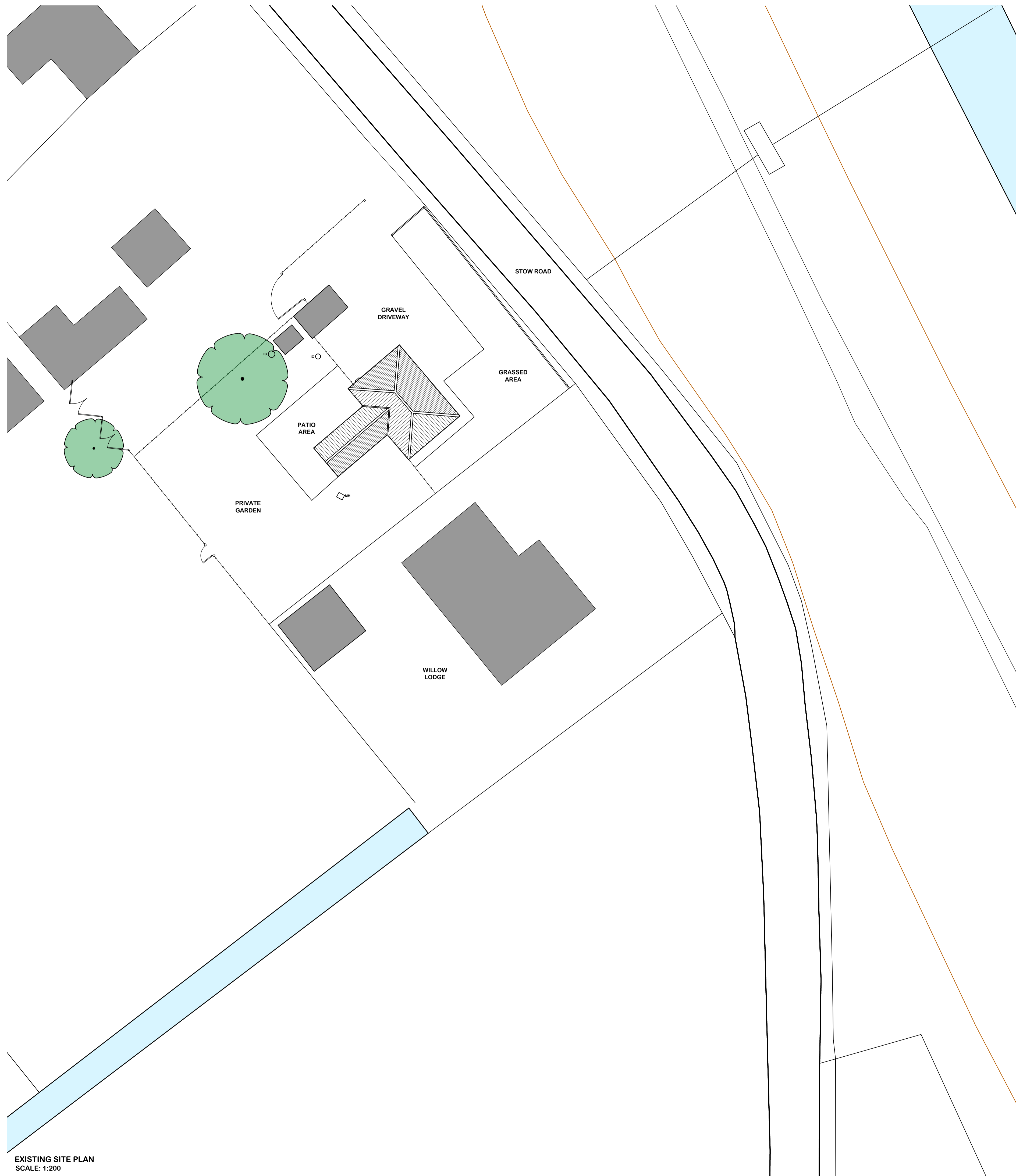
EXISTING SITE PLAN SCALE: 1:200