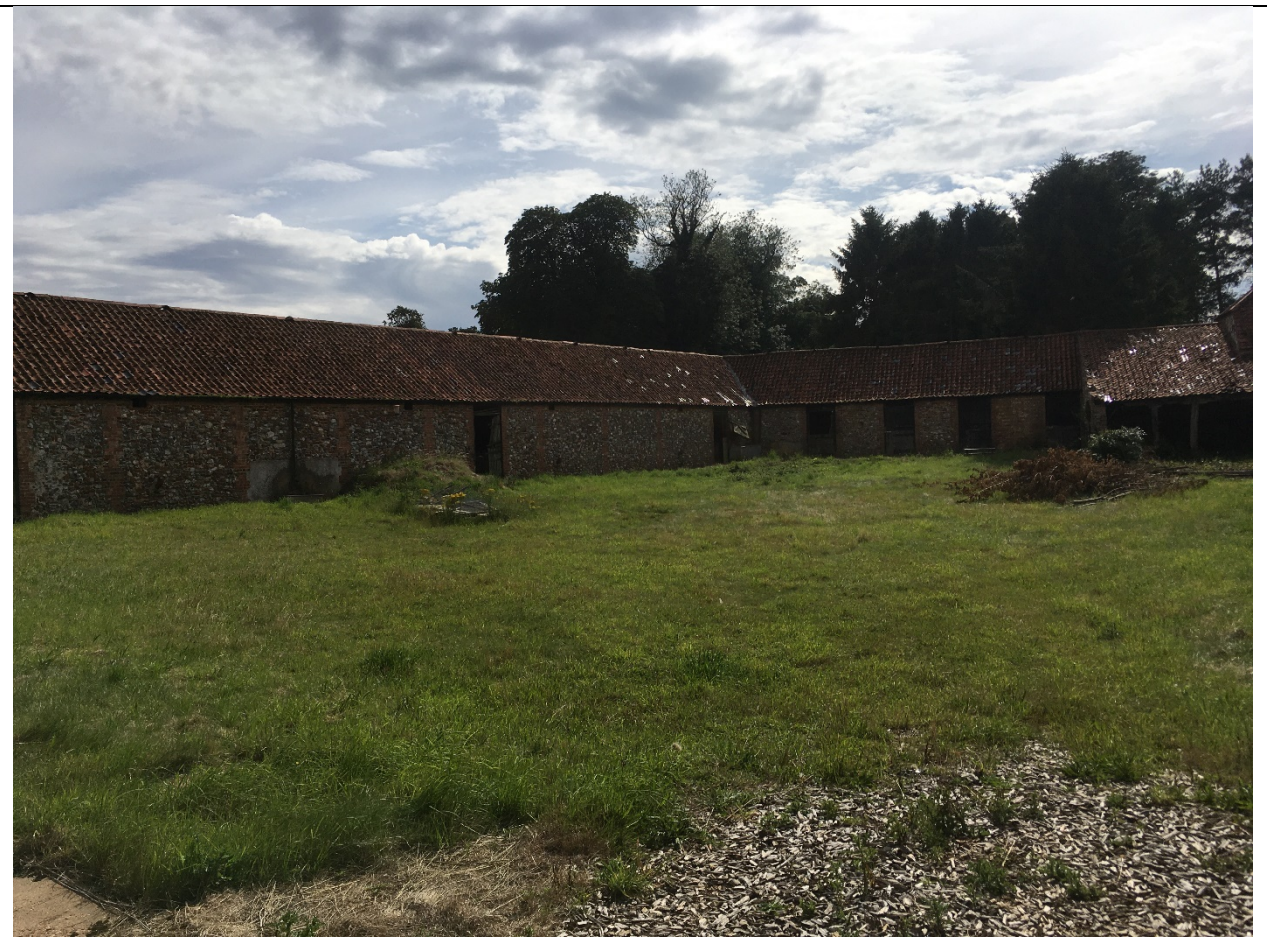
Above: Inside courtyard area looking south-west

Below: Eastern elevation (exterior of wing)