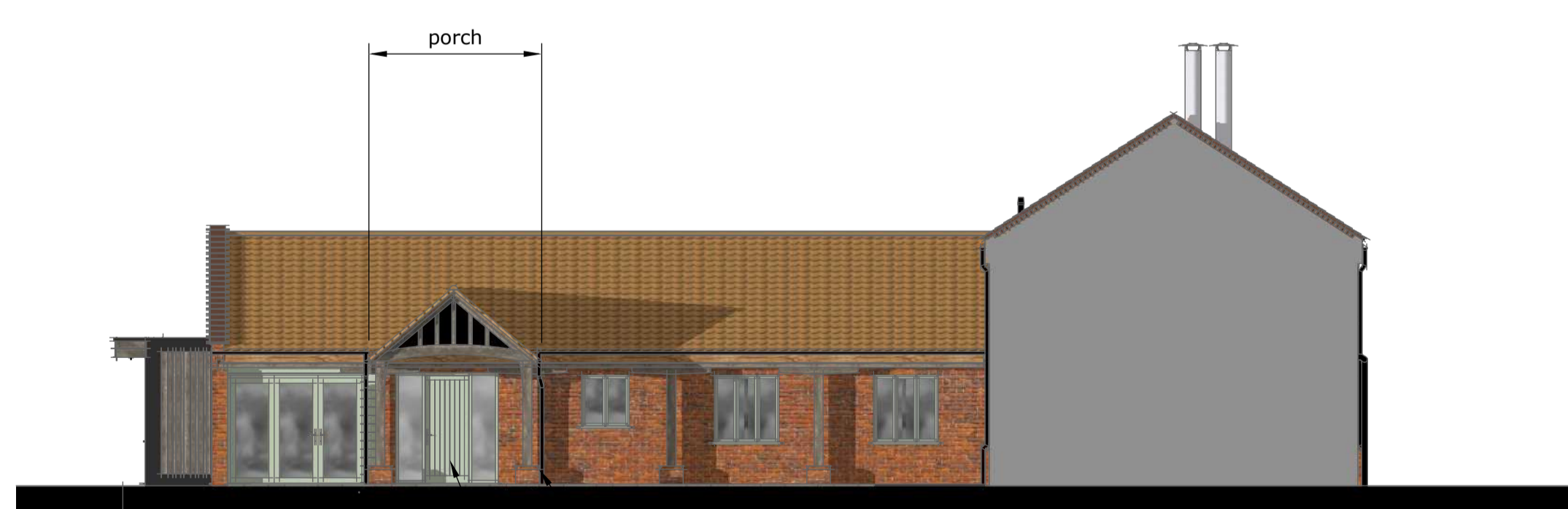
7 proposed north elevation scale: 1:100 @ A1