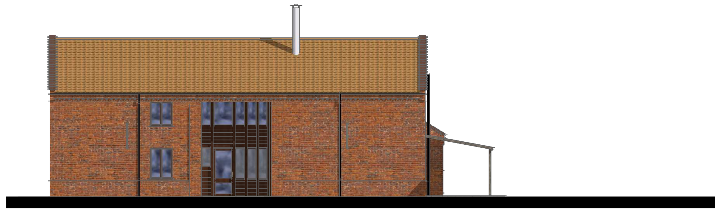
2 existing west elevation scale: 1:100 @ A1