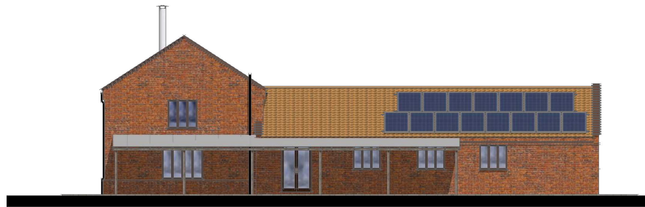
1 existing south elevation scale: 1:100 @ A1