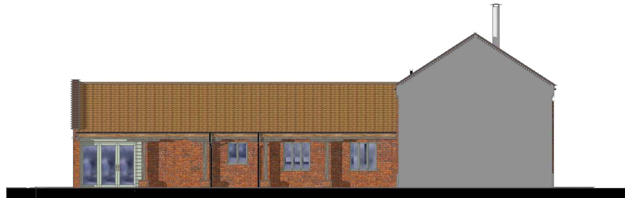
3 existing north elevation scale: 1:100 @ A1