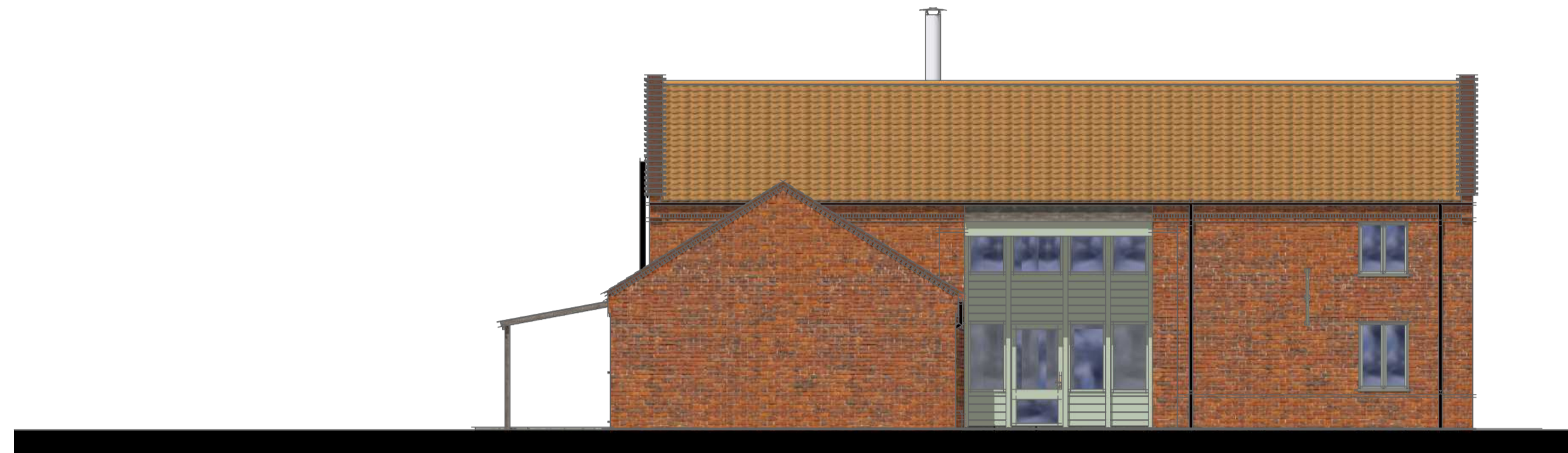
4 existing east elevation scale: 1:100 @ A1