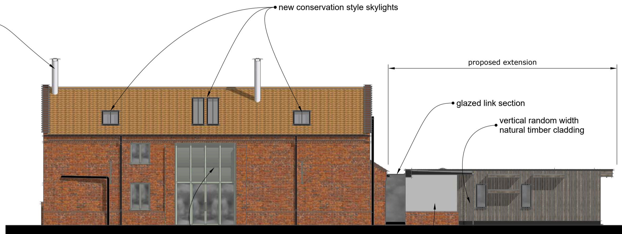
6 proposed west elevation scale: 1:100 @ A1