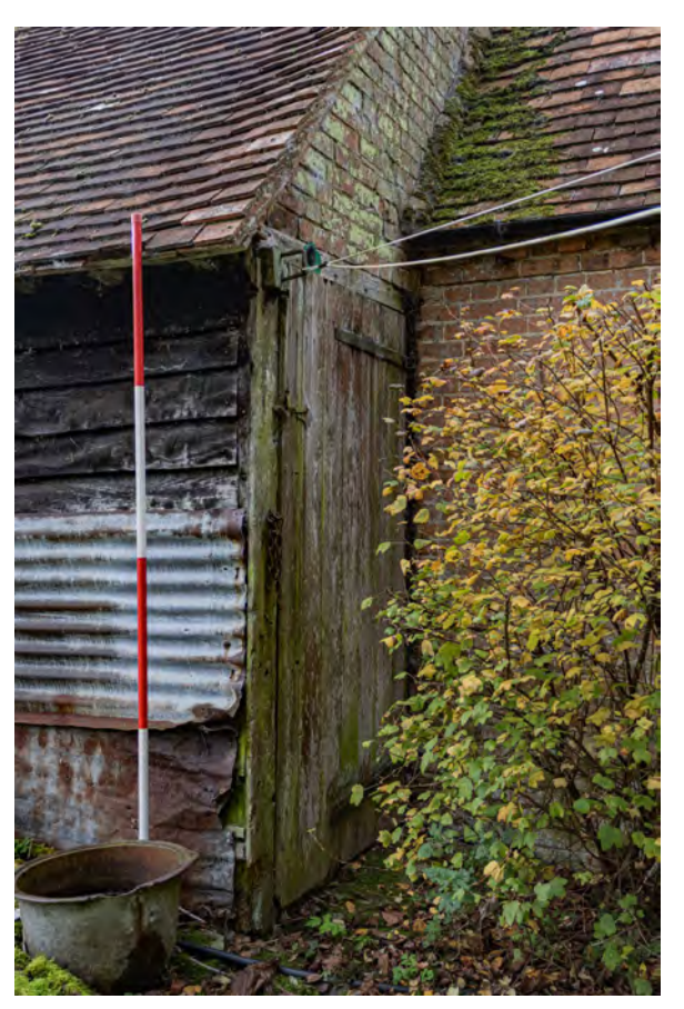
Plate 60 (048): Cow Shed, North-West Elevation, detail of door [25] from the north