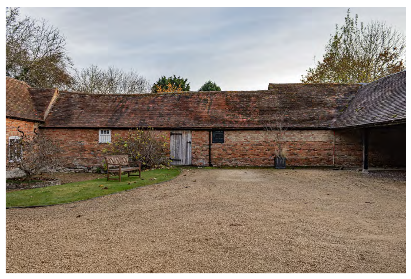
Plate 9 (002): Cow Shed, South-West Elevation, general view from the south-west