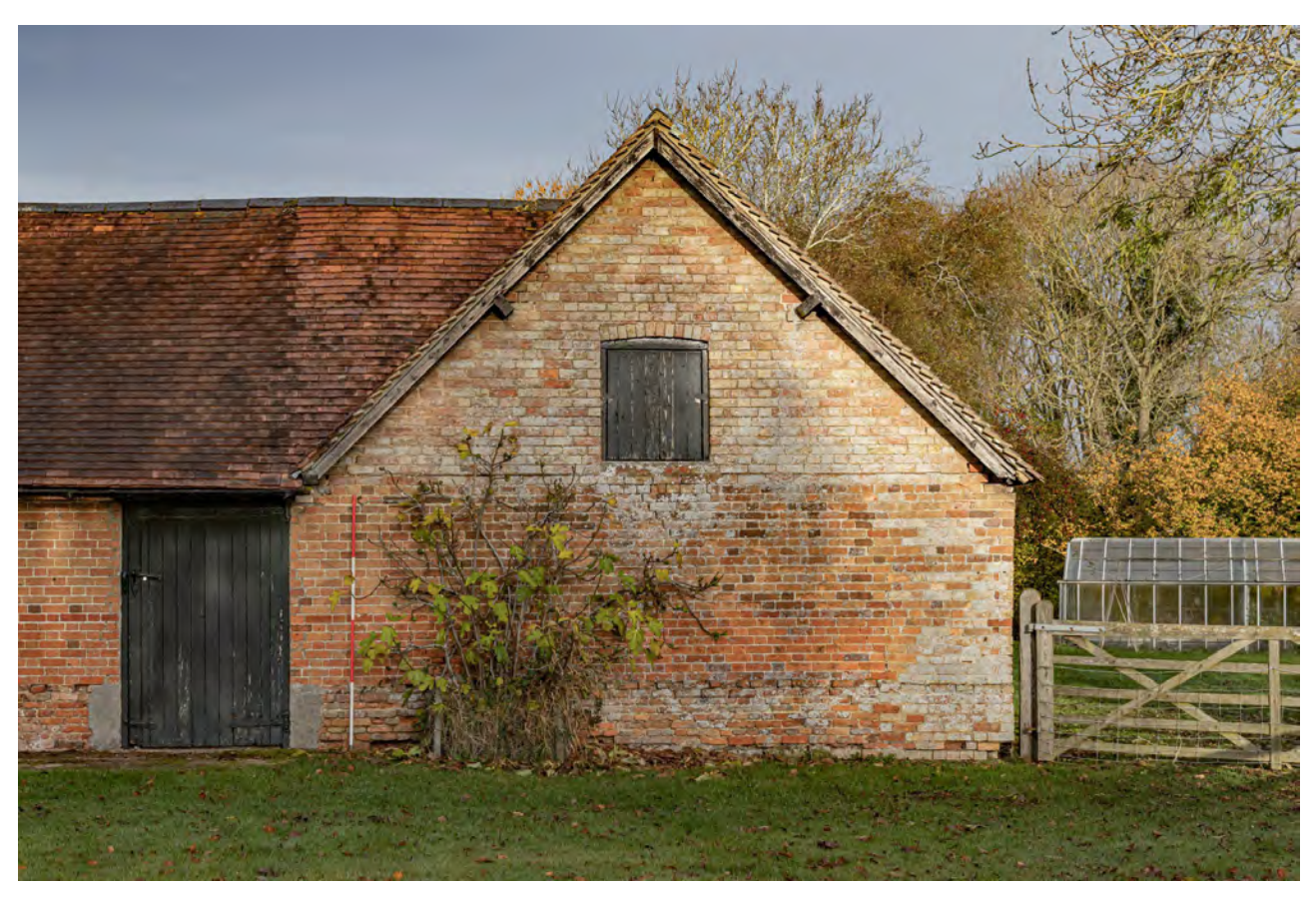
Plate 41 (028): Cart Store, South-East Elevation, detail of gable from the south-east