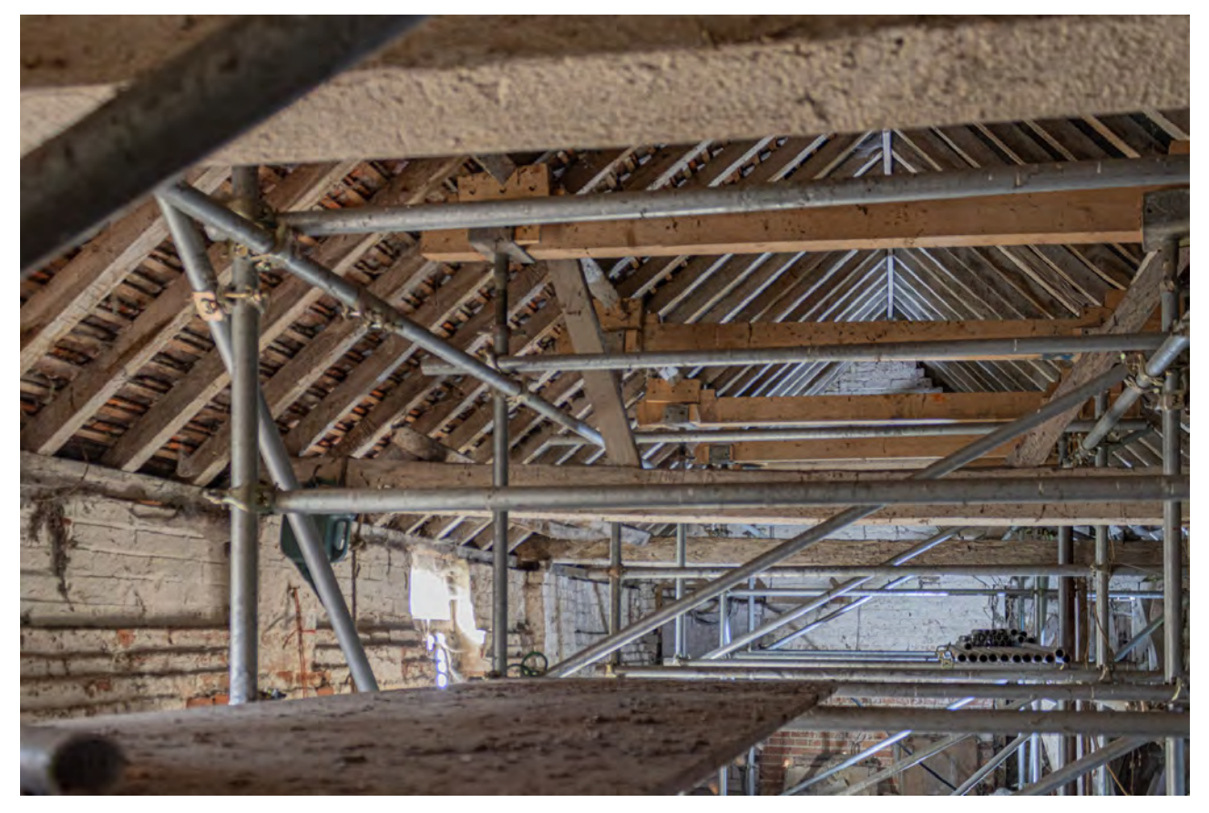
Plate 65 (071): Room 1, general view from the SSE