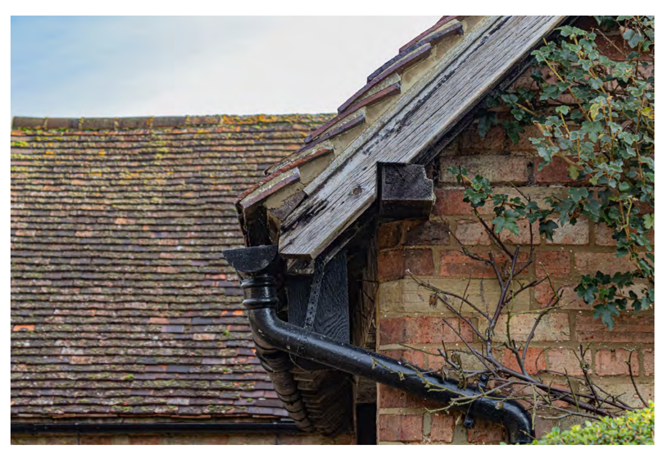
Plate 32 (024): Cart Store, South-West Elevation, detail of the north-west side, from the south-west