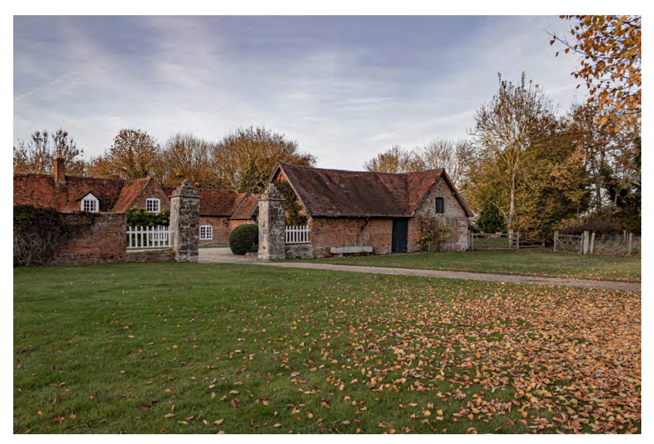
Plate 4 (121): General view of Old Arngrove Farm in its setting, from the south-west