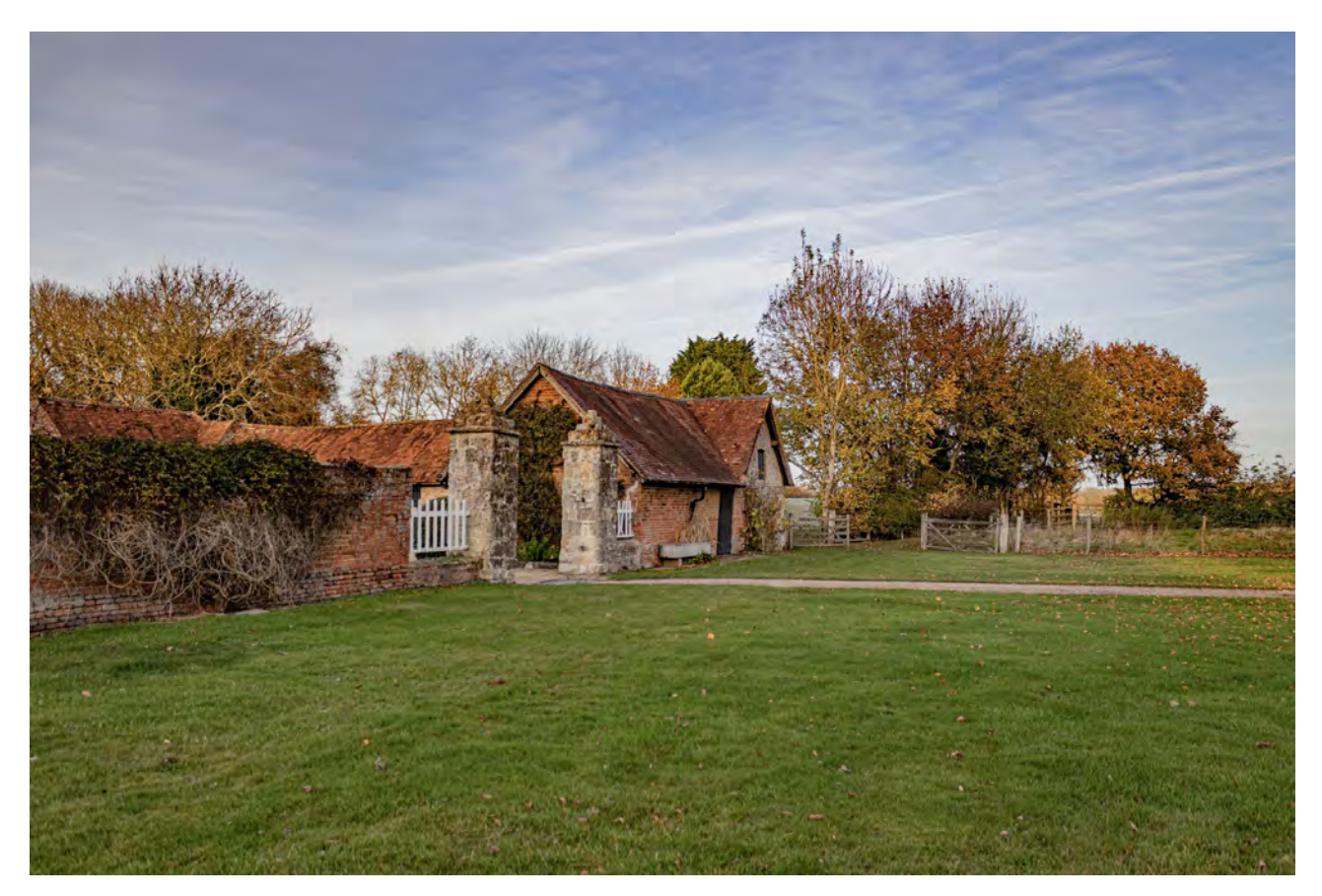
Plate 6 (122): General view of Old Arngrove Farm in its setting, from the WSW