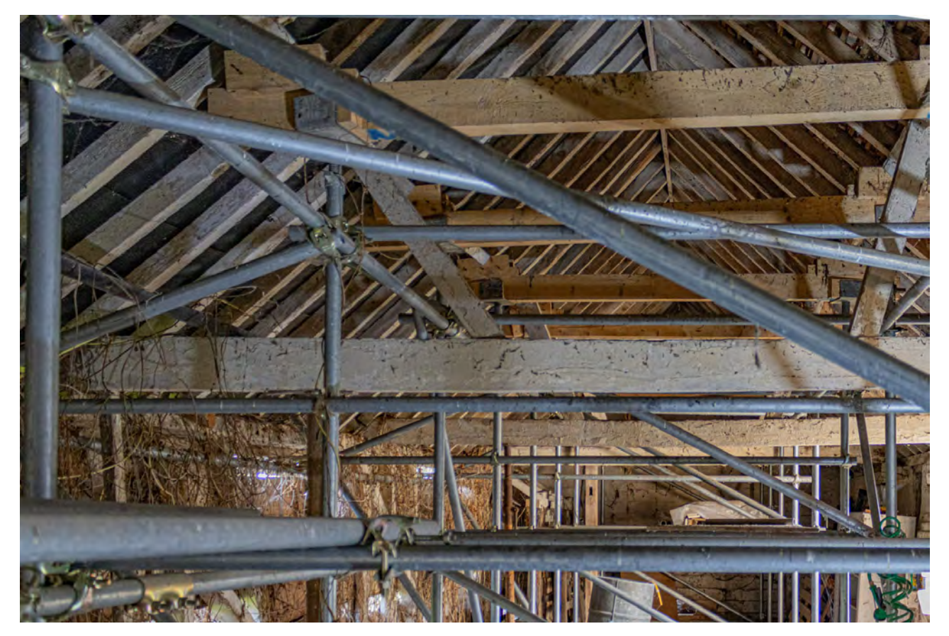
Plate 63 (056): Room 1, general view from the north-west