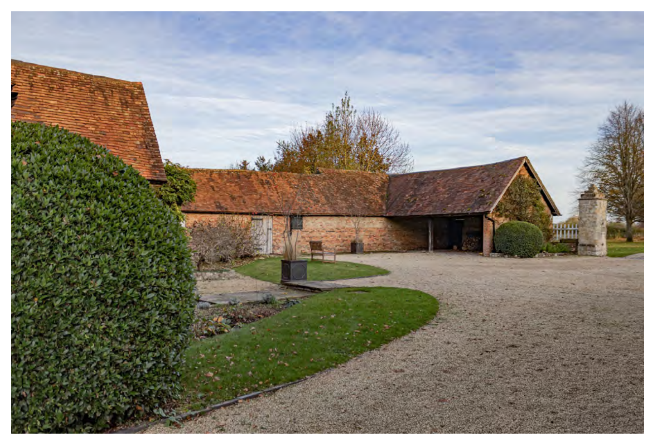
Plate 7 (123): General view of Old Arngrove Farm in its setting, from the west