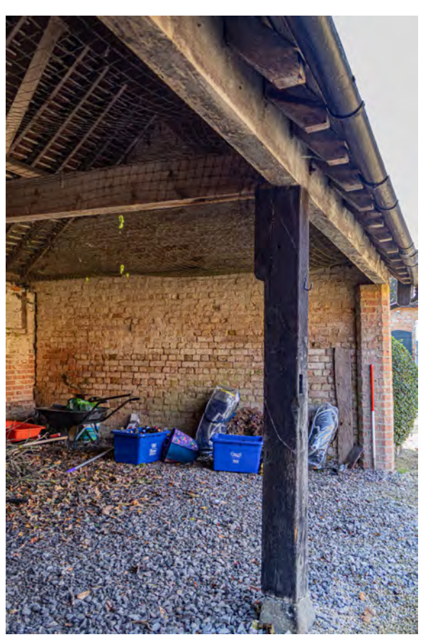
Plate 26 (077): Cart Store, North-West Elevation, detail of post from the ENE