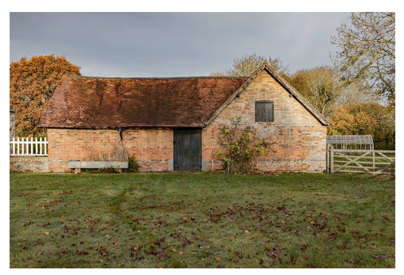
Plate 36 (027): Cart Store, South-East Elevation, general view from the south-east