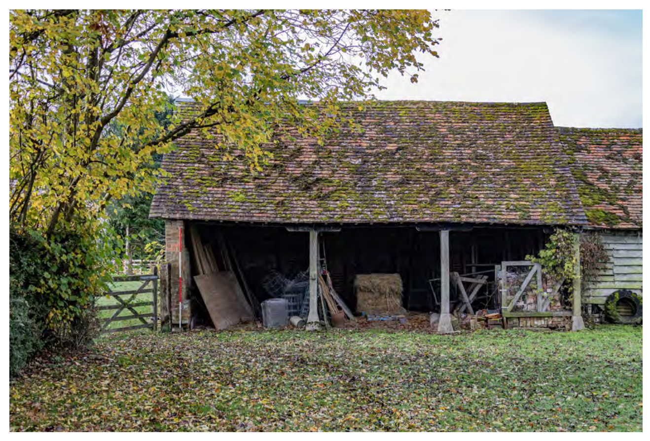
Plate 47 (036): Cart Store, North-East Elevation, general view of the Cart Store from the north-east