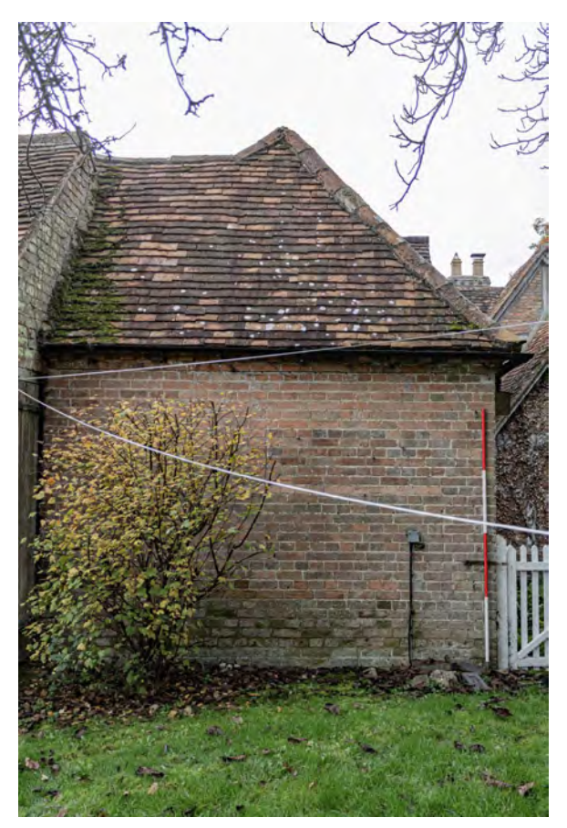
Plate 56 (050): Farmhouse, North-East Elevation, general view from the north-east