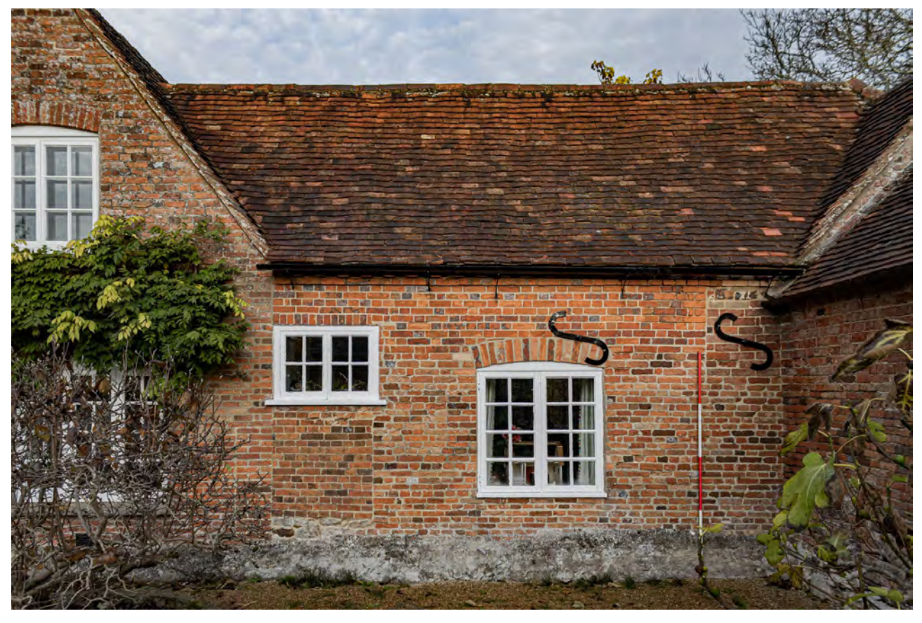
Plate 61 (012): Farmhouse, South-East Elevation, general view from the south-east