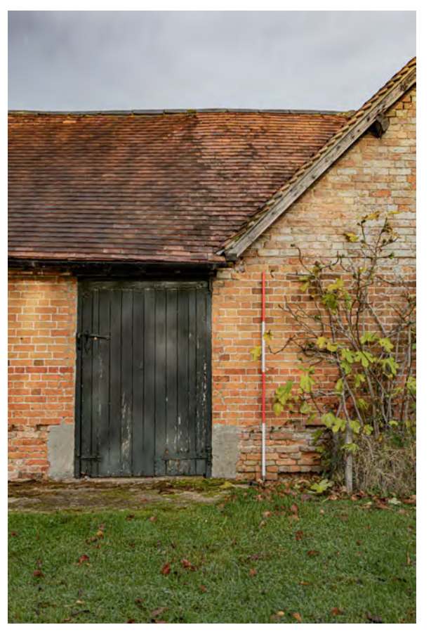
Plate 40 (031): Cart Store, South-East Elevation, detail of doorway [15] from the south-east