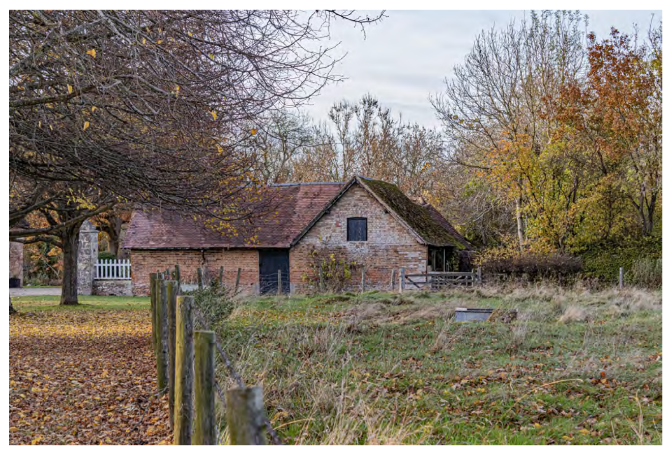
Plate 35 (119): Cart Store, South-East Elevation, general view from the SSE