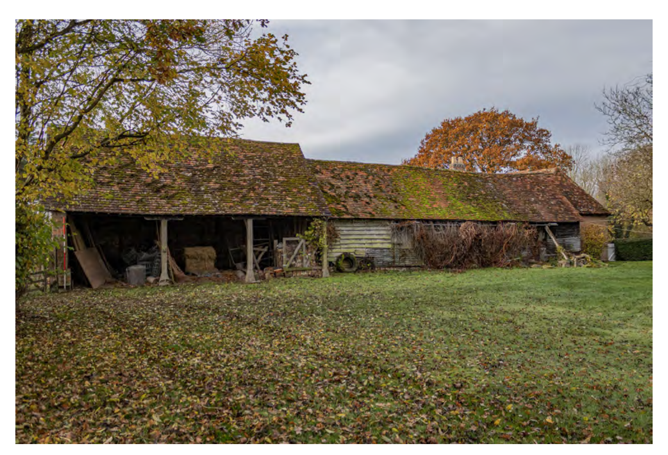
Plate 44 (037): Cart Store, North-East Elevation, general view from the ENE