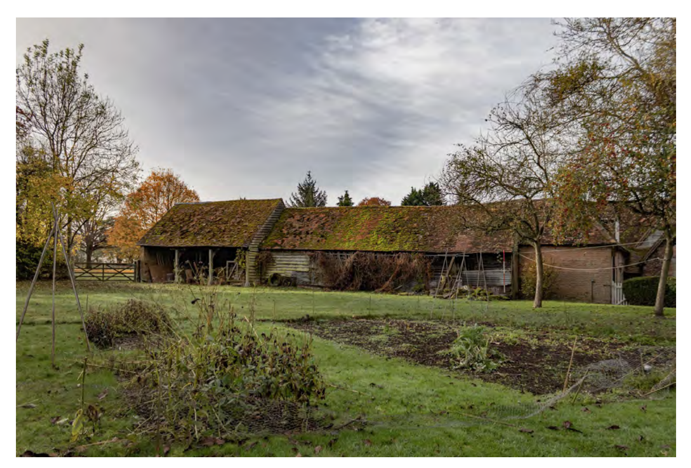
Plate 46 (039): Cart Store, North-East Elevation, general view from the NNE