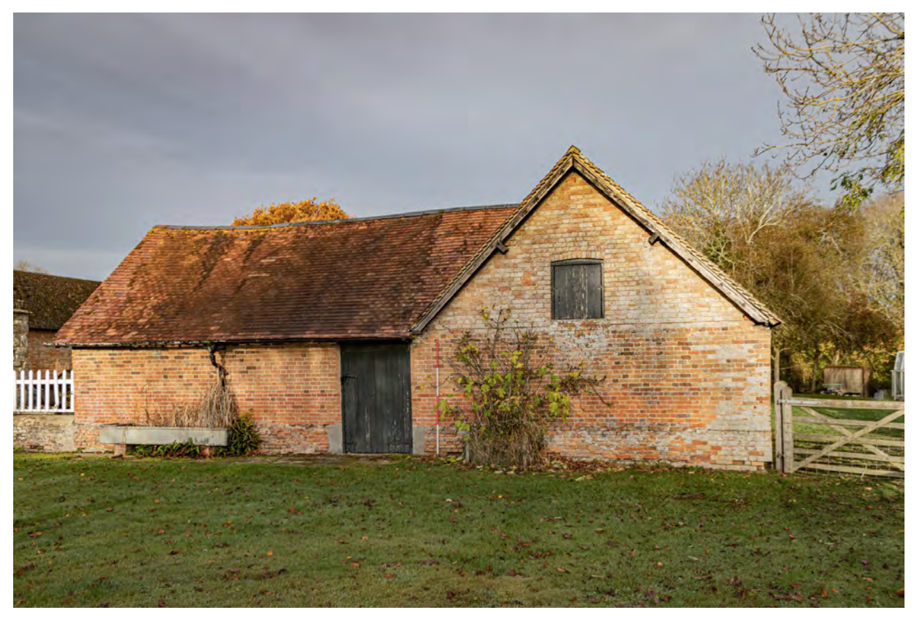
Plate 37 (029): Cart Store, South-East Elevation, general view from the SSE