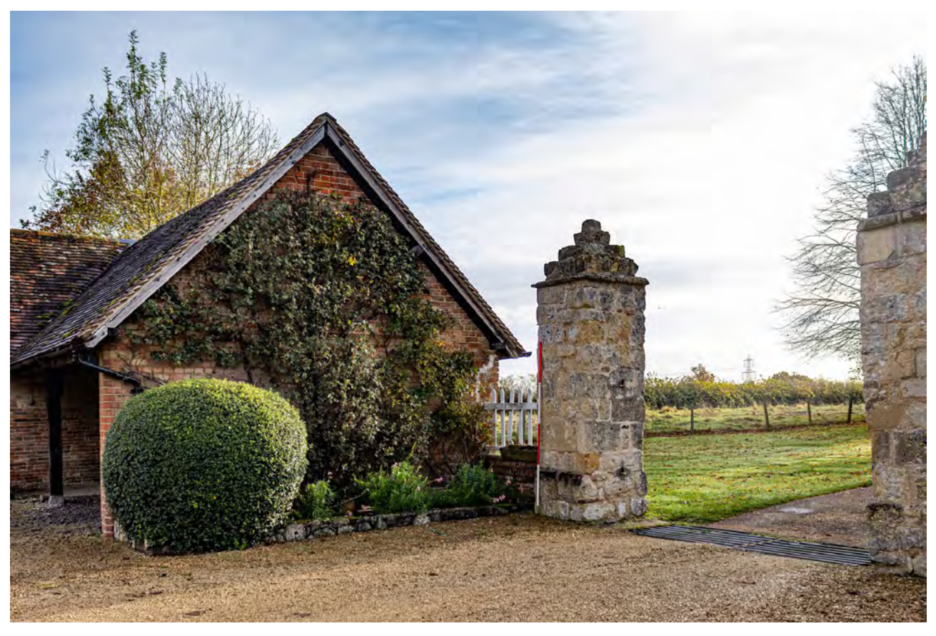
Plate 31 (023): Cart Store, South-West Elevation, general view from the west

OLD ANGROVE FARM, HORTON-CUM-STUDLEY, BUCKINGHAMSHIRE: AN HISTORIC BUILDING RECORD REPORT