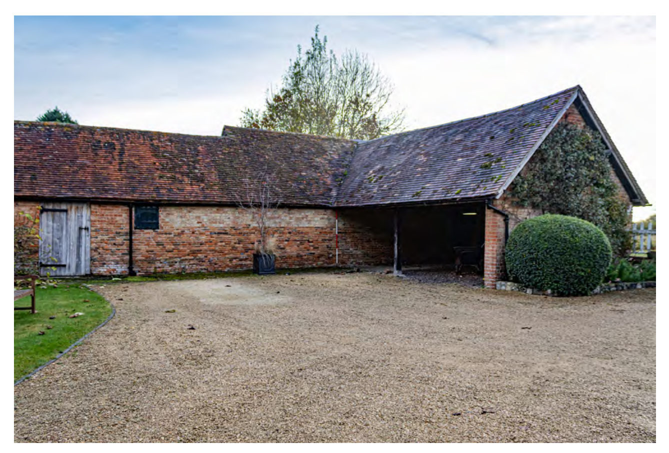
Plate 8 (001): Cow Shed, South-West Elevation, general view from the west