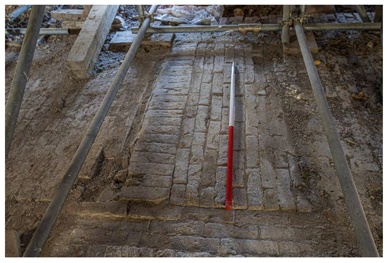
Plate 73 (105): Room 1, detail of the row of stretchers set in the brick floor, from the south-west