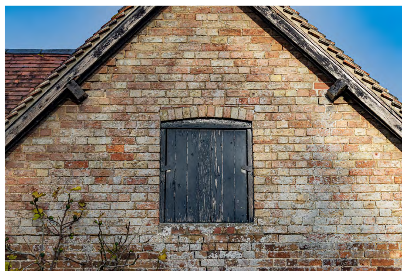
Plate 43 (030): Cart Store, South-East Elevation, detail of attic hatch from the south-east