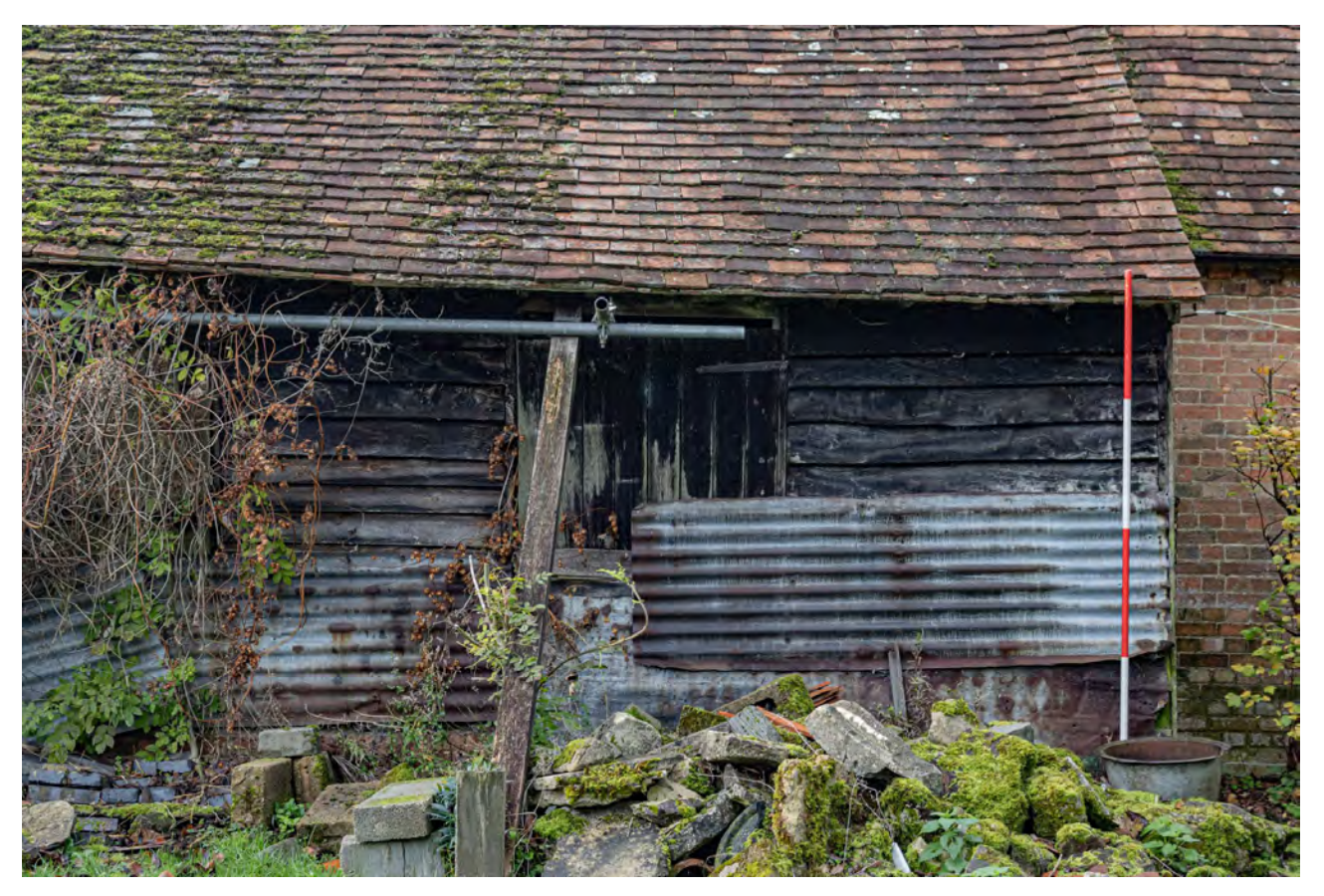
Plate 54 (047): Cow Shed, North-East Elevation, detail of north-westernmost hatch from the north-east

Plate 53 (046): Cow Shed, North-East Elevation, detail of south-easternmost hatch from the north-east