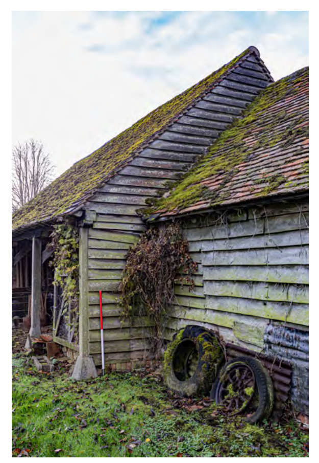
Plate 57 (045): Cart Shed, North-West Elevation, general view from the north