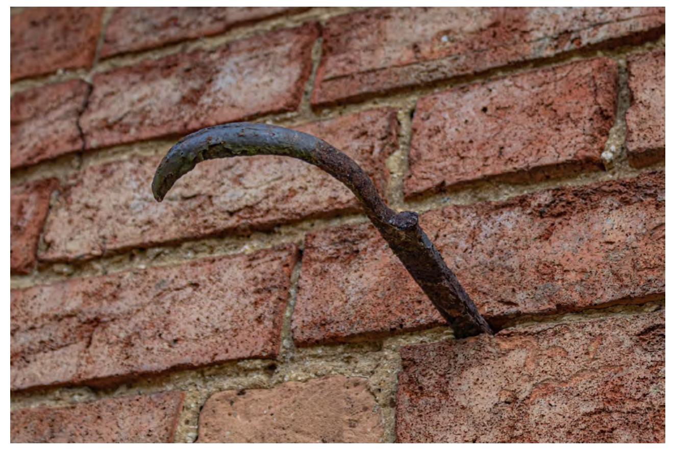
Plate 21 (014): Cow Shed, South-West Elevation, detail of hook in the north-west side of the wall from the south