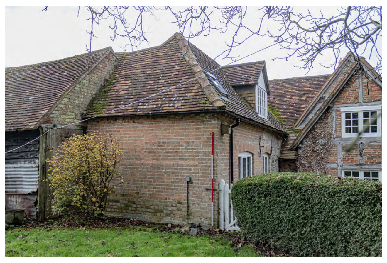
Plate 55 (051): Farmhouse, North-East Elevation, general view from the NNE