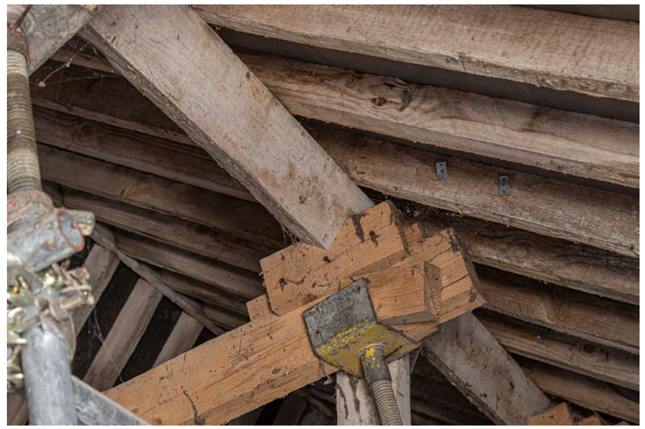
Plate 68 (069): Room 1, detail of supporting scaffolding pole supporting the purlin beams, from the WNW