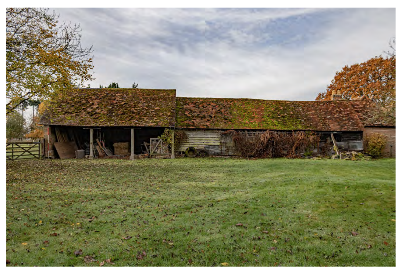
Plate 45 (035): Cart Store, North-East Elevation, general view from the north-east