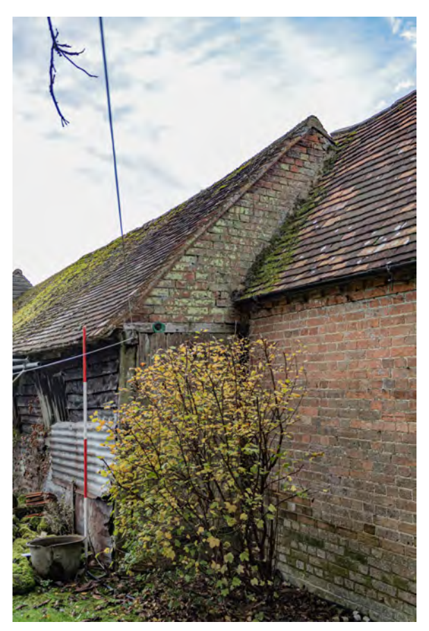
Plate 58 (049): Cow Shed, North-West Elevation, general view from the north