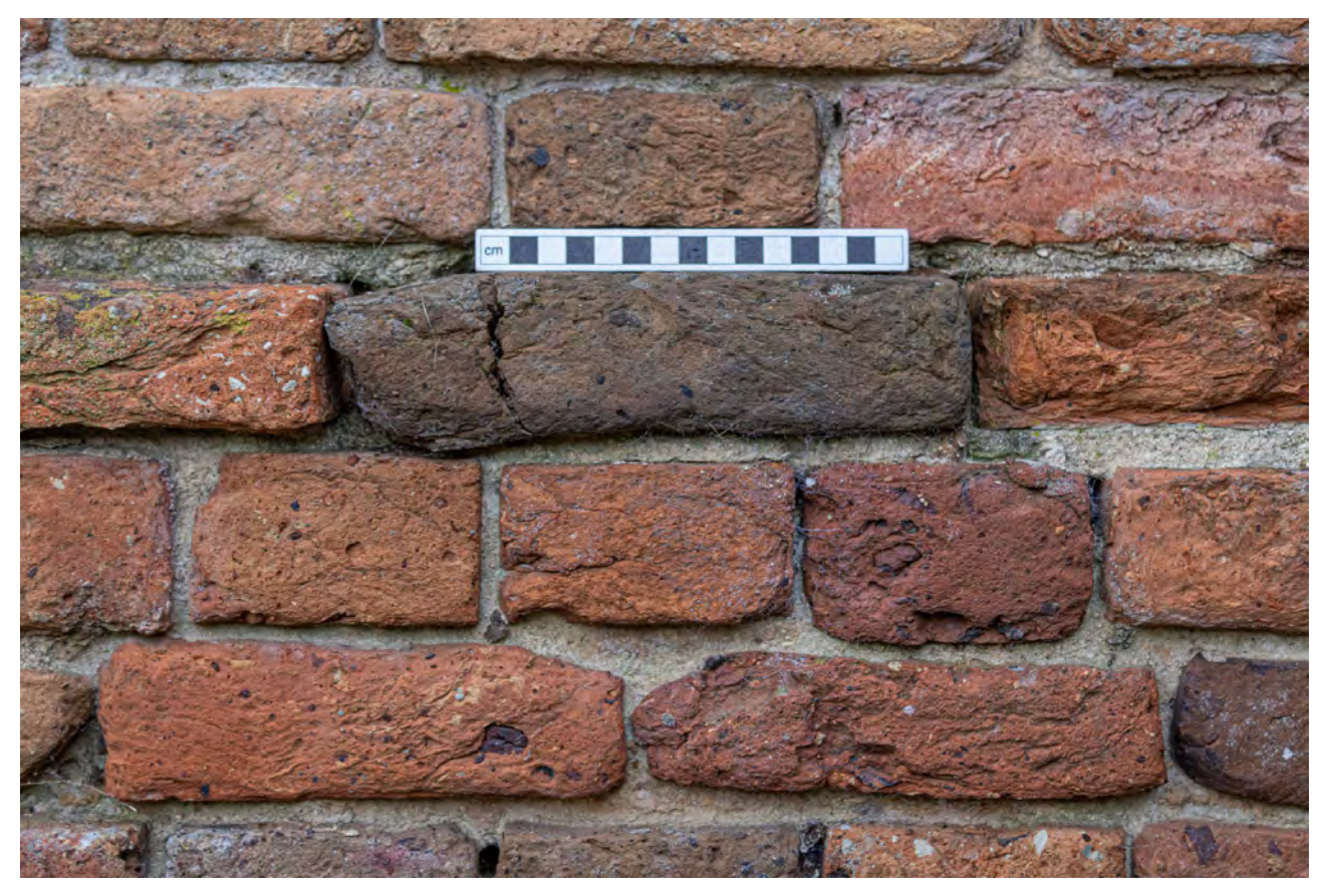
Plate 13 (018): Cow Shed, South-West Elevation, detail of wall [01] from the south-west