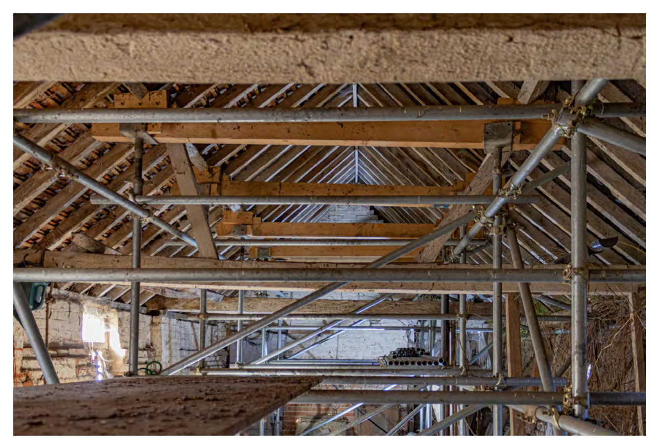
Plate 64 (070): Room 1, general view from the south-east