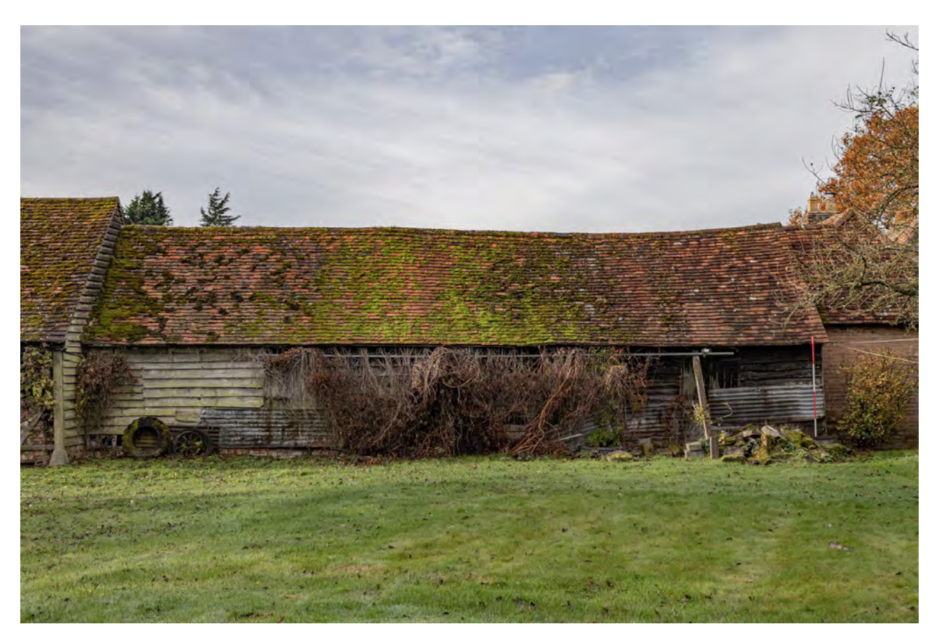
Plate 48 (038): Cart Store, North-East Elevation, general view of the Cow Shed from the north-east