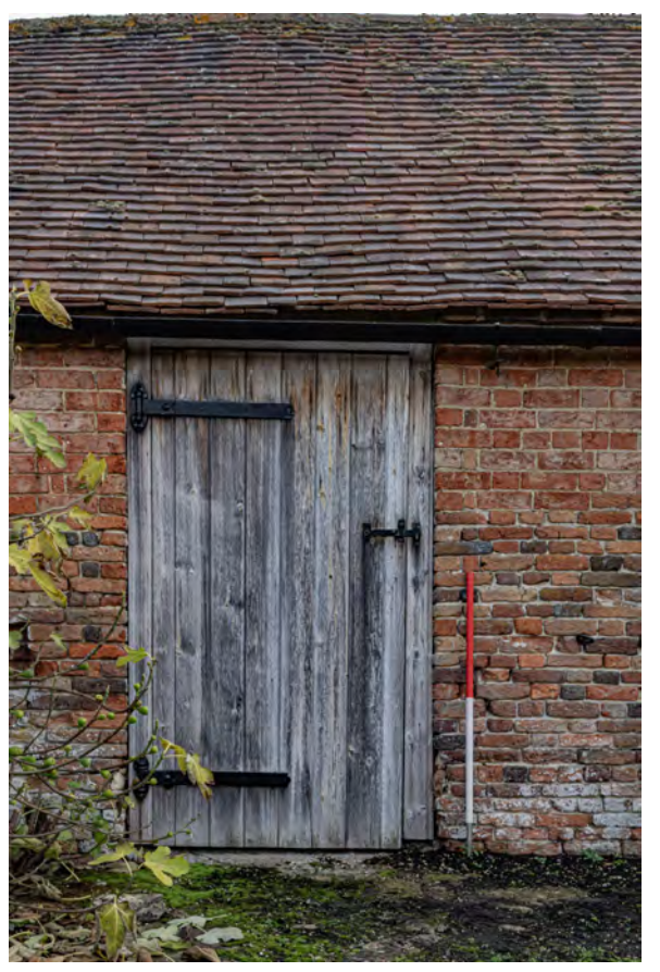
Plate 17 (006): Cow Shed, South-West Elevation, detail of doorway [04] from the south-west