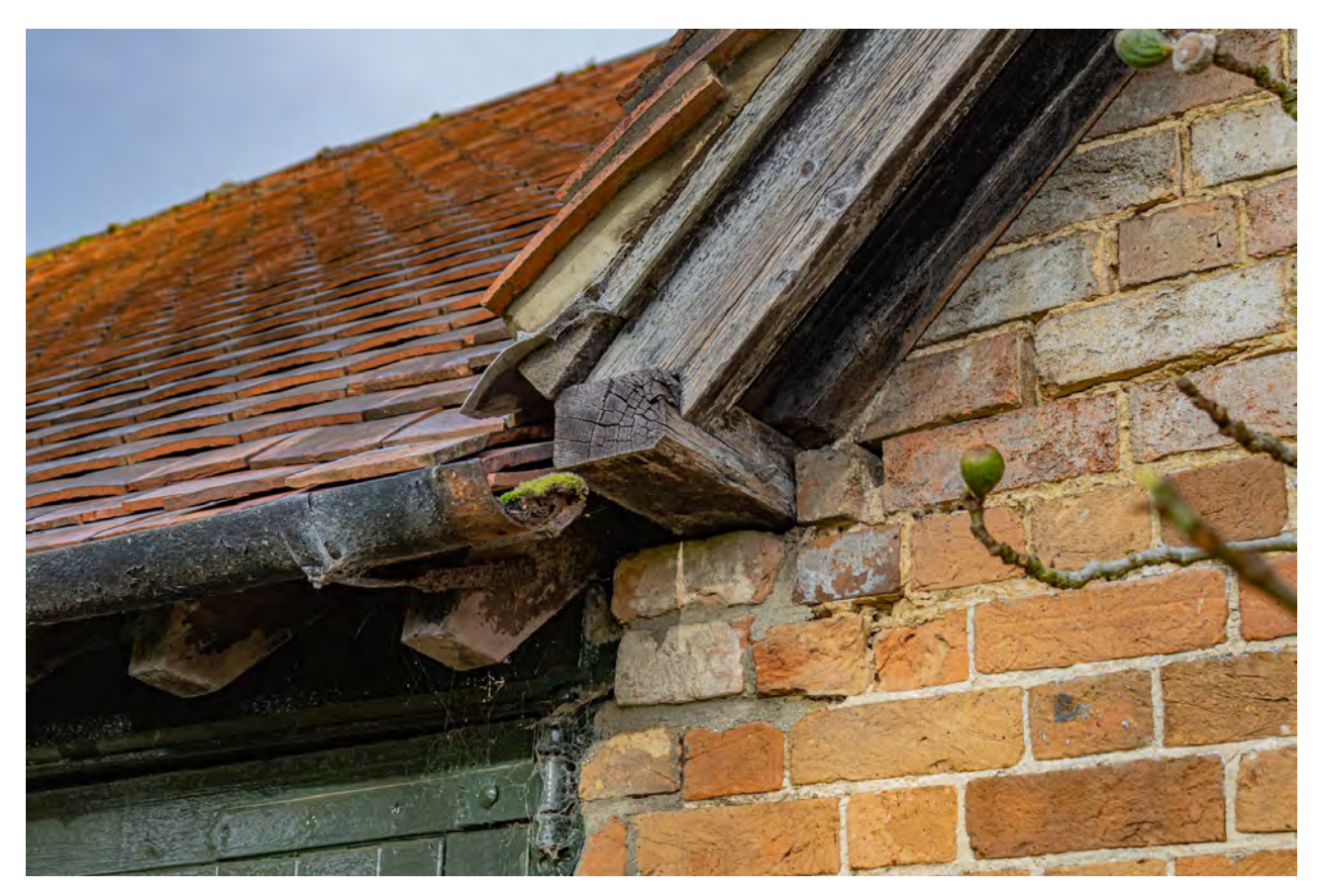
Plate 42 (034): Cart Store, South-East Elevation, detail of beam in the east