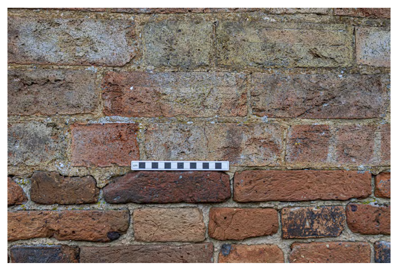
Plate 16 (015): Cow Shed, South-West Elevation, detail of wall [03] from the south-west