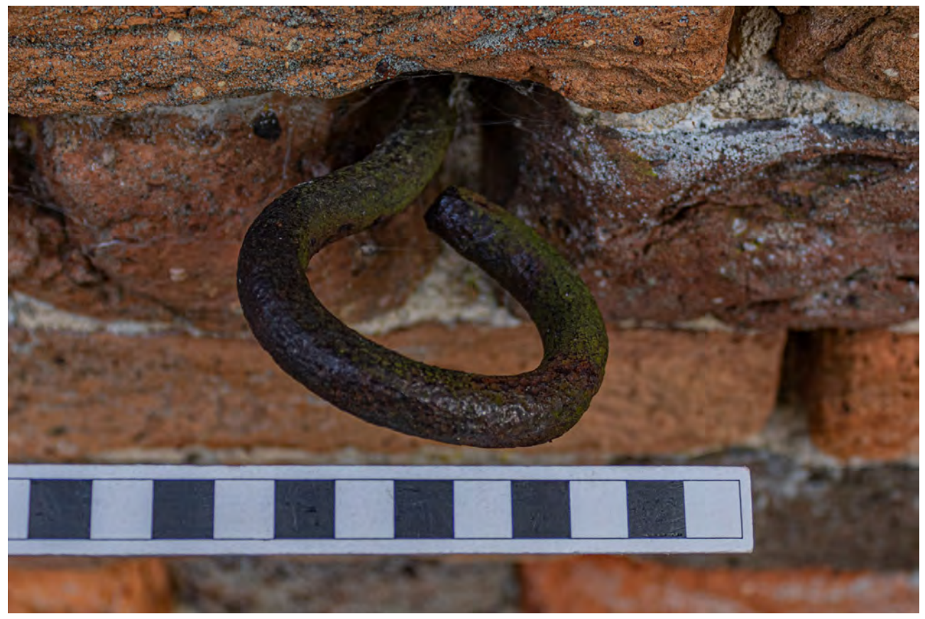
Plate 22 (008): Cow Shed, South-West Elevation, detail of the hook to the south-east side of the doorway from the south-west