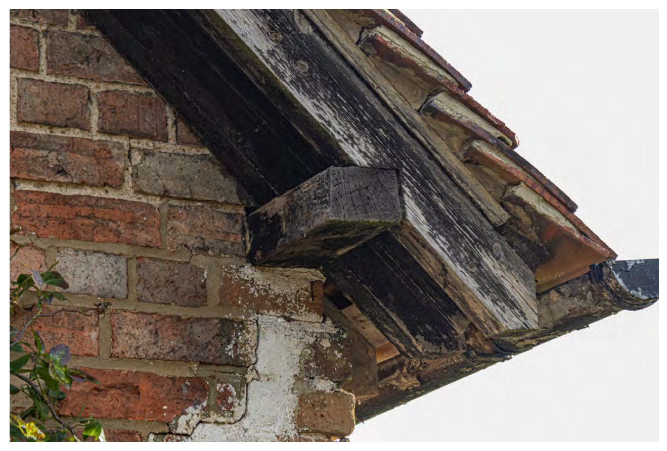
Plate 33 (025): Cart Store, South-West Elevation, detail of the south-east side, from the WSW