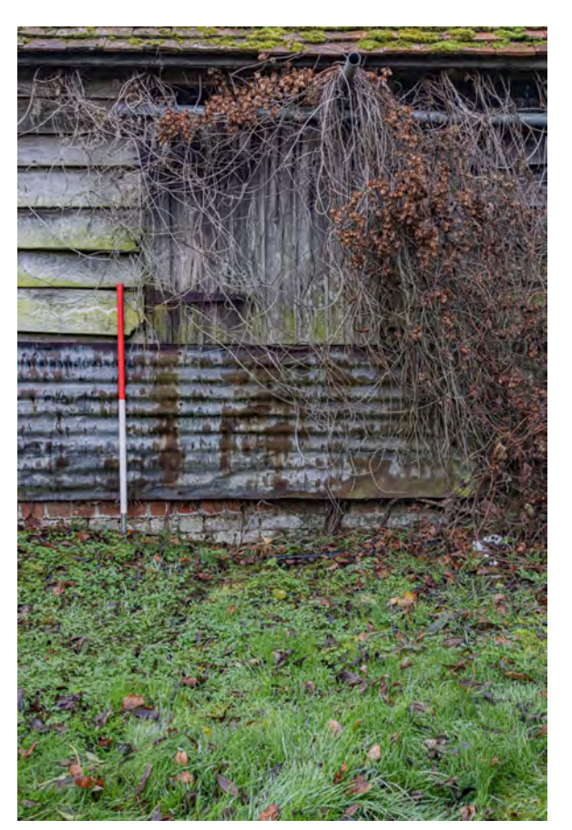
Plate 53 (046): Cow Shed, North-East Elevation, detail of south-easternmost hatch from the north-east