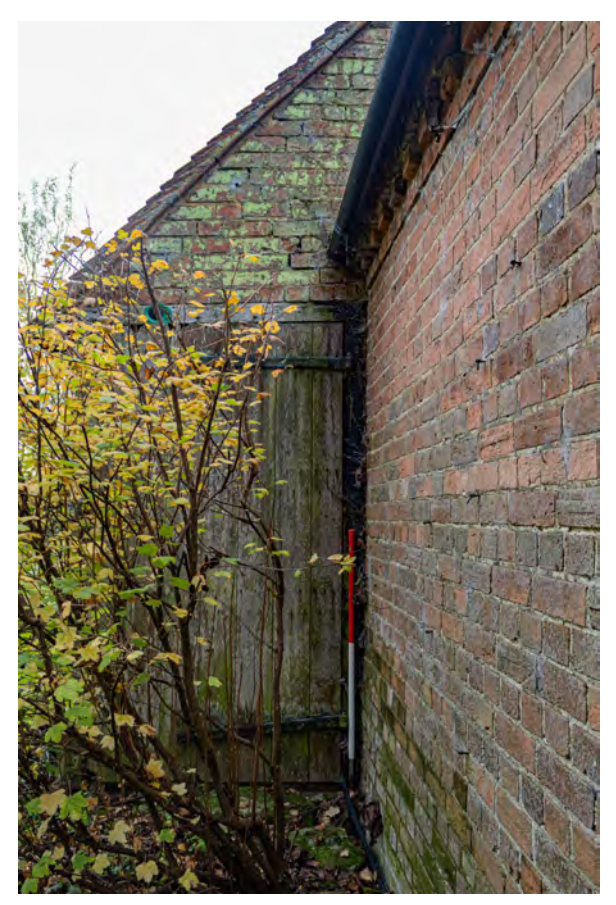
Plate 59 (052): Cow Shed, North-West Elevation, detail of door [25] from the north-west