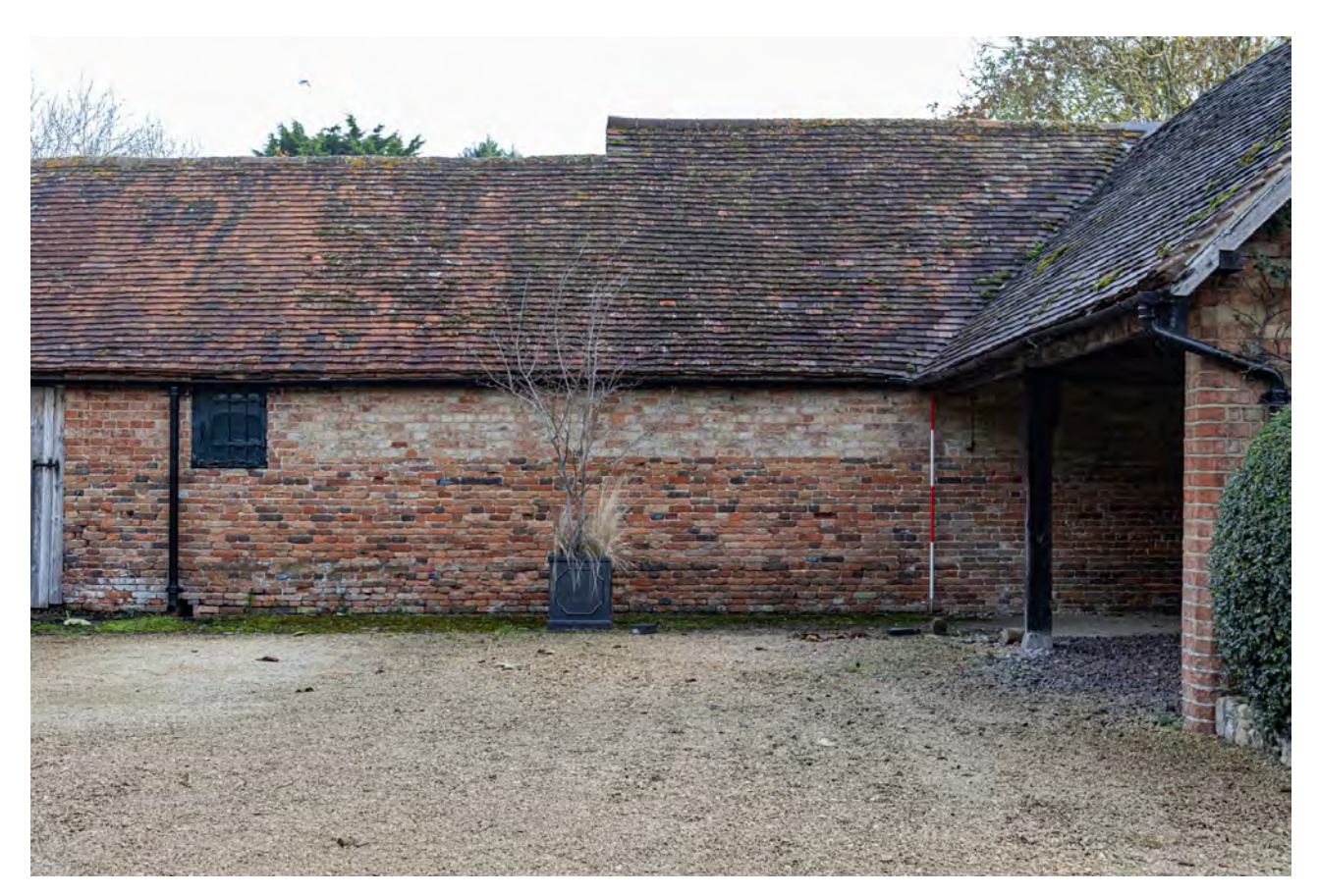
Plate 10 (003): Cow Shed, South-West Elevation, general view from the south-west