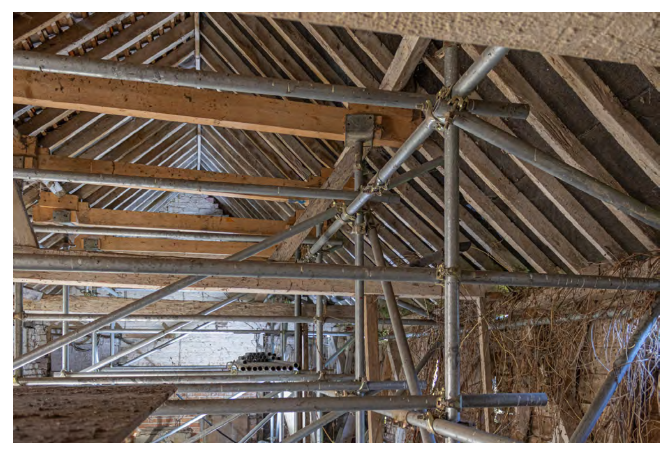
Plate 66 (072): Room 1, general view from the south