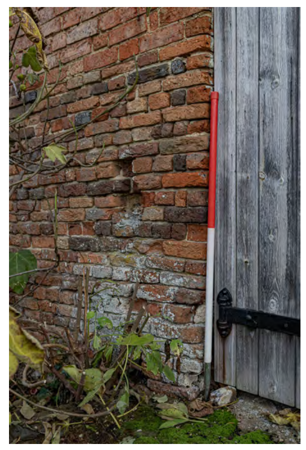
Plate 23 (019): Cow Shed, South-West Elevation, detail of the broken-away brickwork to the north-west side of the doorway, from the south