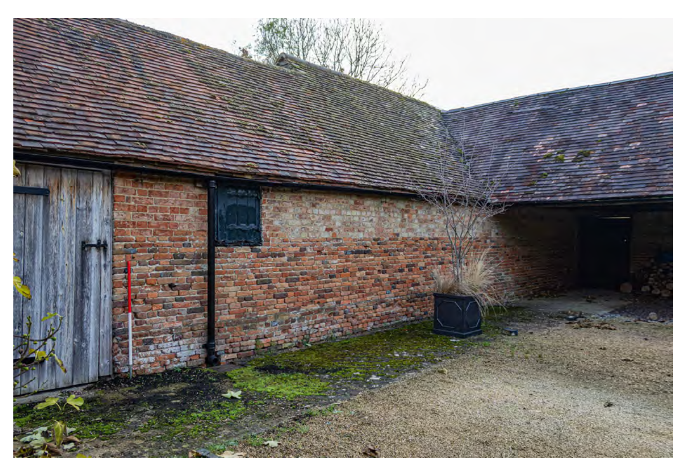
Plate 14 (007): Cow Shed, South-West Elevation, general view of the south-east side from the north-west