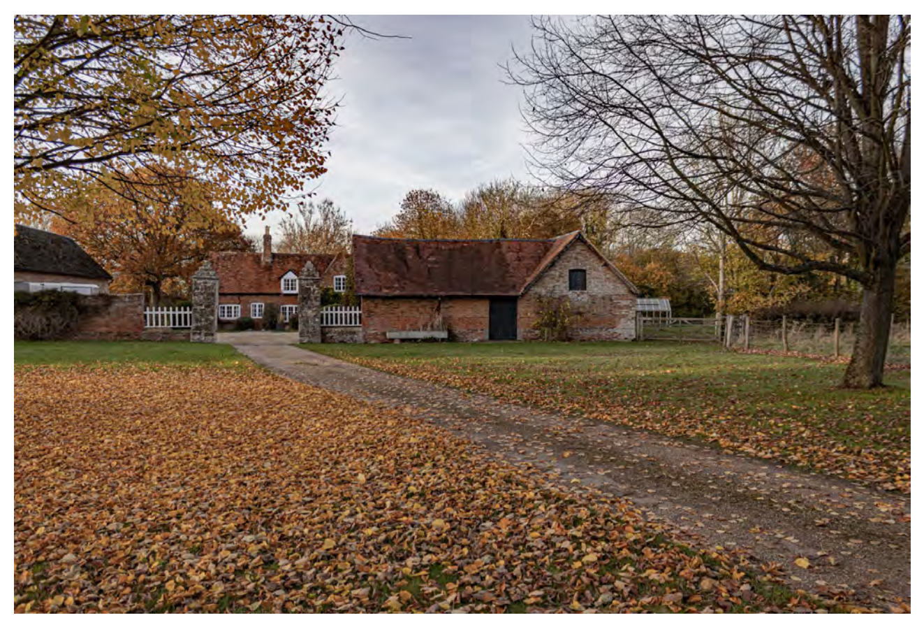
Plate 5 (116): General view of Old Arngrove Farm in its setting, from the south