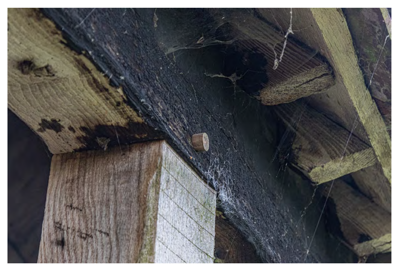
Plate 52 (042): Cart Store, North-East Elevation, detail of peg and top of post [19] from the north-east