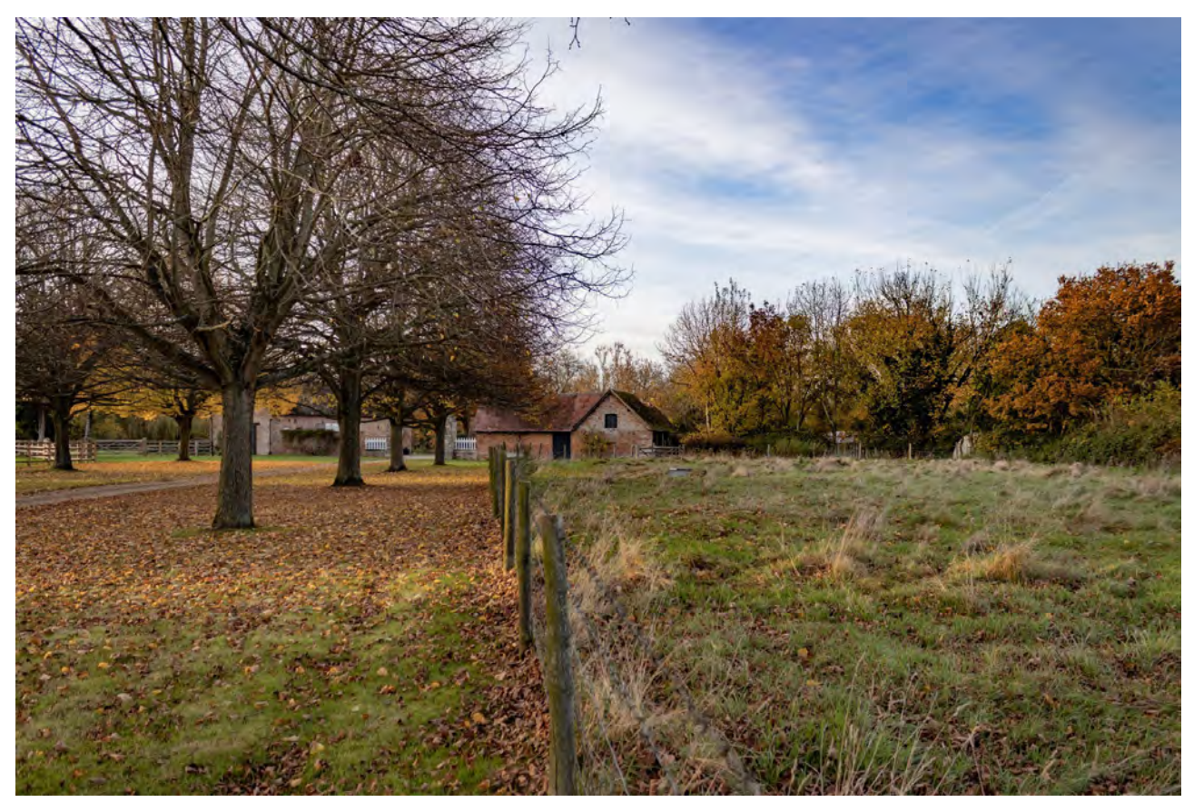
Plate 3 (120): General view of Old Arngrove Farm in its setting, from the south-east