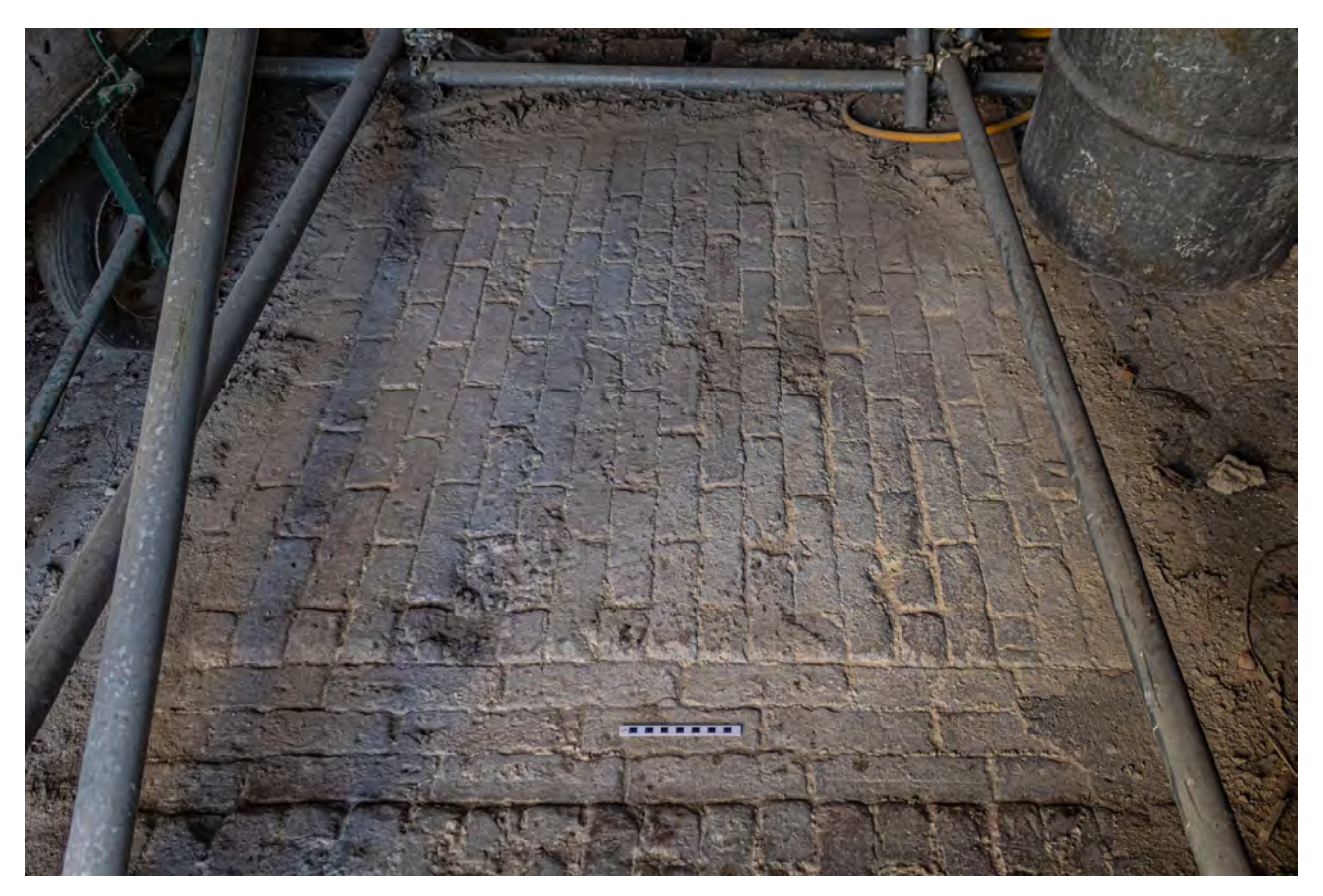
Plate 70 (061): Room 1, detail of brick floor and drain from the south-west