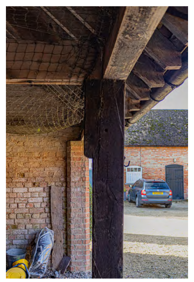
Plate 27 (081): Cart Store, North-West Elevation, detail of post from the north-west