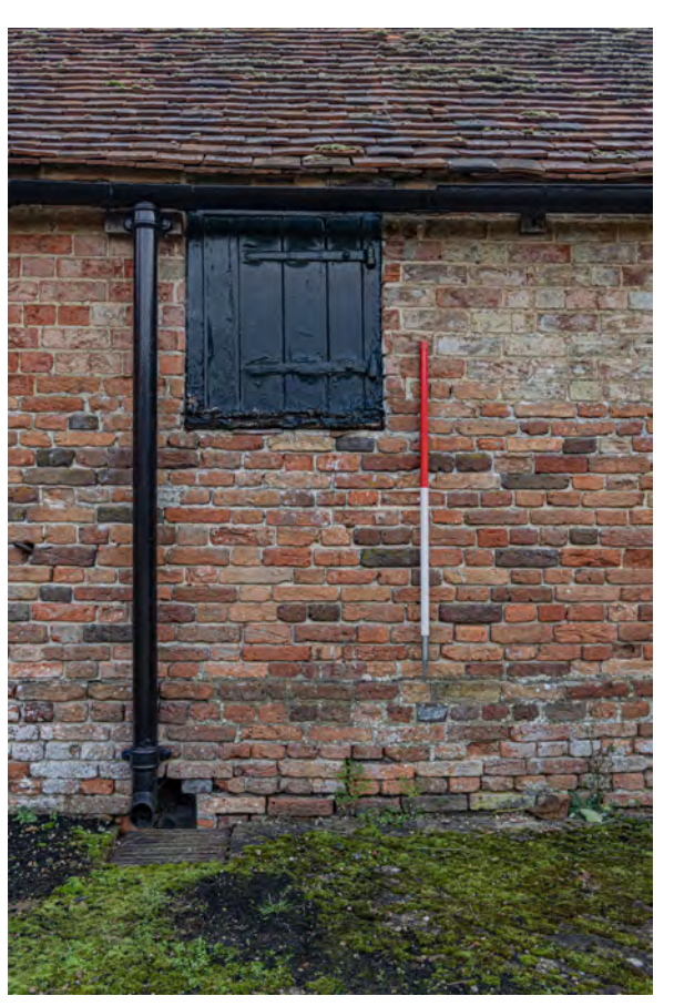
Plate 18 (005): Cow Shed, South-West Elevation, detail of hatch [06] from the south-west