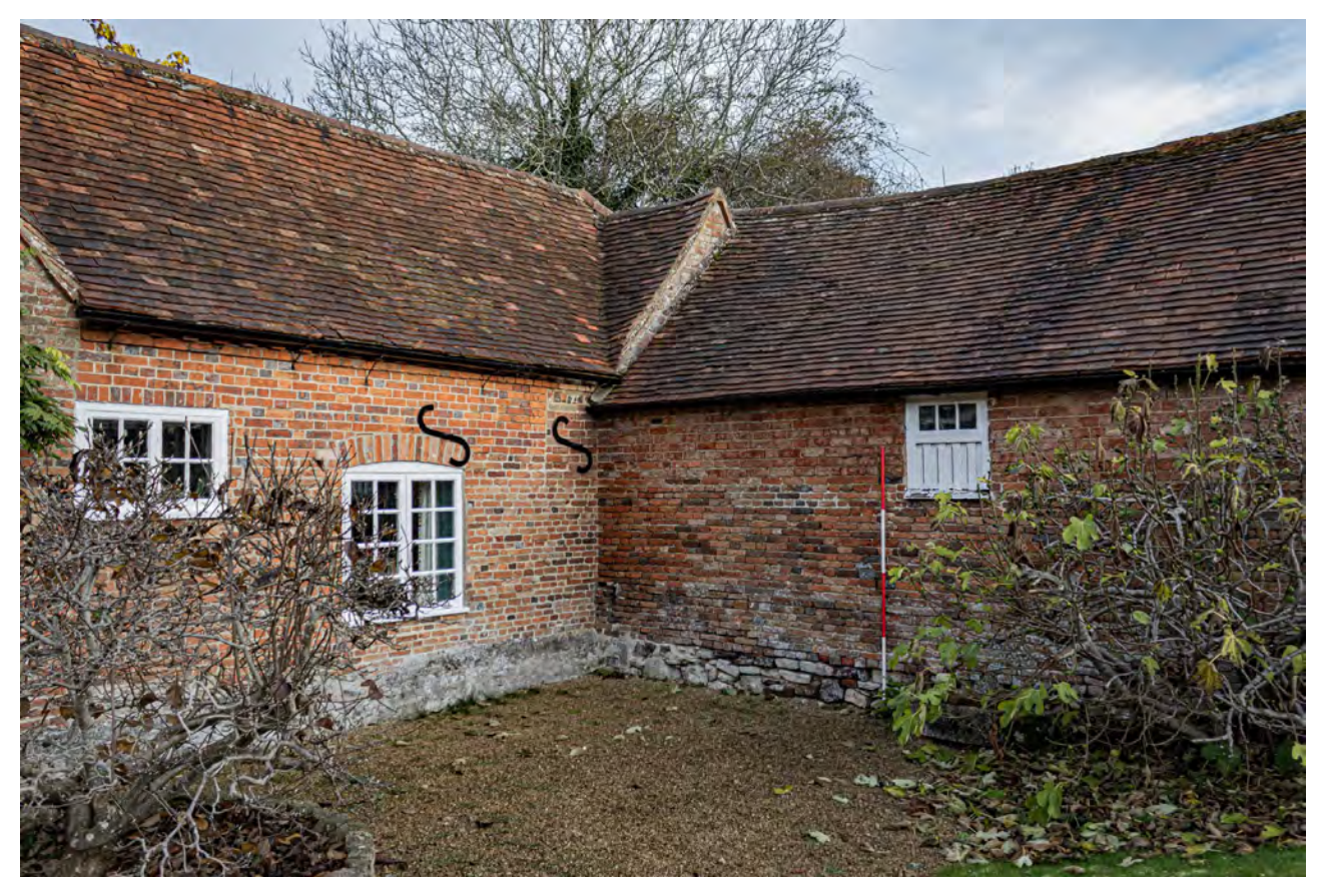
Plate 19 (010): Cow Shed, South-West Elevation, general view of the north-west side, from the SSW