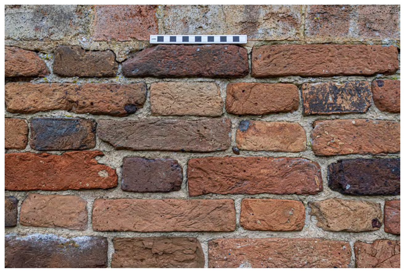
Plate 15 (016): Cow Shed, South-West Elevation, detail of wall [02] from the south-west