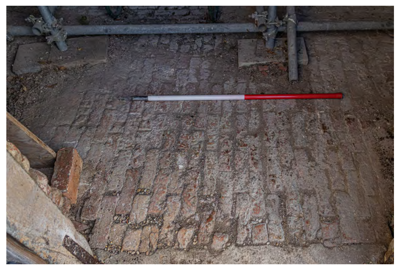
Plate 69 (059): Room 1, detail of brick floor [26], from the south-west