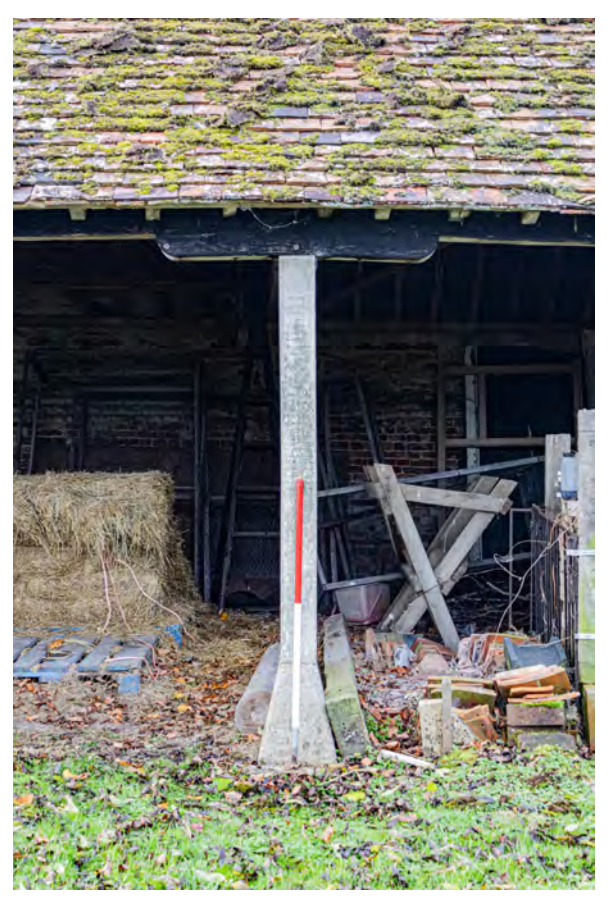
Plate 50 (040): Cart Store, North-East Elevation, detail of post [19] from the north-east