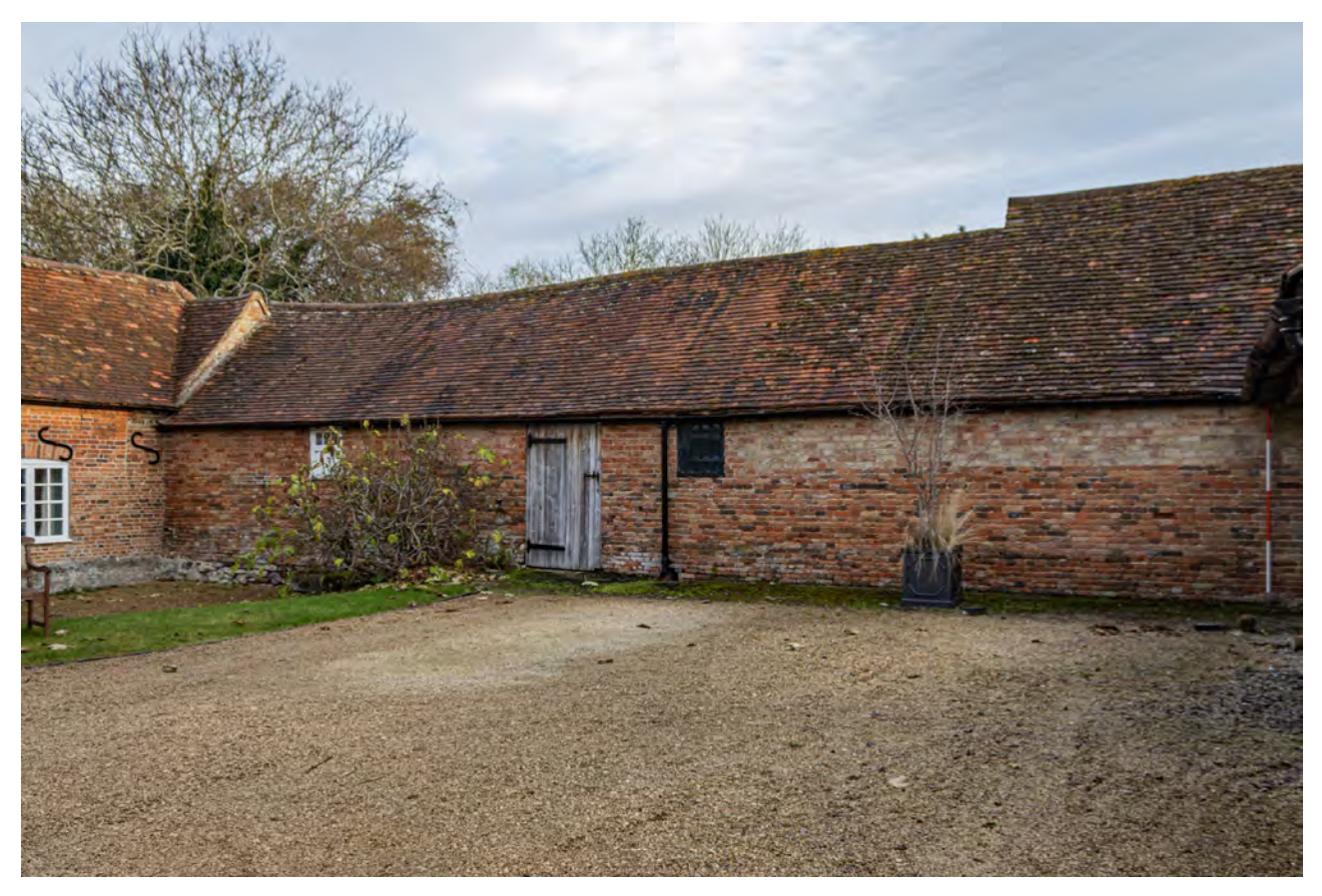
Plate 11 (004): Cow Shed, South-West Elevation, general view from the WSW