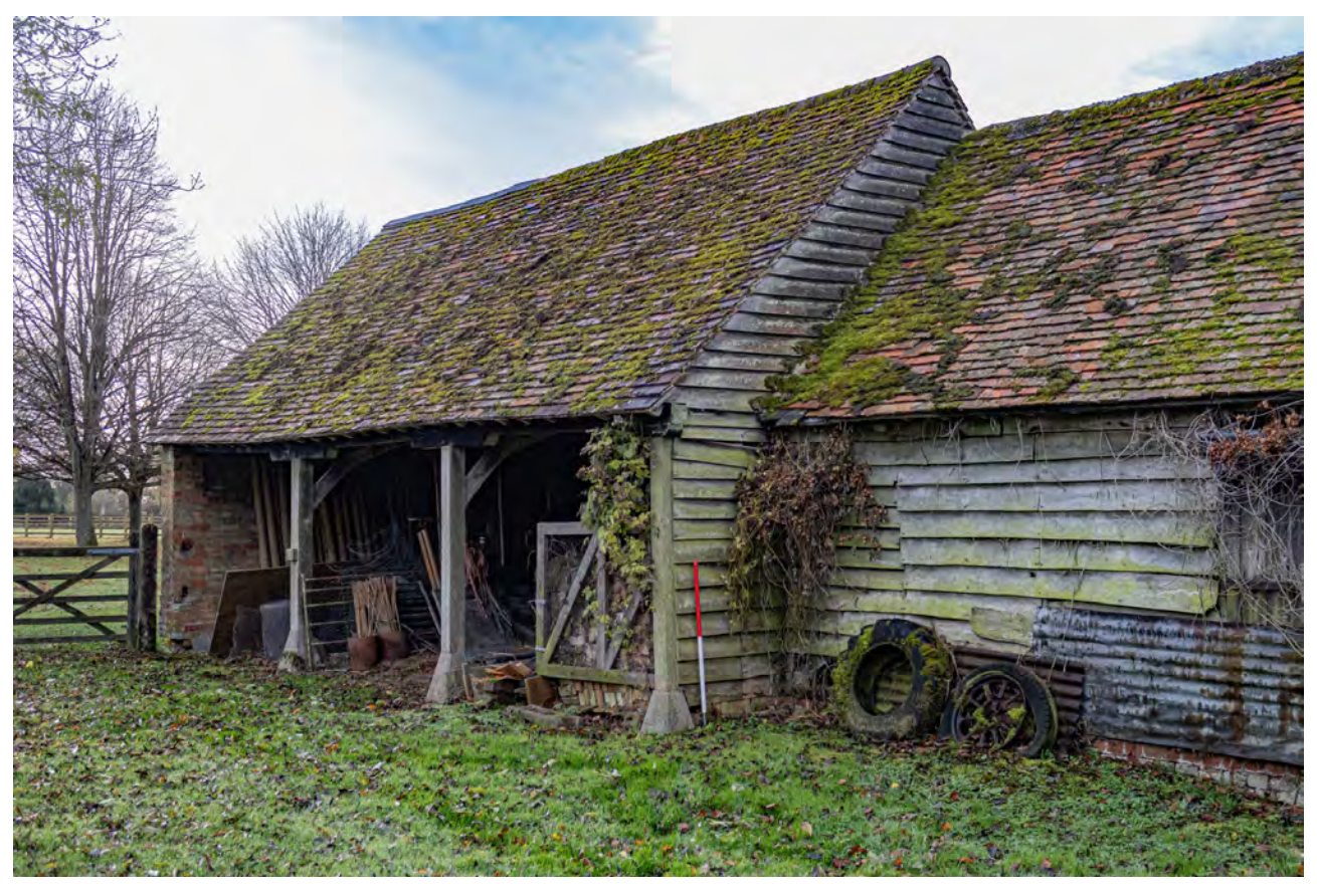
Plate 49 (044): Cart Store, North-East Elevation, general view from the west