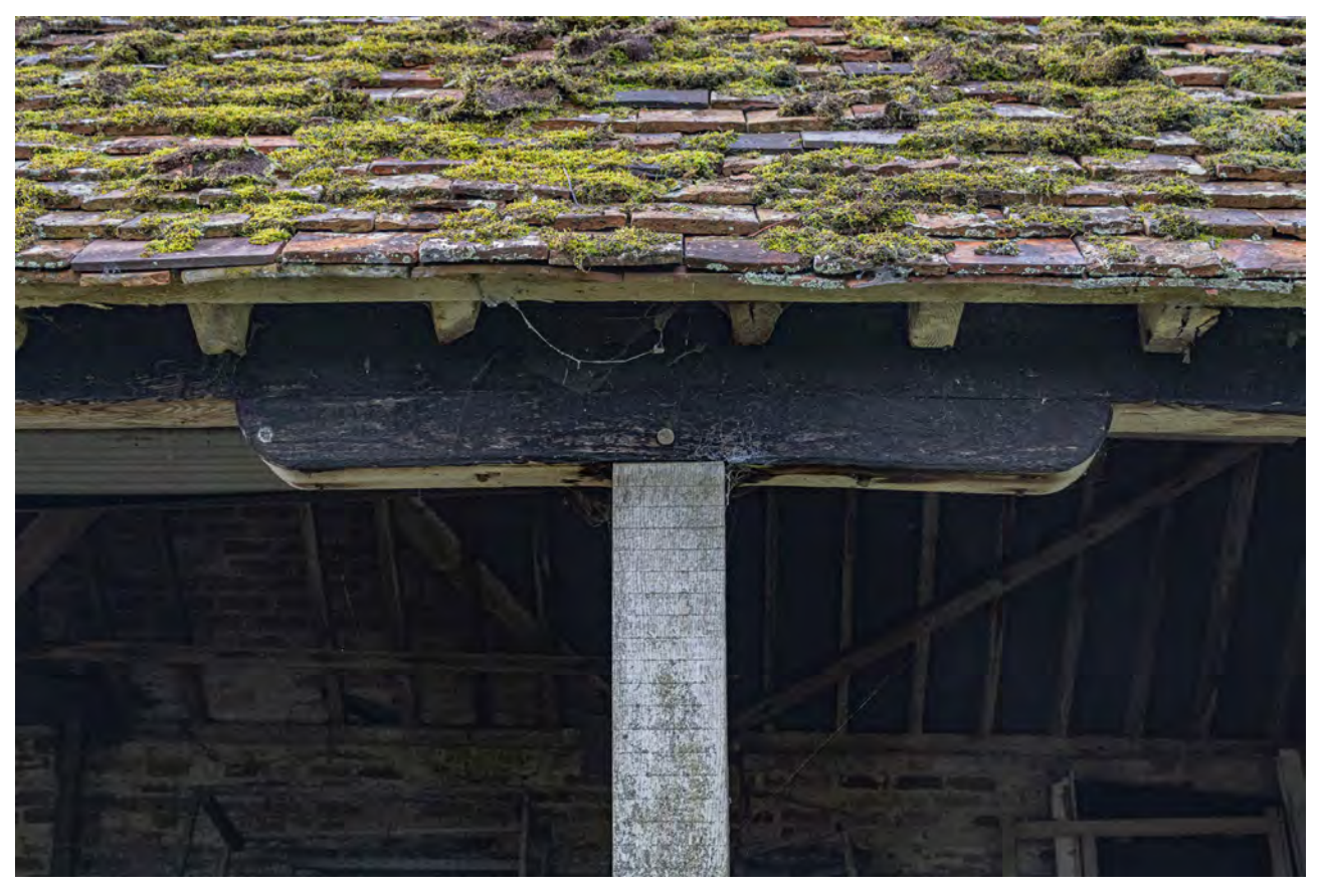
Plate 51 (041): Cart Store, North-East Elevation, detail of top of post [19] from the north-east