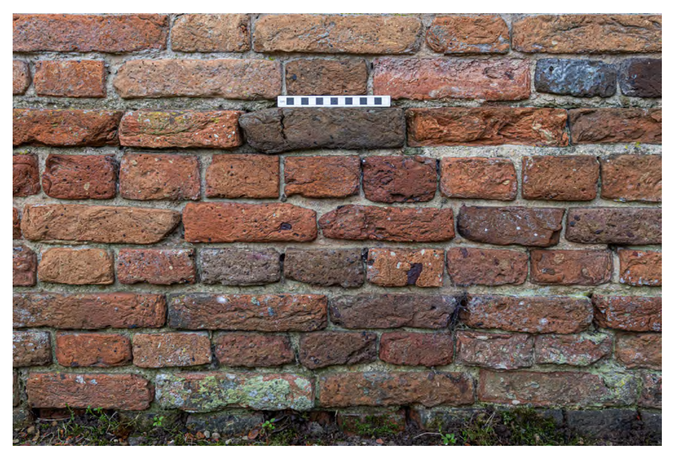
Plate 12 (017): Cow Shed, South-West Elevation, detail of wall [01] from the south-west