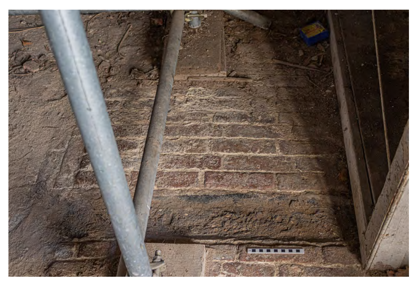
Plate 72 (064): Room 1, detail of brick floor and drain from the north-west