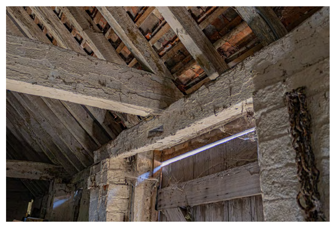
Plate 74 (111): Room 1, detail of timber lintel over the doorway in the south-west elevation, from the north