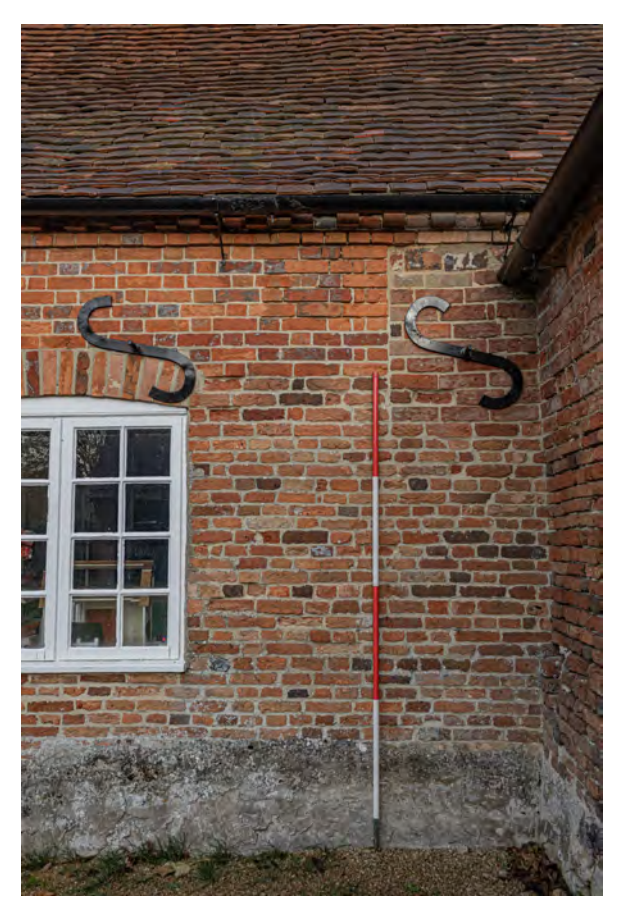
Plate 62 (013): Farmhouse, South-East Elevation, detail of the blocked window in the north-east side, from the south-east