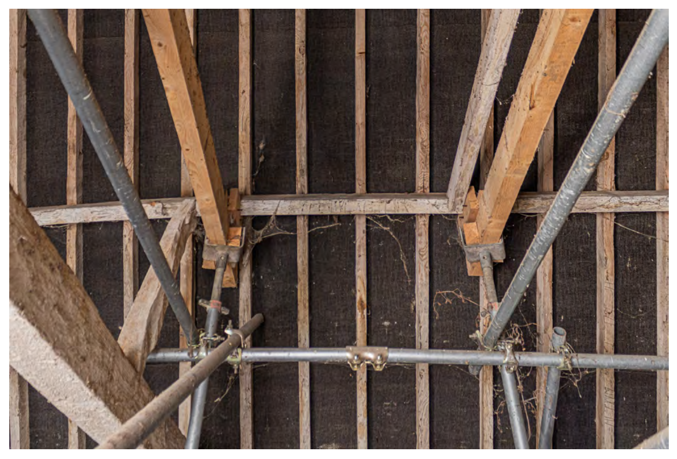
Plate 67 (074): Room 1, detail of the underside of the roof on the north-east side showing the scaffolding poles, from the south-west