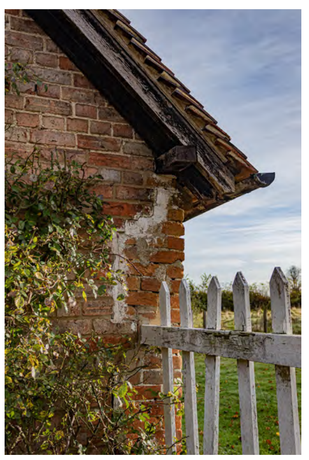
Plate 34 (026): Cart Store, South-West Elevation, detail of the scar for the former rainwater goods, from the south-west