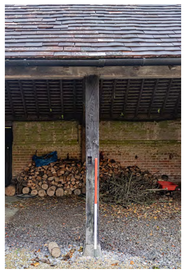
Plate 25 (021): Cart Store, North-West Elevation, detail of post from the north-west