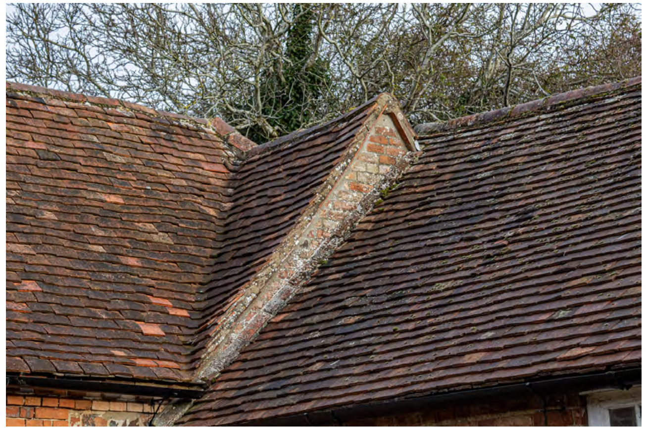
Plate 24 (011): Cow Shed, South-West Elevation, detail of gable of Farmhouse rising above the Cow Shed, from the south