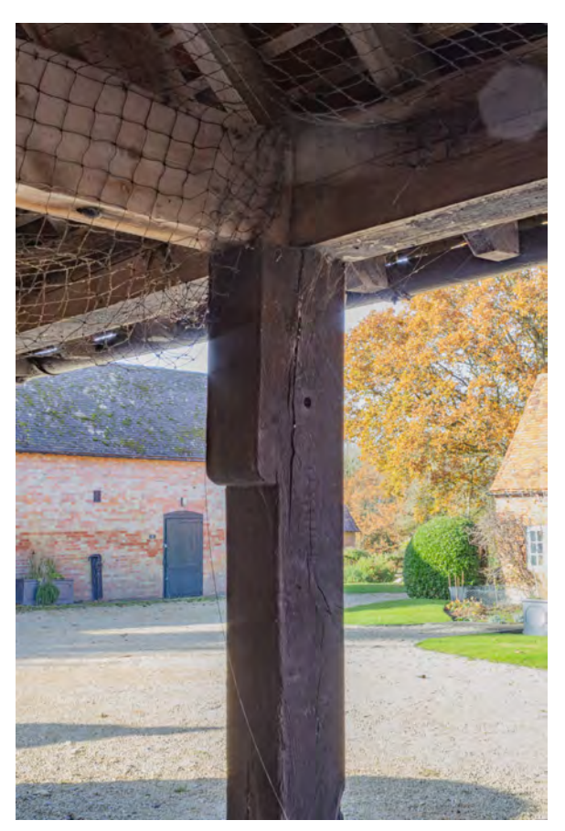
Plate 28 (082): Cart Store, North-West Elevation, detail of post from the south-east