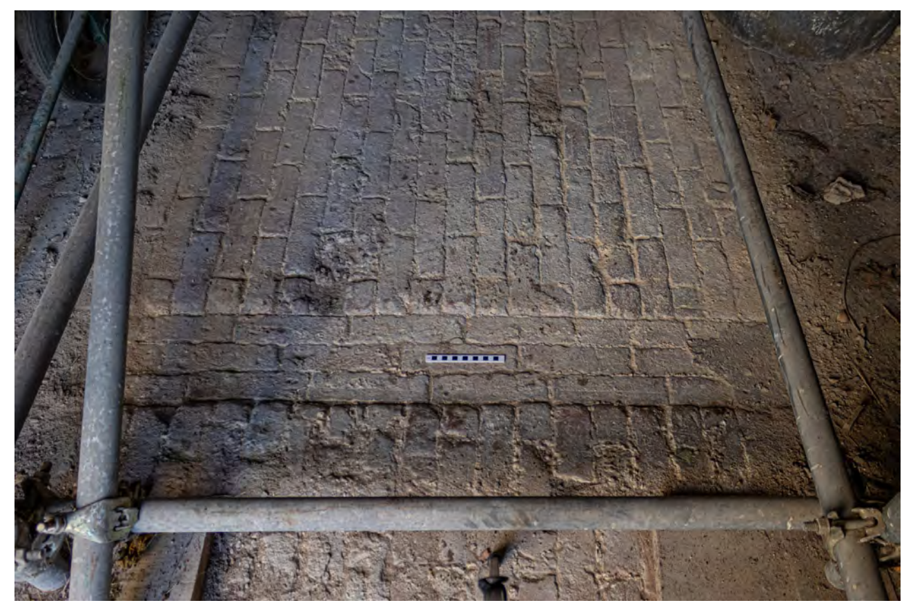
Plate 71 (060): Room 1, detail of brick floor and drain from the south-west