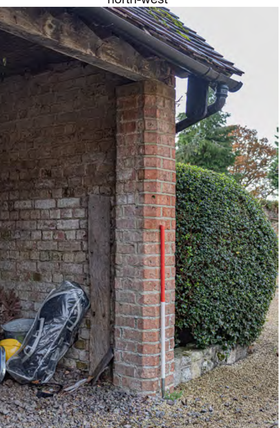
Plate 30 (020): Cart Store, North-West Elevation, detail of chamfered brick post in the south-west side, from the ENE