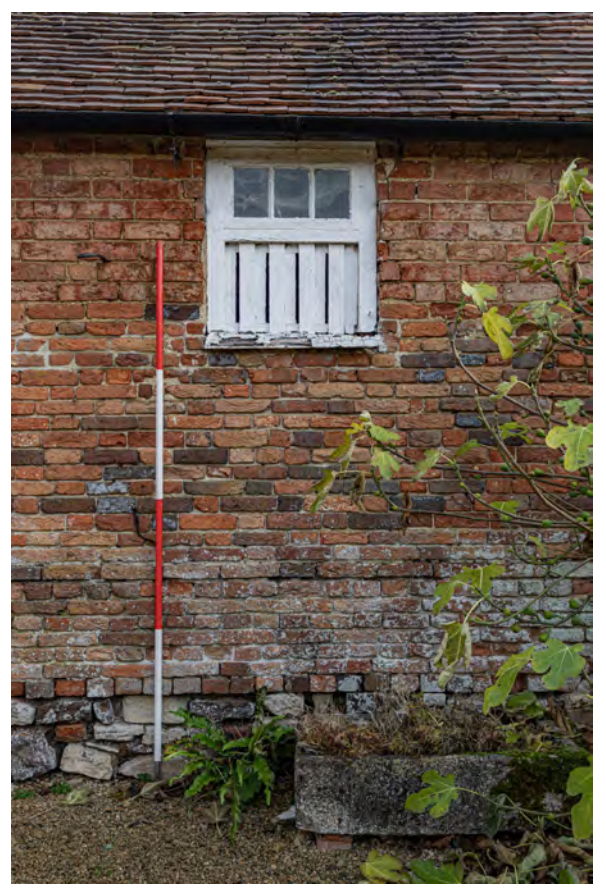
Plate 20 (009): Cow Shed, South-West Elevation, detail of opening [05] from the south-west

Plate 19 (010): Cow Shed, South-West Elevation, general view of the north-west side, from the SSW