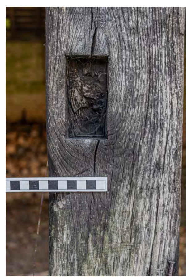
Plate 29 (022): Cart Store, North-West Elevation, detail of slot in the north-west facing side of post from the north-west