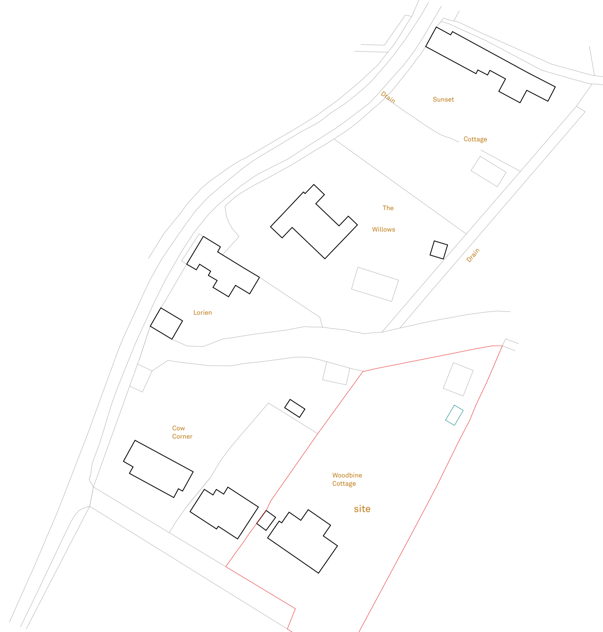
site plan 1:500

Mapping contents (c) Crown copyright and database rights 2021 Ordnance Survey 100035207