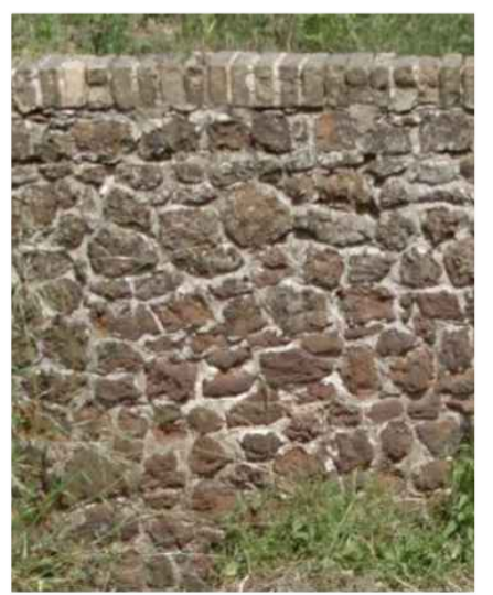
EXISTING CARRSTONE WALL

This drawing and the works depicted thereon are the copyright of Plandescil Consulting Engineers Ltd. Unauthorised reproduction infringes copyright.