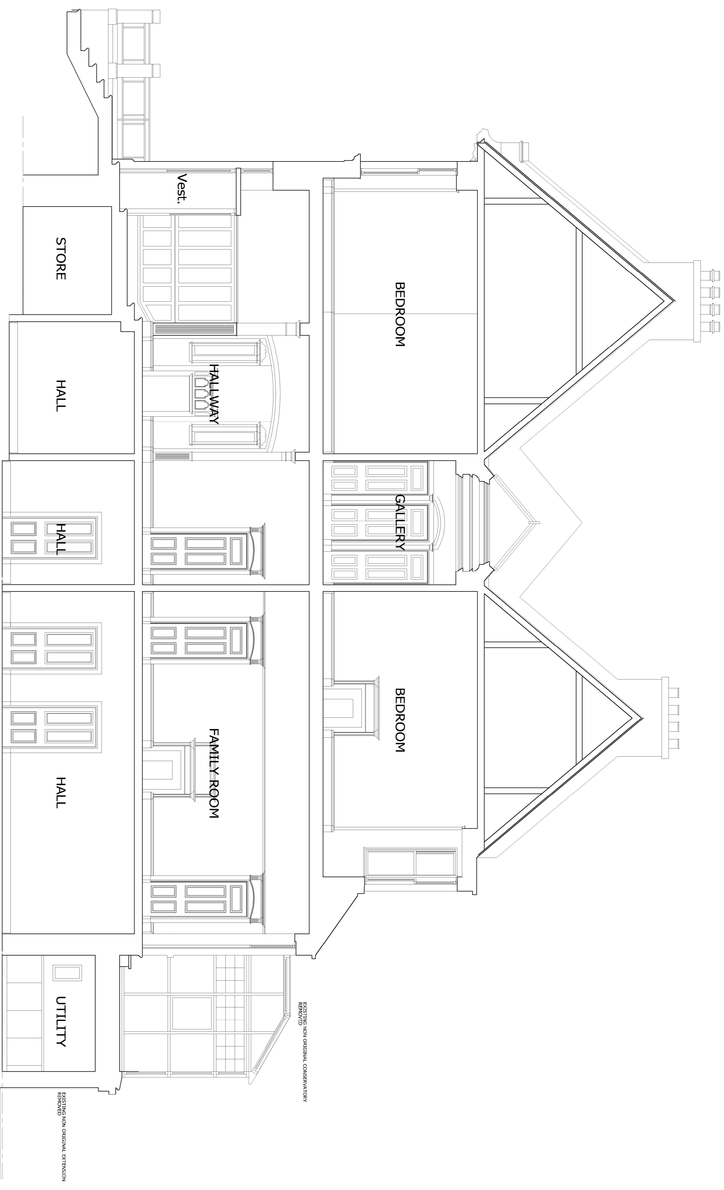
EXISTING SECTIONAL ELEVATION