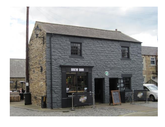
Currently in Grey