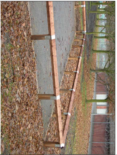
450mm high single rail fencing to 'V' notched posts secured with galv. strap