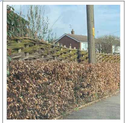
Example of hedge screening and woven willow fencing