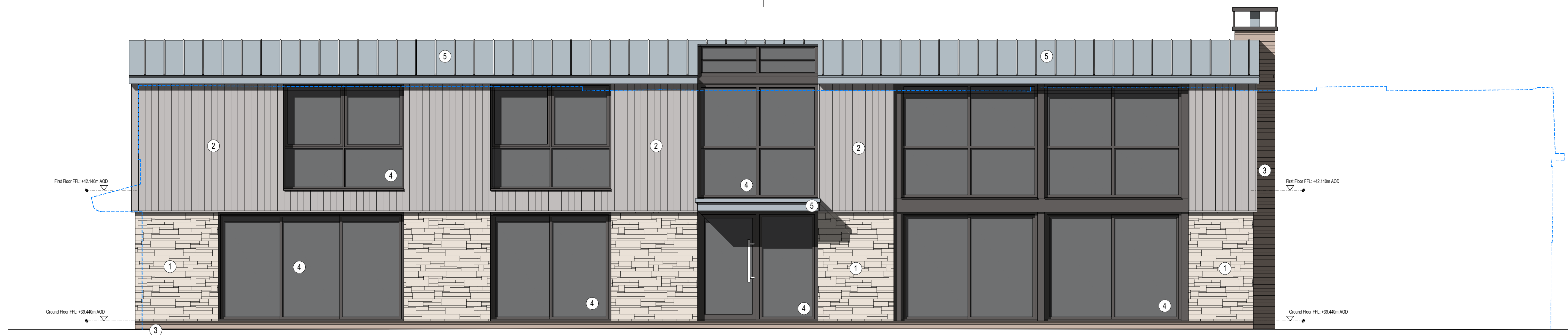
1 ELEVATION Proposed Garden Elevation SCALE 1: 50