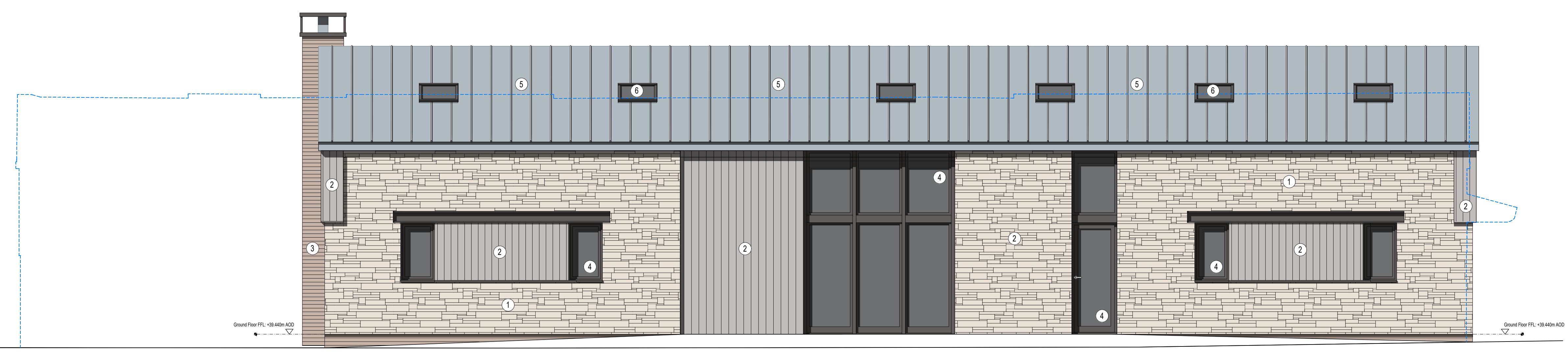
4 ELEVATION Proposed Streetside Elevation SCALE 1: 50