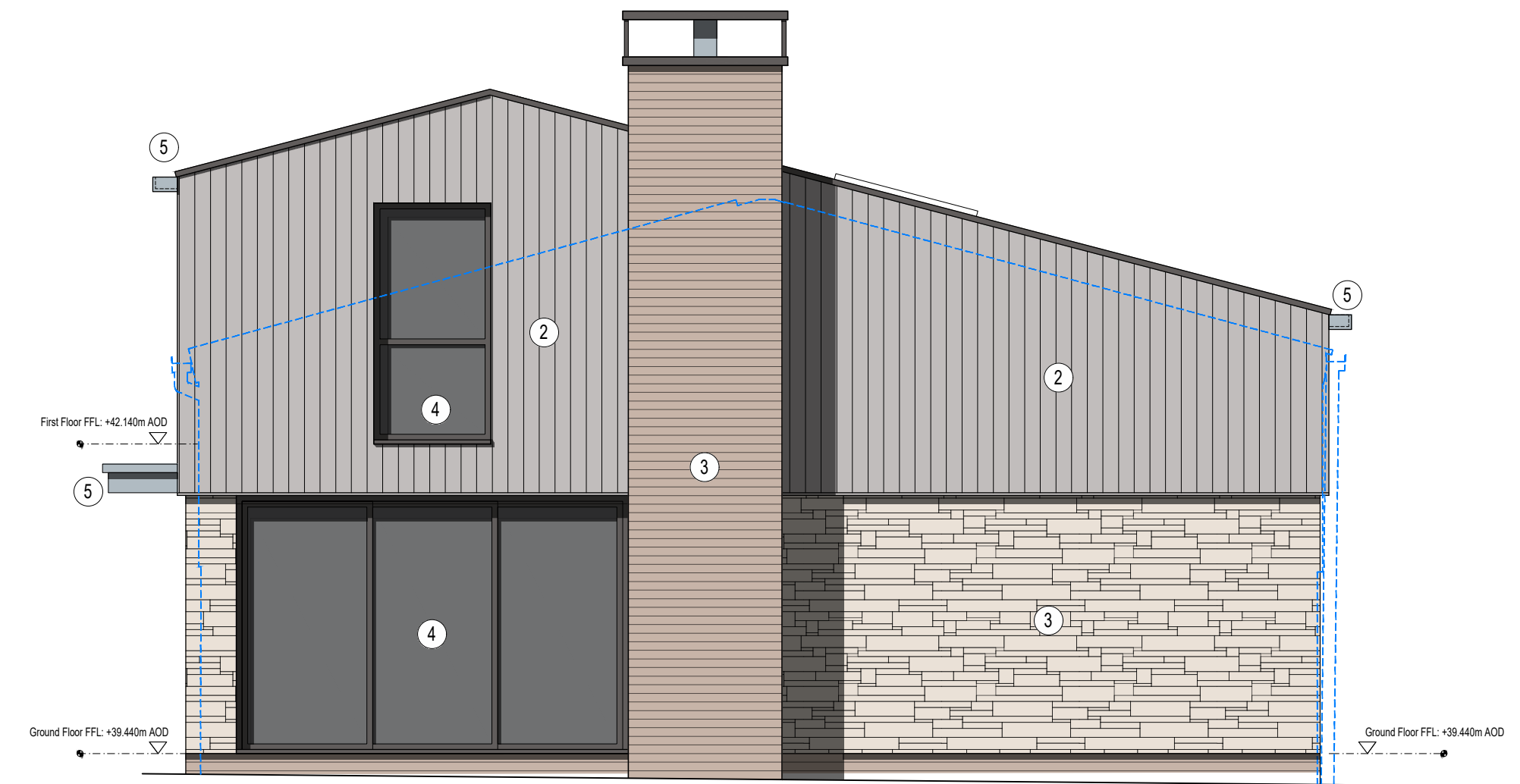
3 ELEVATION Proposed Garden Gable Elevation SCALE 1: 50