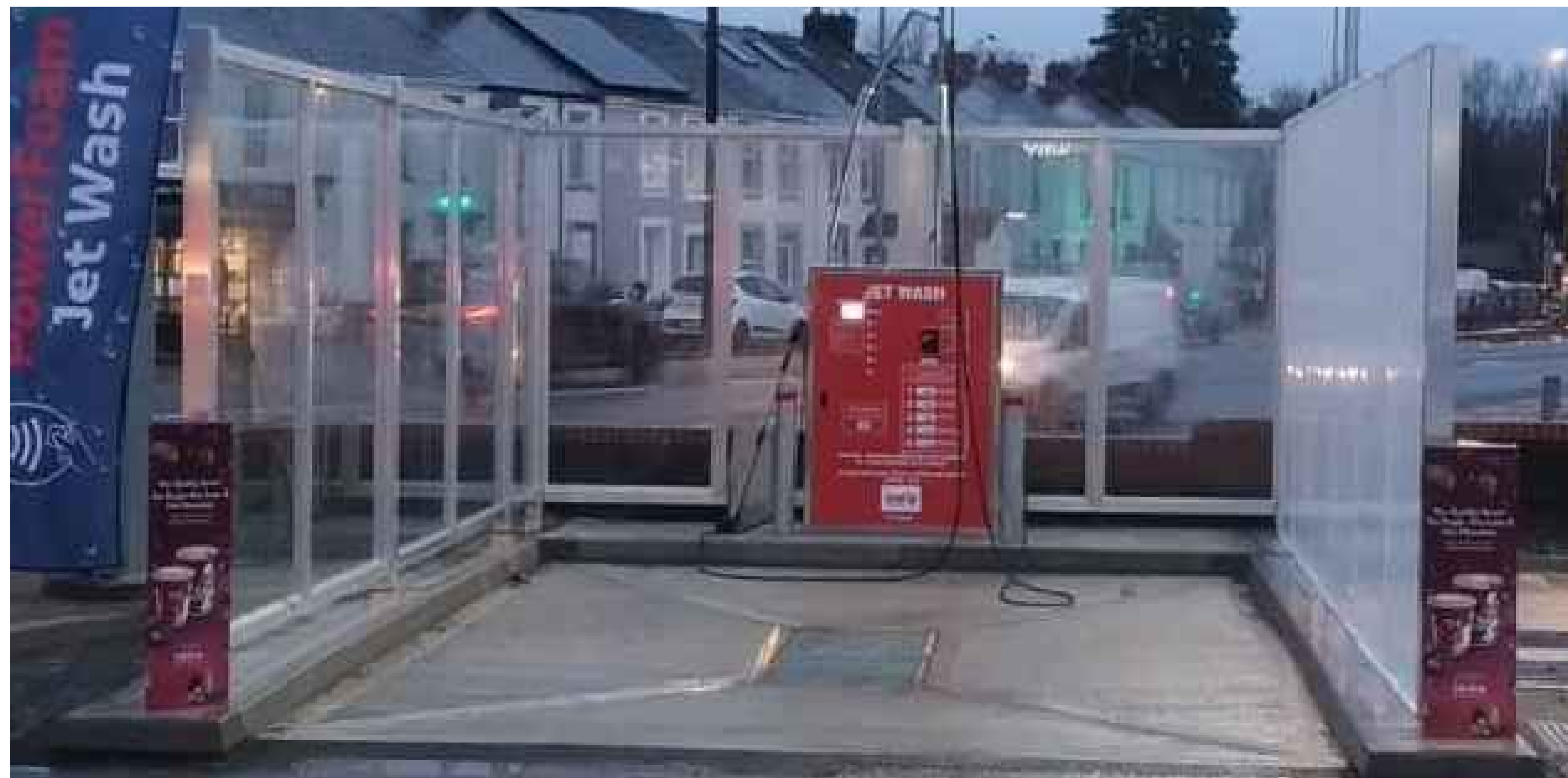
ILLUSTRATION OF COMPLETED TYPICAL WASH BAY (GLAZED SCREENS)