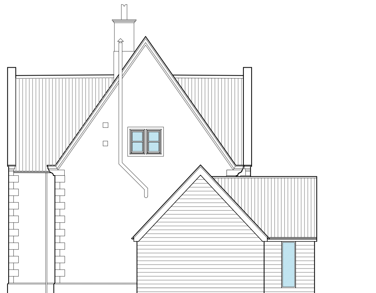
East Elevation 1:100