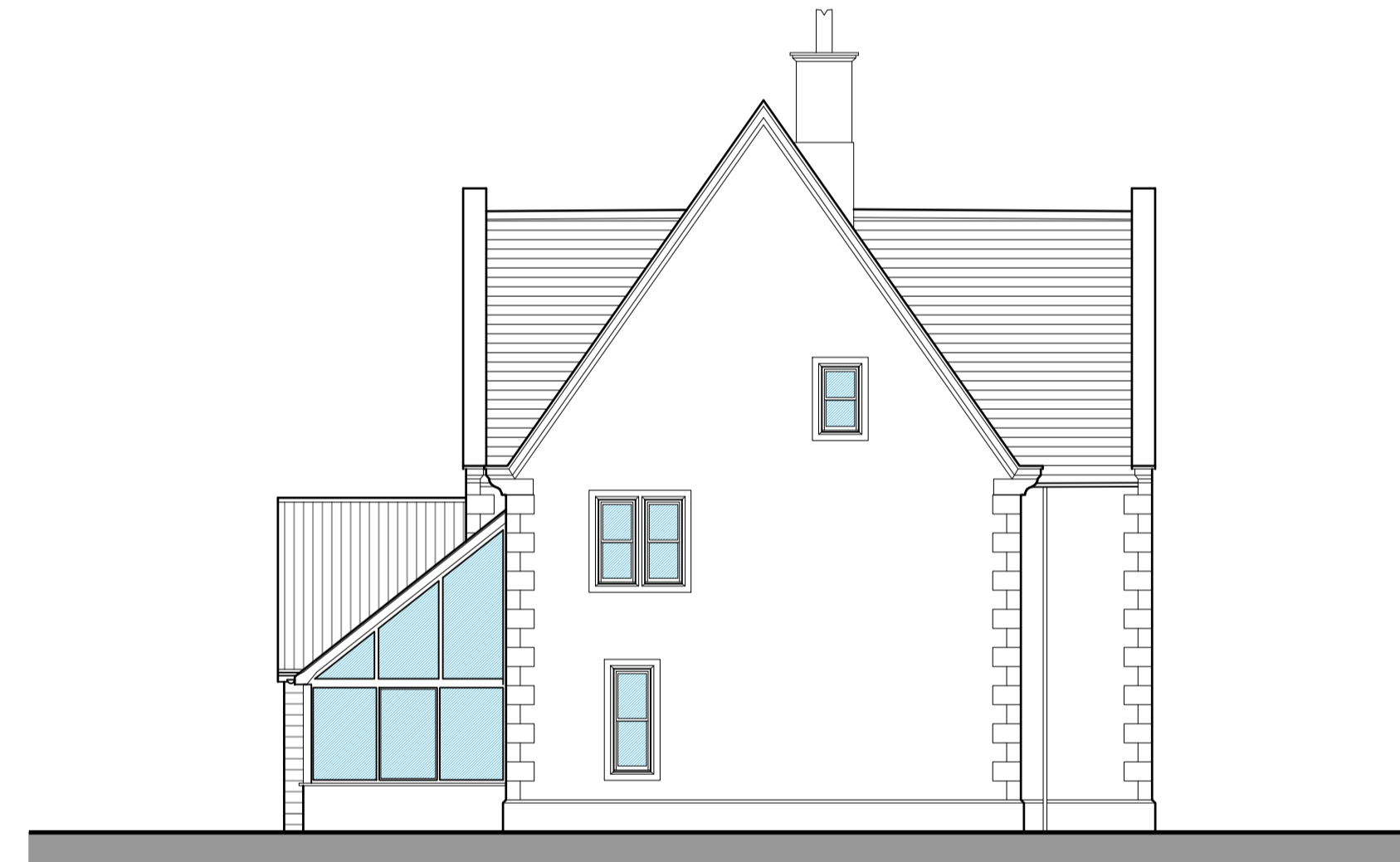
West Elevation 1:100