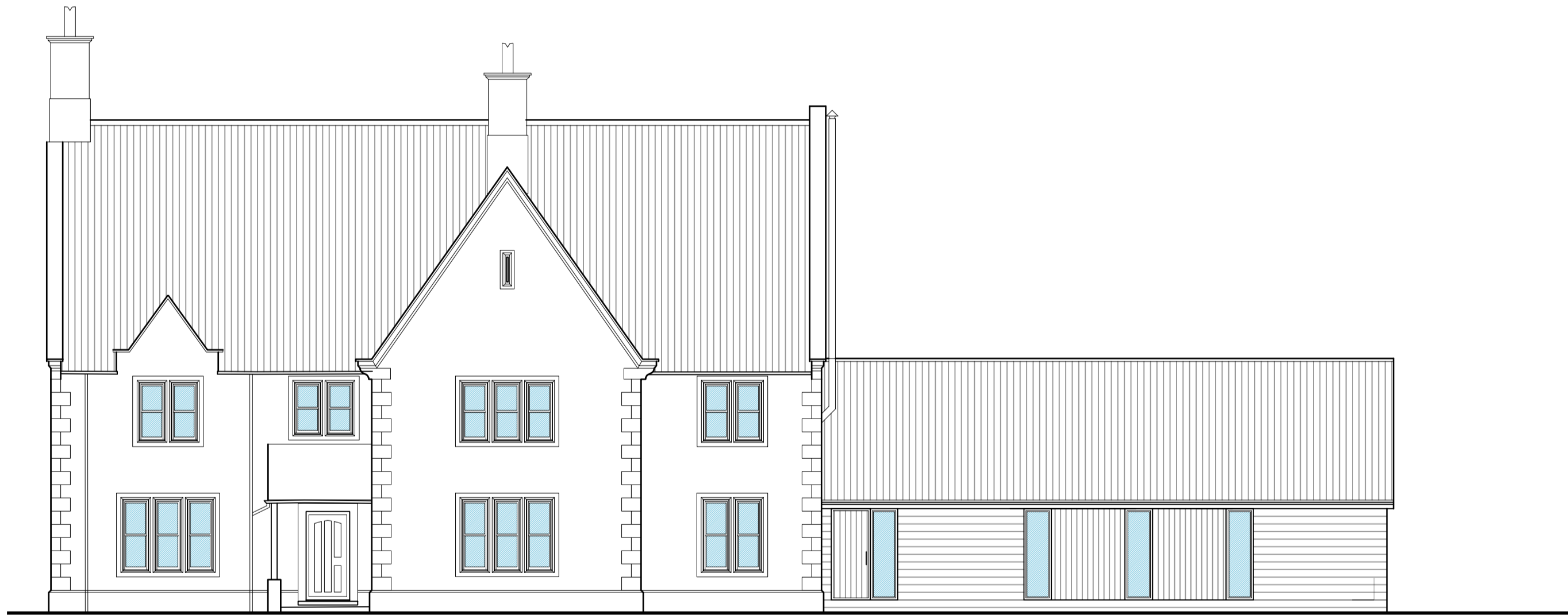
South Elevation 1:100