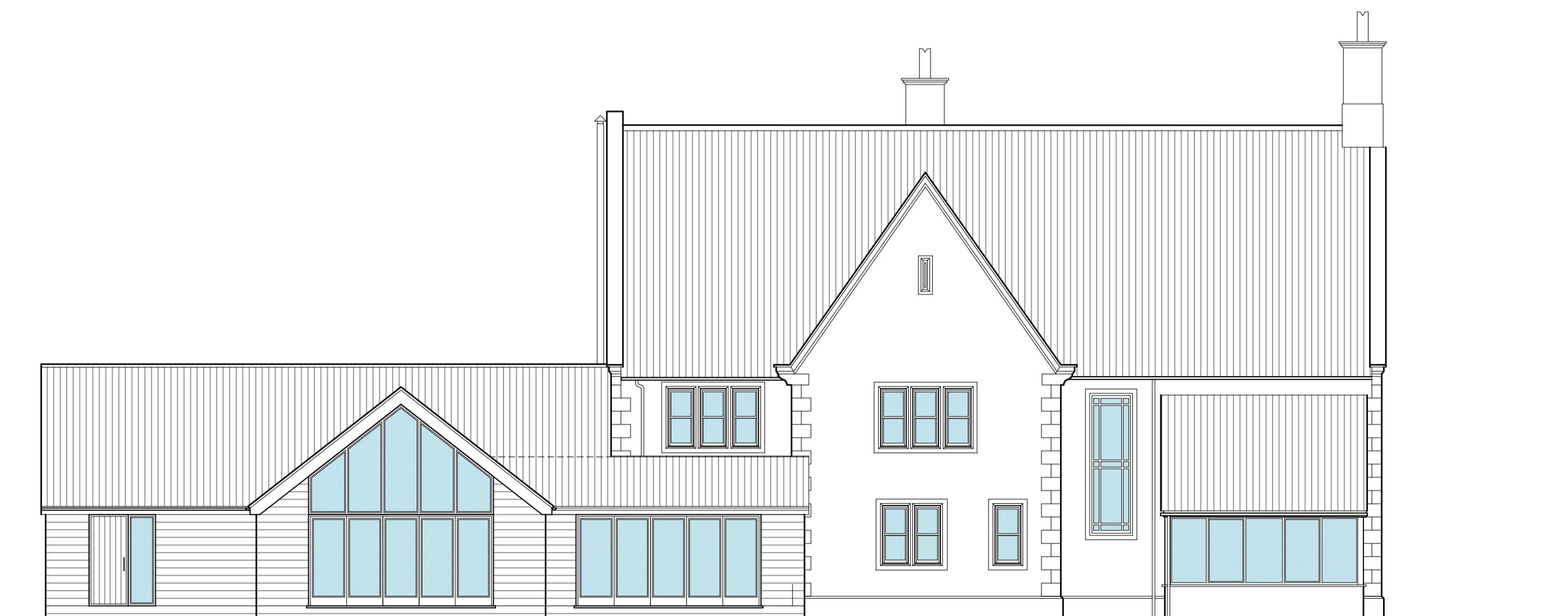
North Elevation 1:100