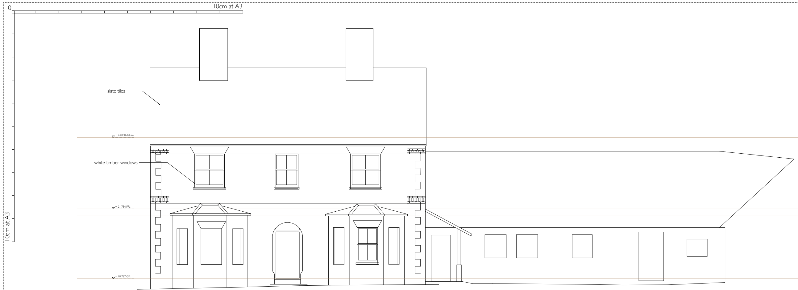
1 Existing Front (West) Elevation 1:100