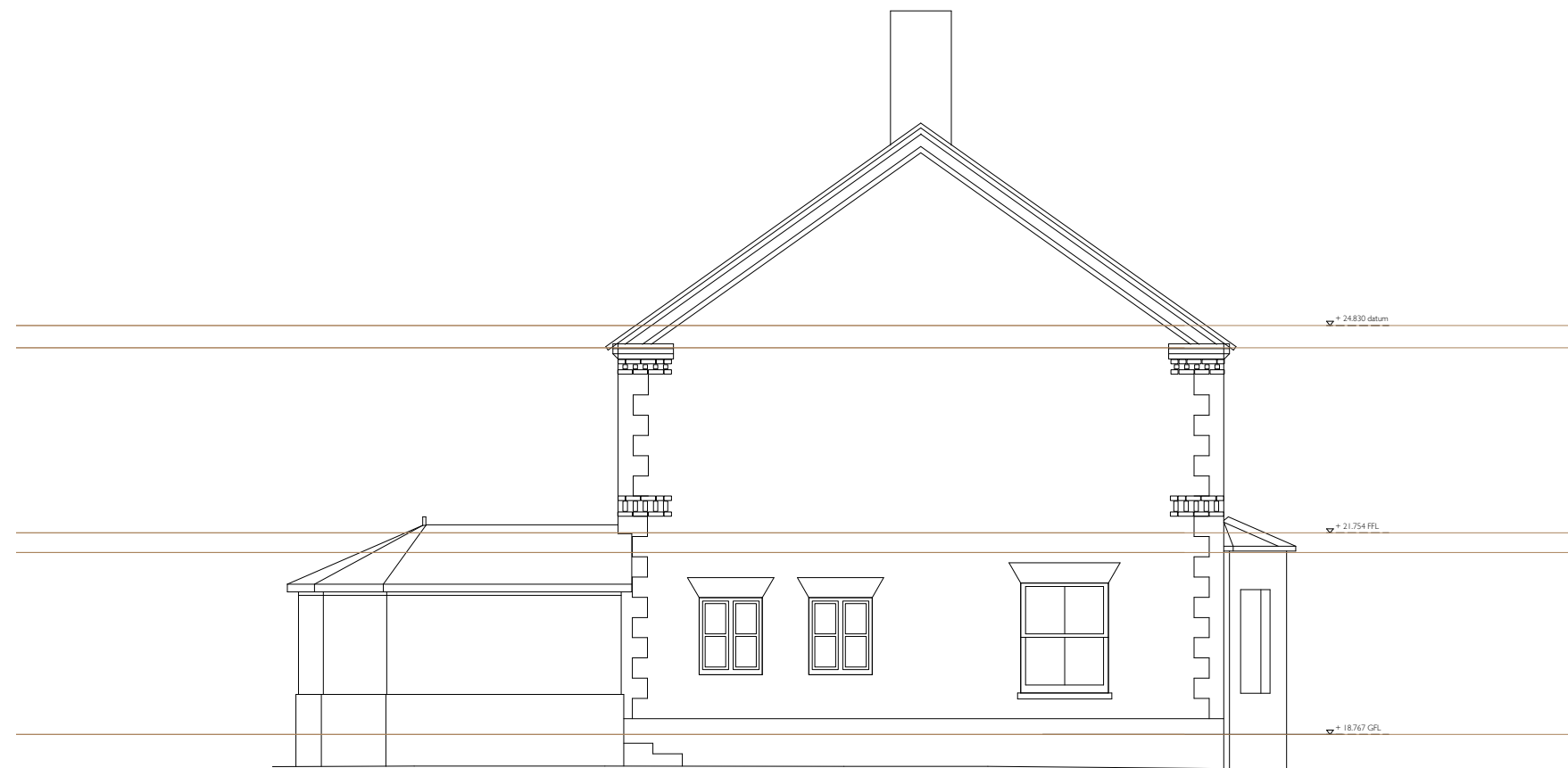
2 Existing North Elevation 1:100