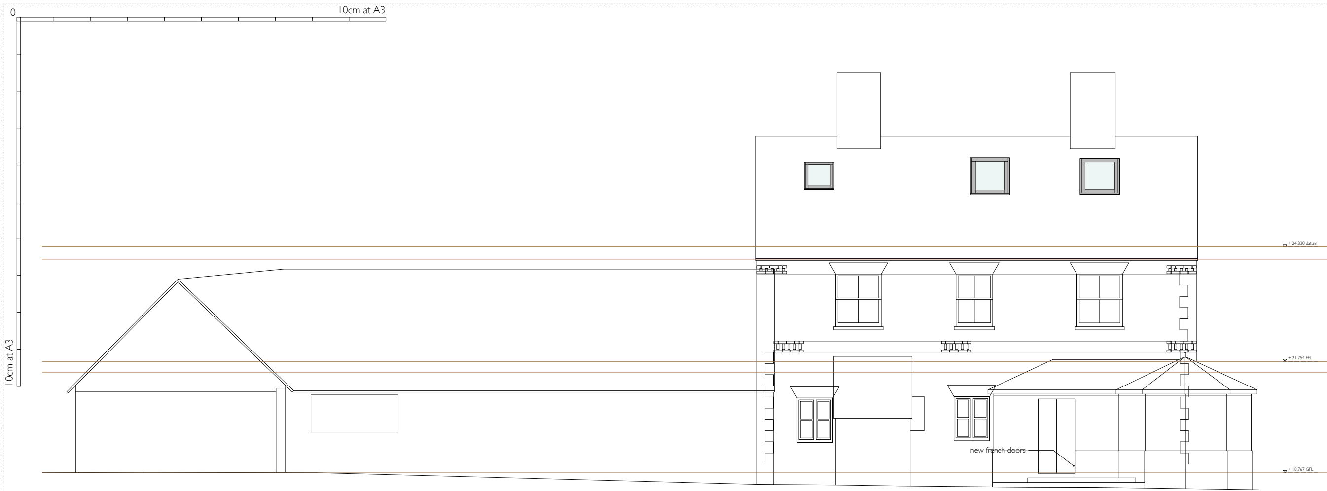
1 Existing Rear (East) Elevation 1:100