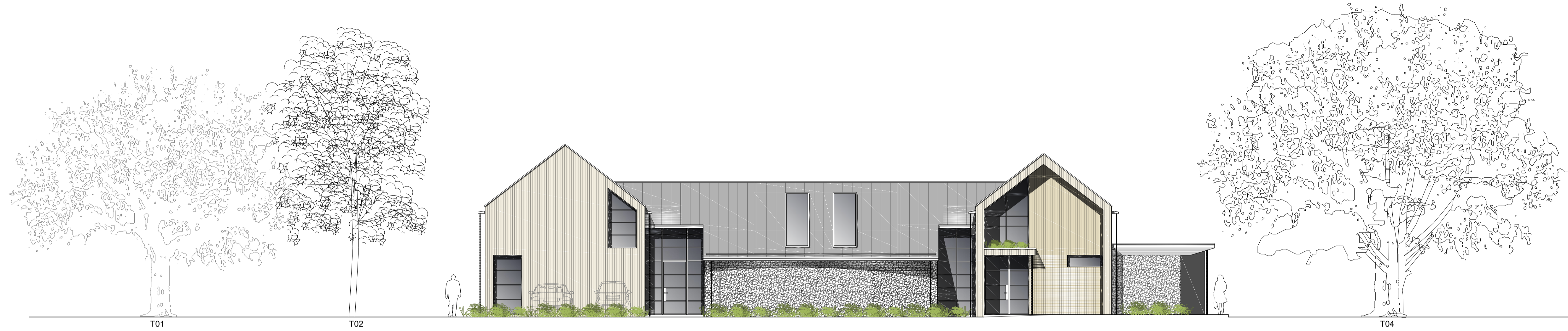
Proposed Elevation Scale 1: 100