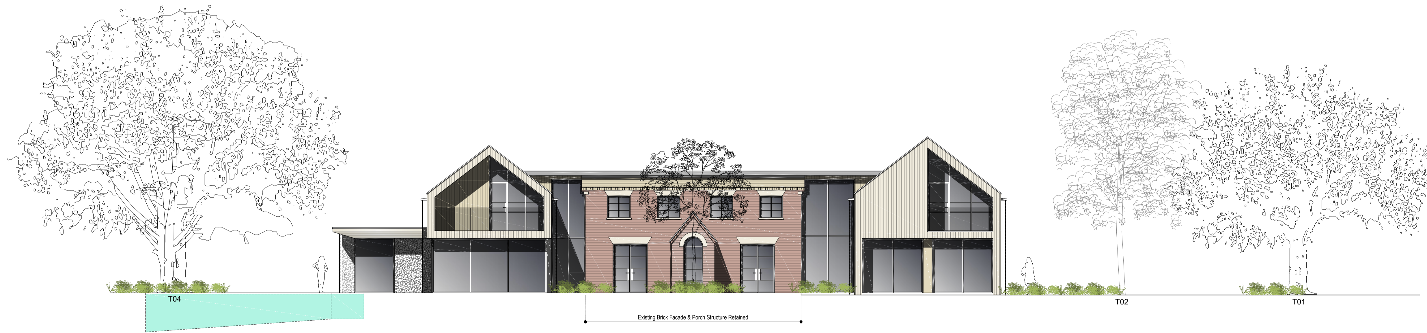
Proposed Elevation Scale 1: 100