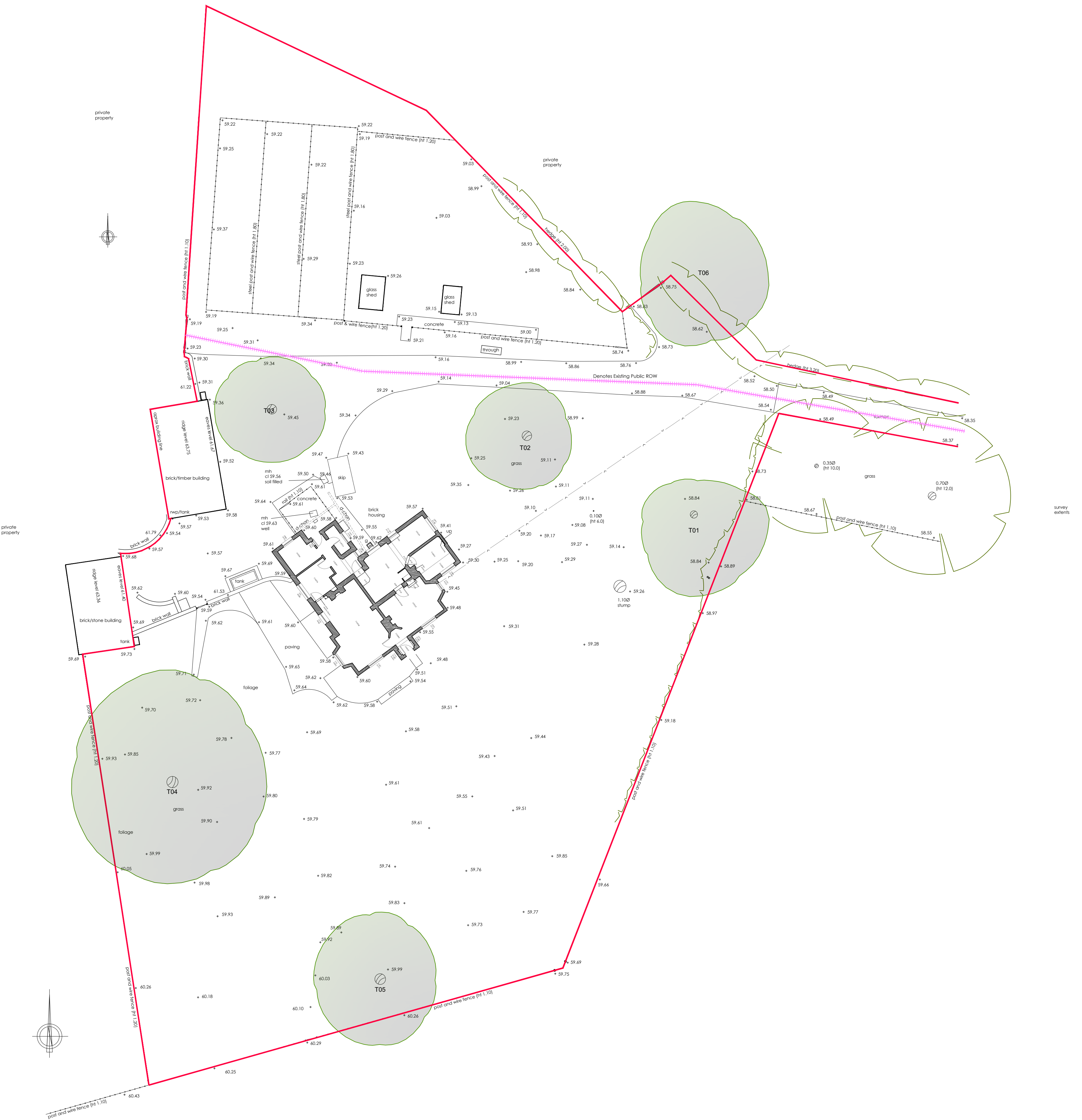
Existing Site Plan Scale 1: 200