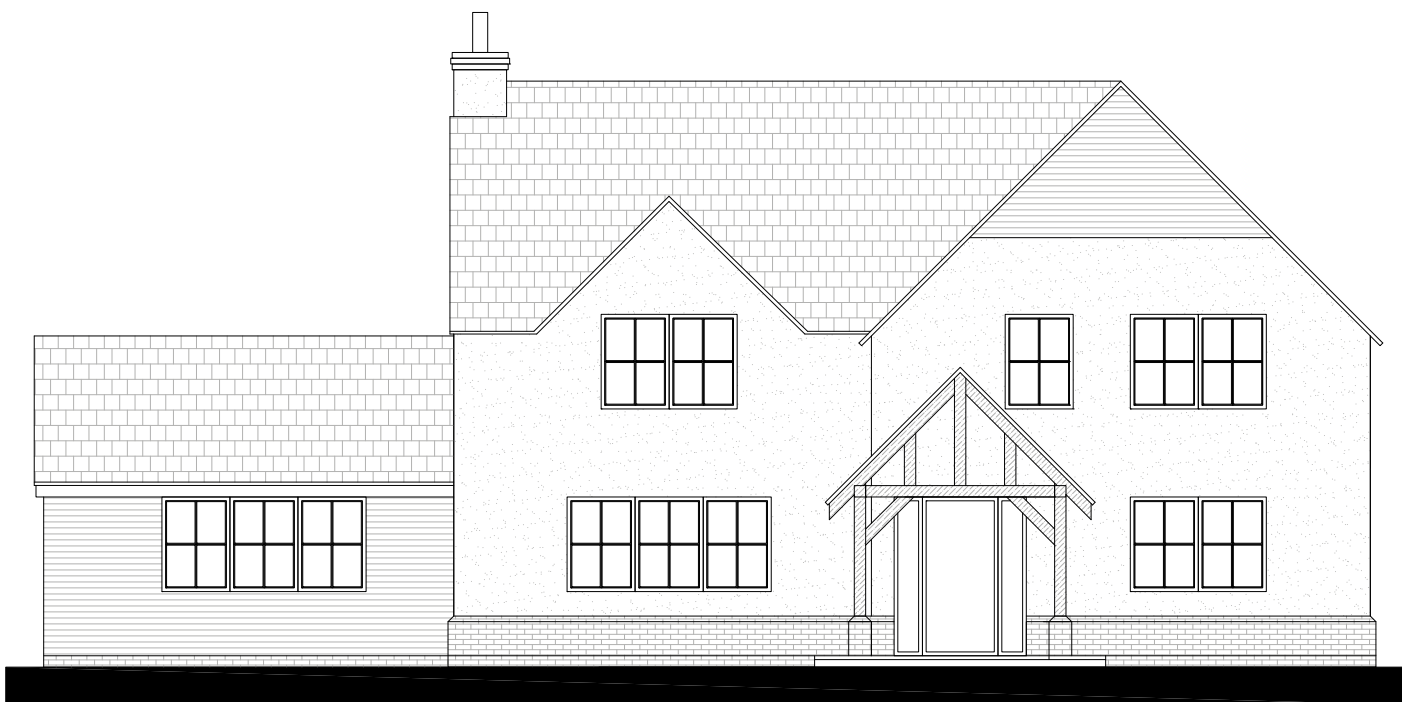
NORTH ELEVATION | PROPOSED