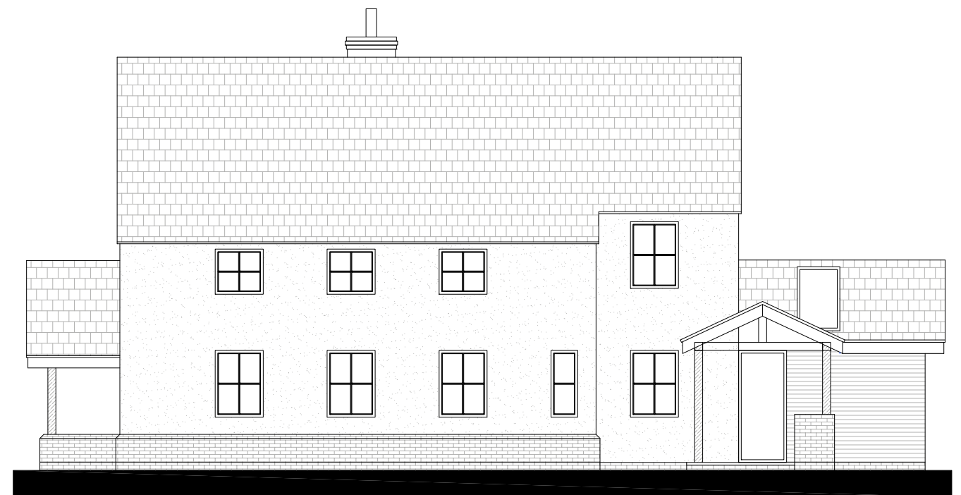
WEST ELEVATION | PROPOSED