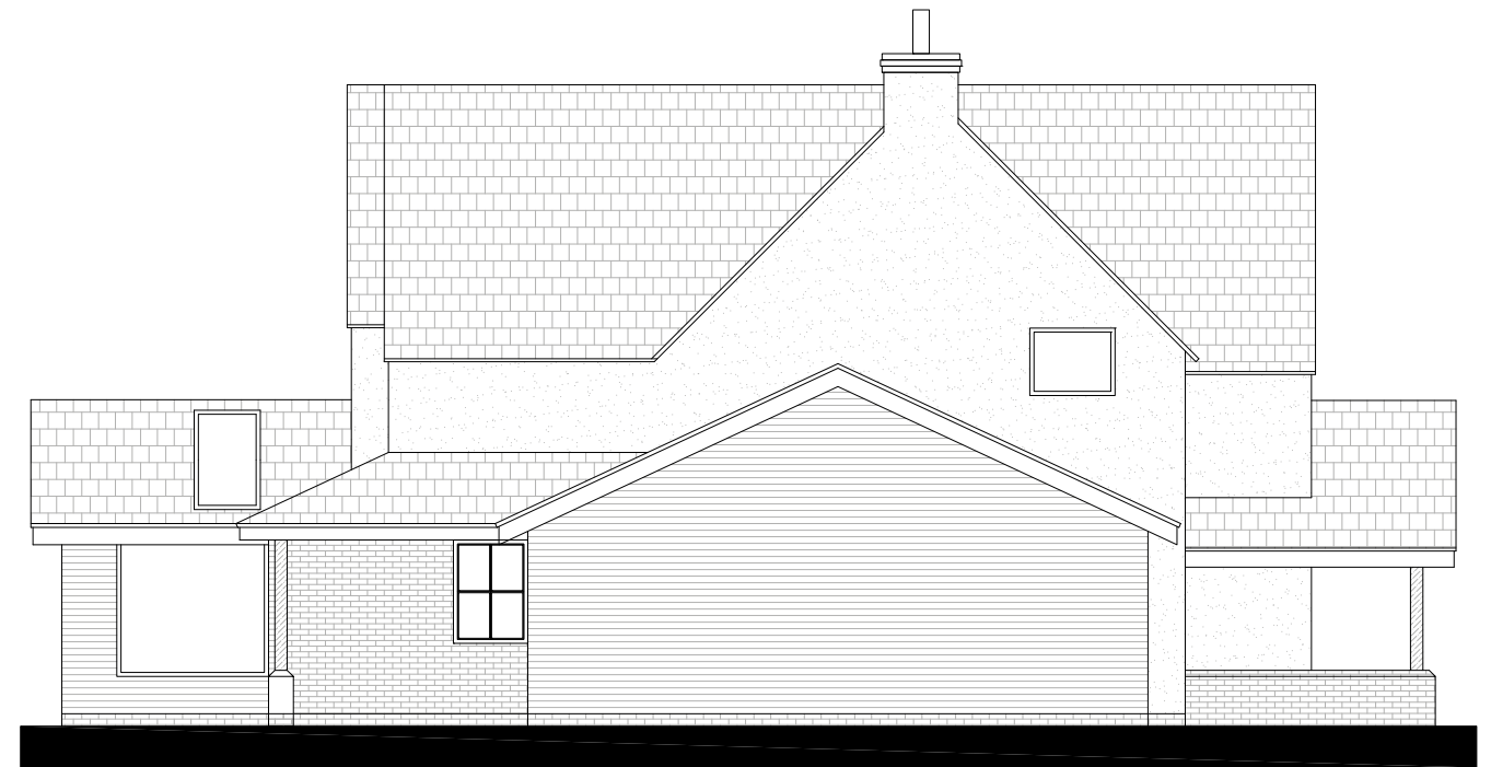
EAST ELEVATION | PROPOSED