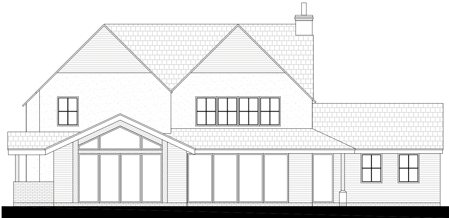
SOUTH ELEVATION | PROPOSED