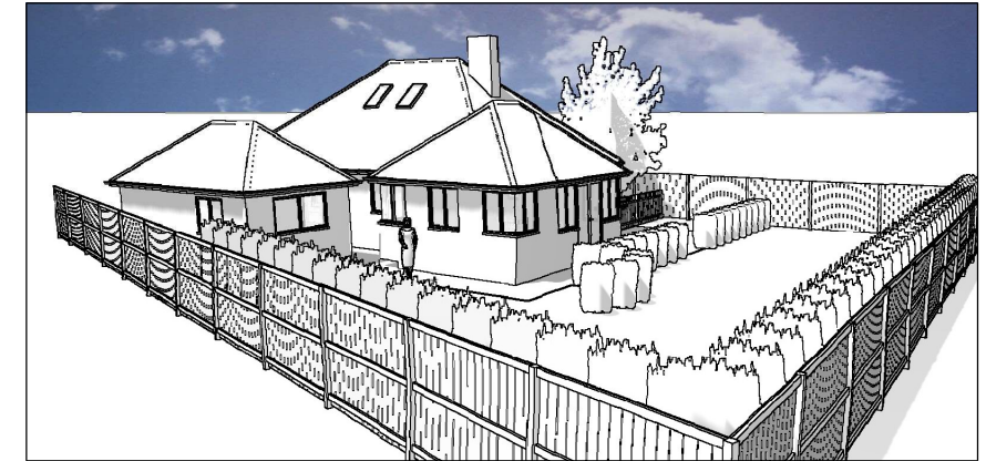
PROPOSED REAR ILLUSTRATION

GROUND FLOOR = 108.21 SQ M LOFT EXTENSION 1999 = 18.75 SQ M TOTAL 127.02 SQ M