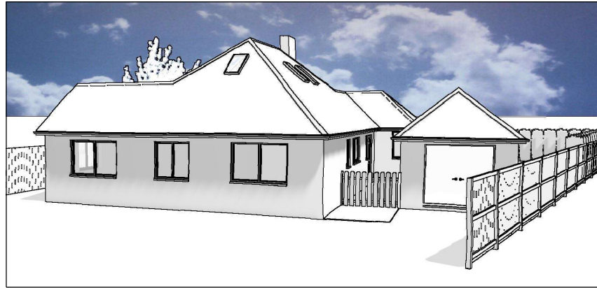
PROPOSED FRONT ILLUSTRATION