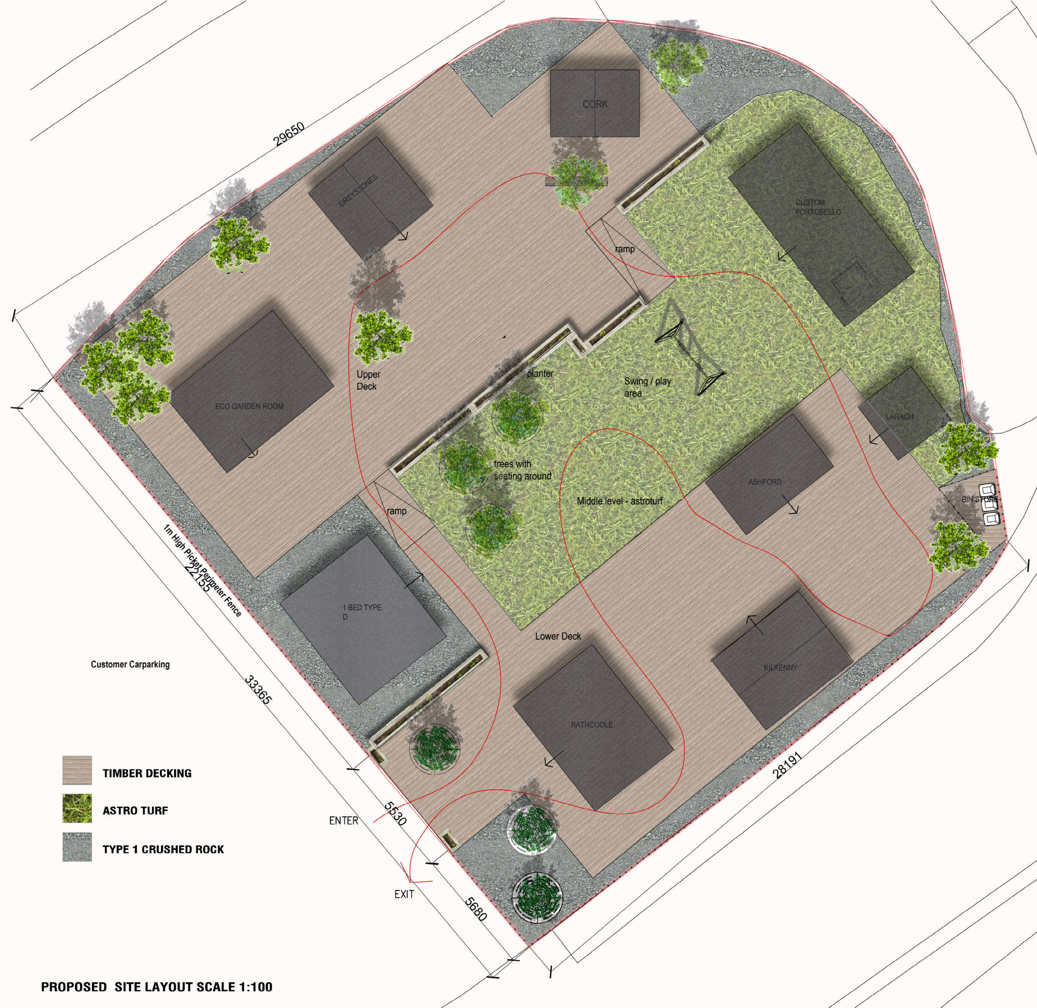
PROPOSED SITE LAYOUT SCALE 1:100