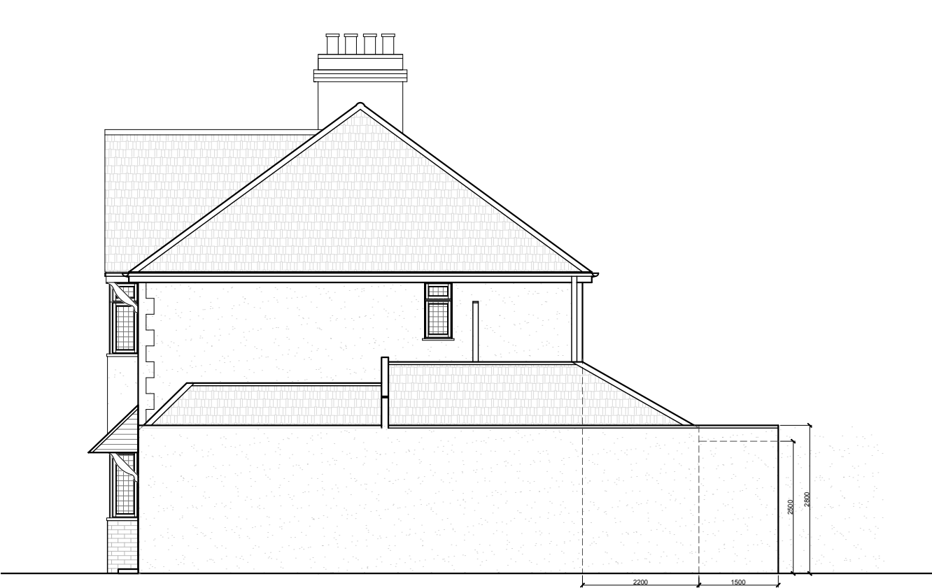
Proposed Side Elevation - Non attached (Scale 1:100)