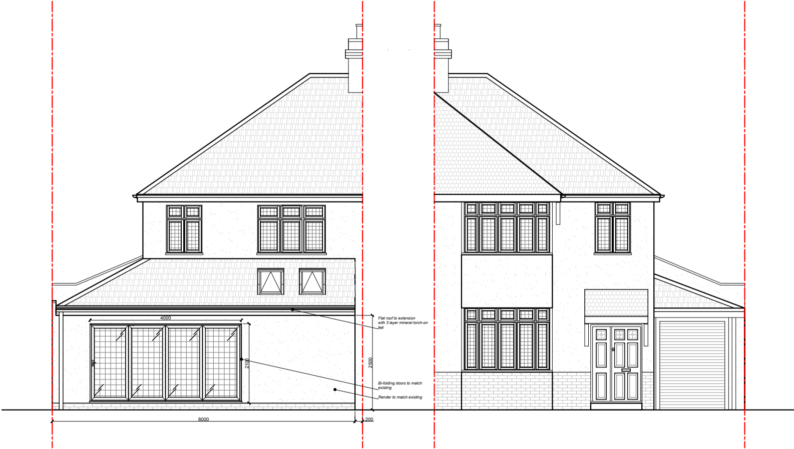
Proposed Rear Elevation (Scale 1:100)