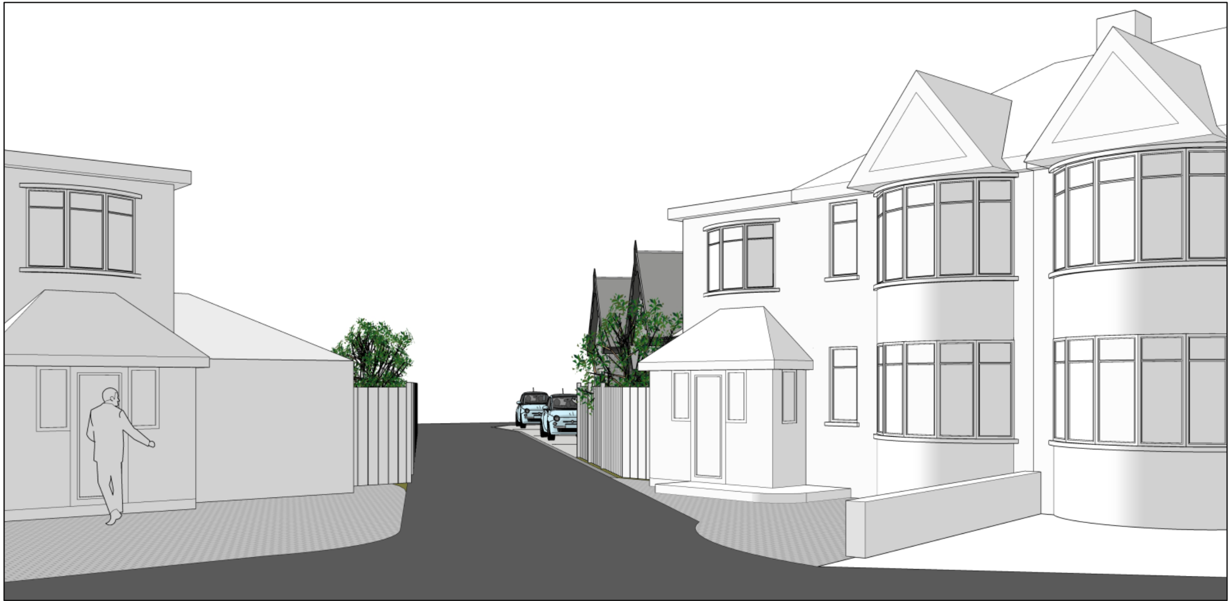
MAPLE CRESCENT BUNGALOW MASSING SCHEME - APPROACH VIEW FROM RIGHT OF WAY BY No 24 MAPLE CRESCENT