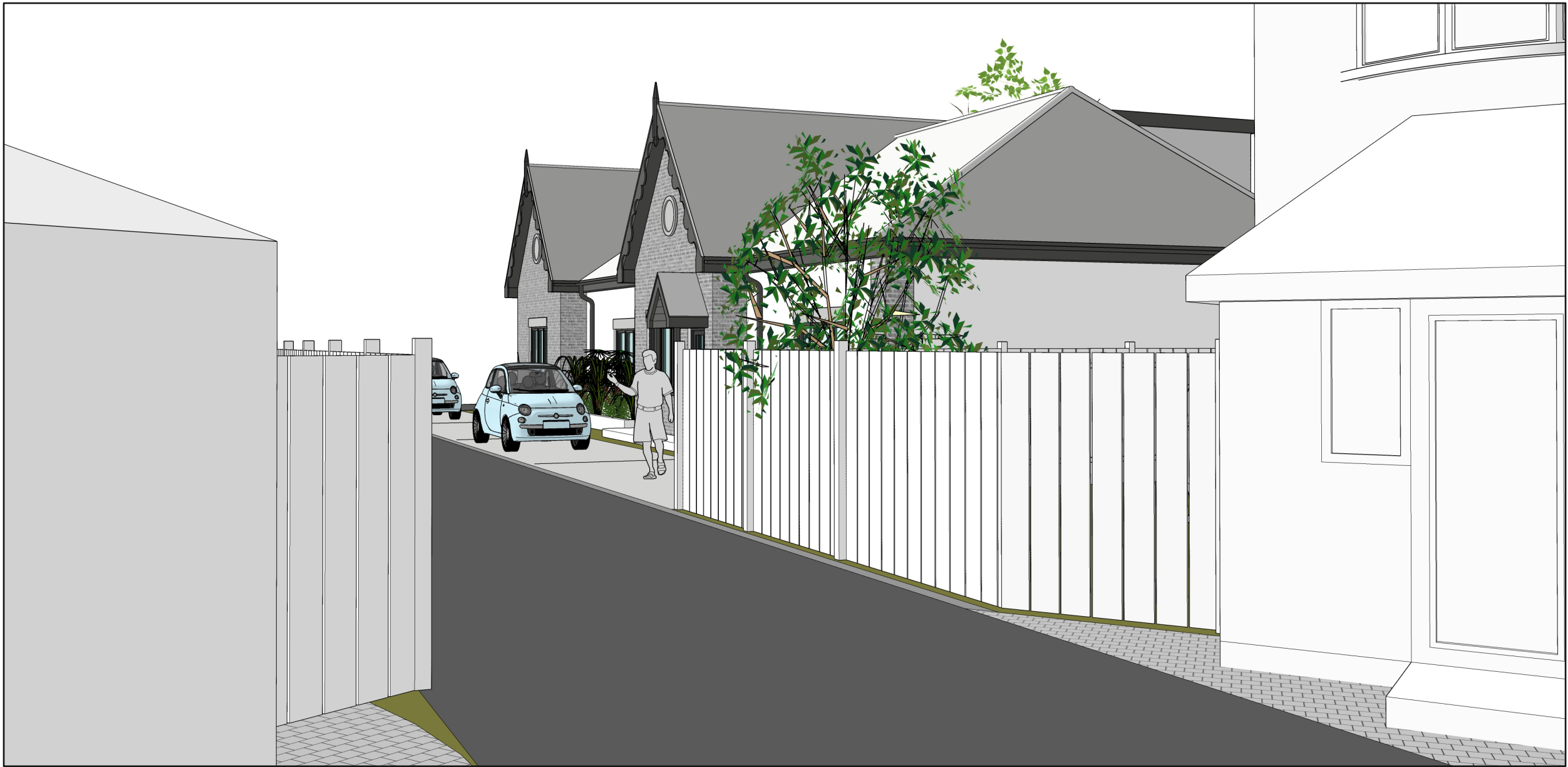
MAPLE CRESCENT BUNGALOW MASSING SCHEME - APPROACH VIEW