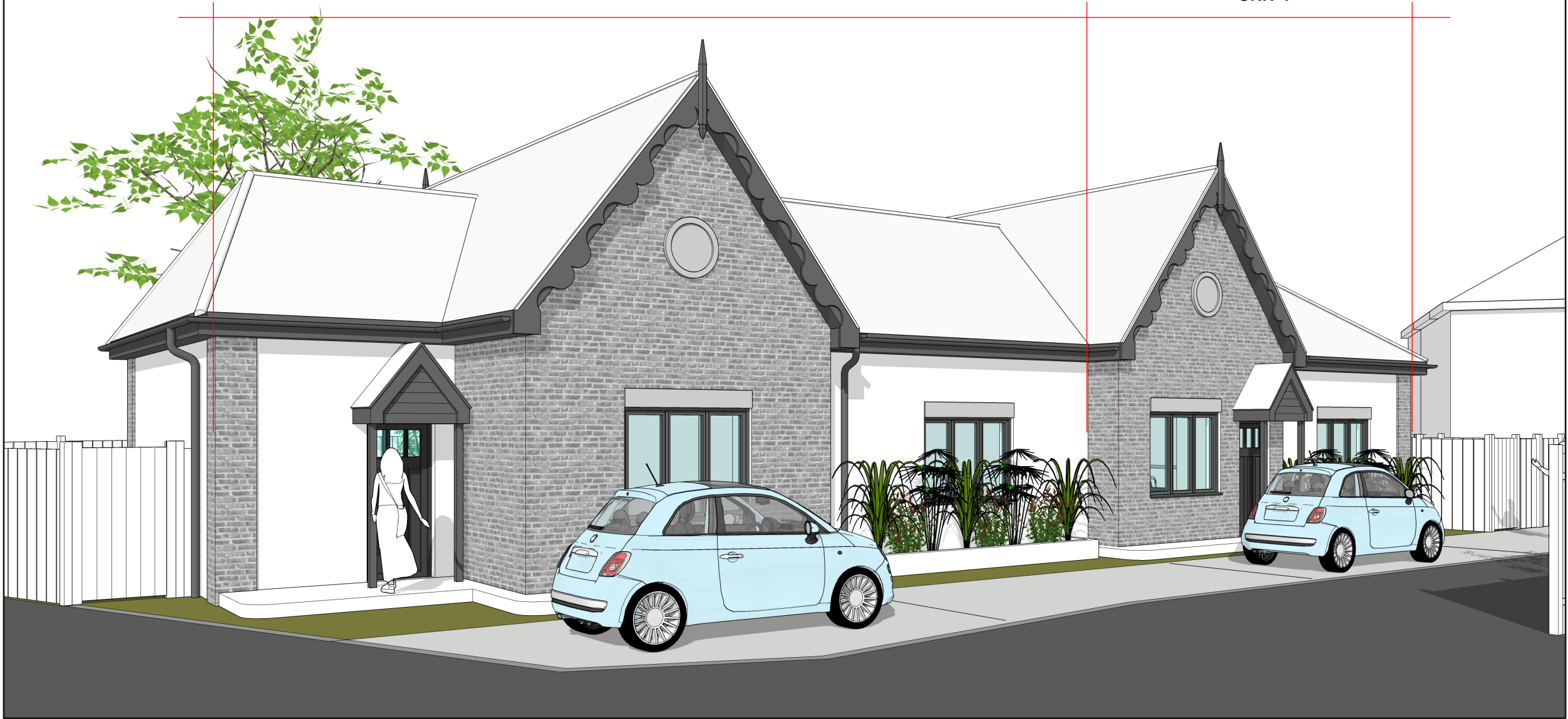
MAPLE CRESCENT BUNGALOW MASSING SCHEME - VIEW LOOKING BACK TO No24 MAPLE CRESCENT