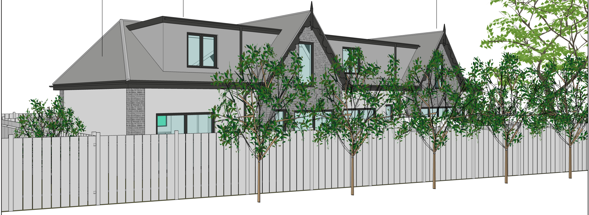
MAPLE CRESCENT BUNGALOW MASSING REAR ELEVATION FROM NEIGHBOURING GARDEN

GABLE DETAIL INTRODUCED TO BREAK UP VISUAL WEIGHT OF DORMER TO THE REAR OF UNIT 1 AND 2