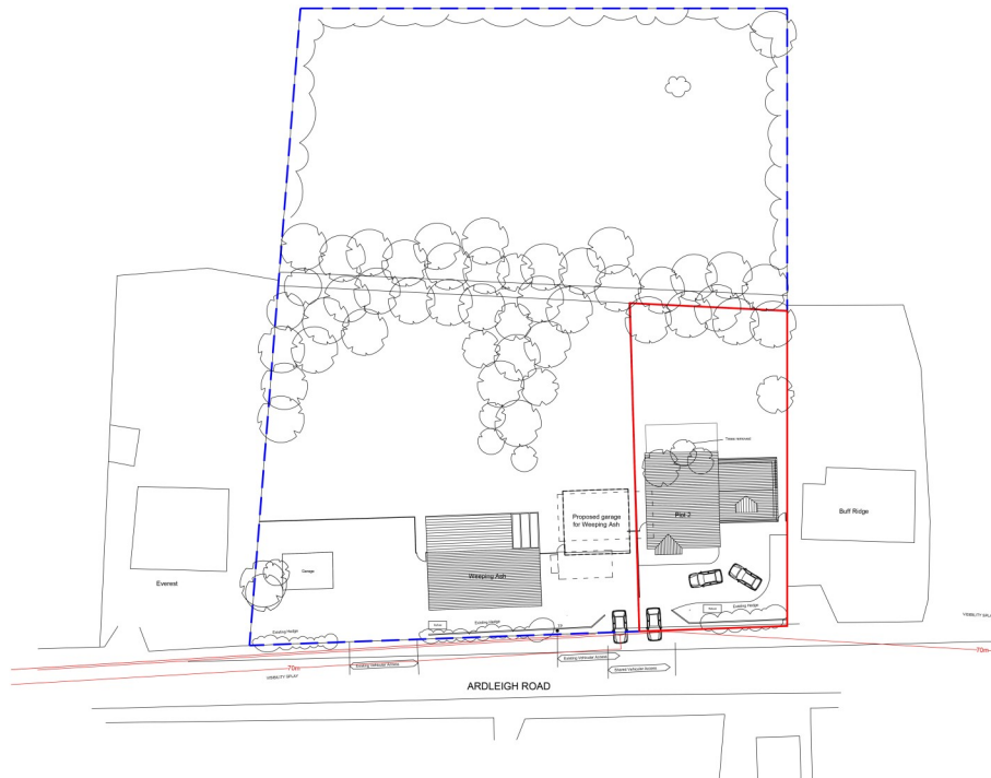
Block Plan Plot 2 Scale 1:200

DO NOT SCALE this drawing. Spaced dimensions only are to be used. © This drawing is the sole copyright of BN1 Architects. Any discrepancies between this drawing and other information should be reported to the Architect. MODIFICATIONS TO THIS DRAWING TO BE MADE SOLELY ON ORIGINAL MAGNETIC MEDIA, AND MAY ONLY BE CARRIED OUT BY BN1 ARCHITECTS. THE BOUNDARY SHOWN IS BASED ON INFORMATION SUPPLIED BY OTHERS, NOT BN1 ARCHITECTS. ALL BOUNDARIES TO BE VERIFIED ON SITE. Rev: Date: Description: By: Rev: