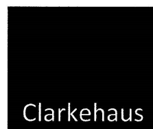
Visibility Weeping Ash, Ardleigh Road, Great Bramley