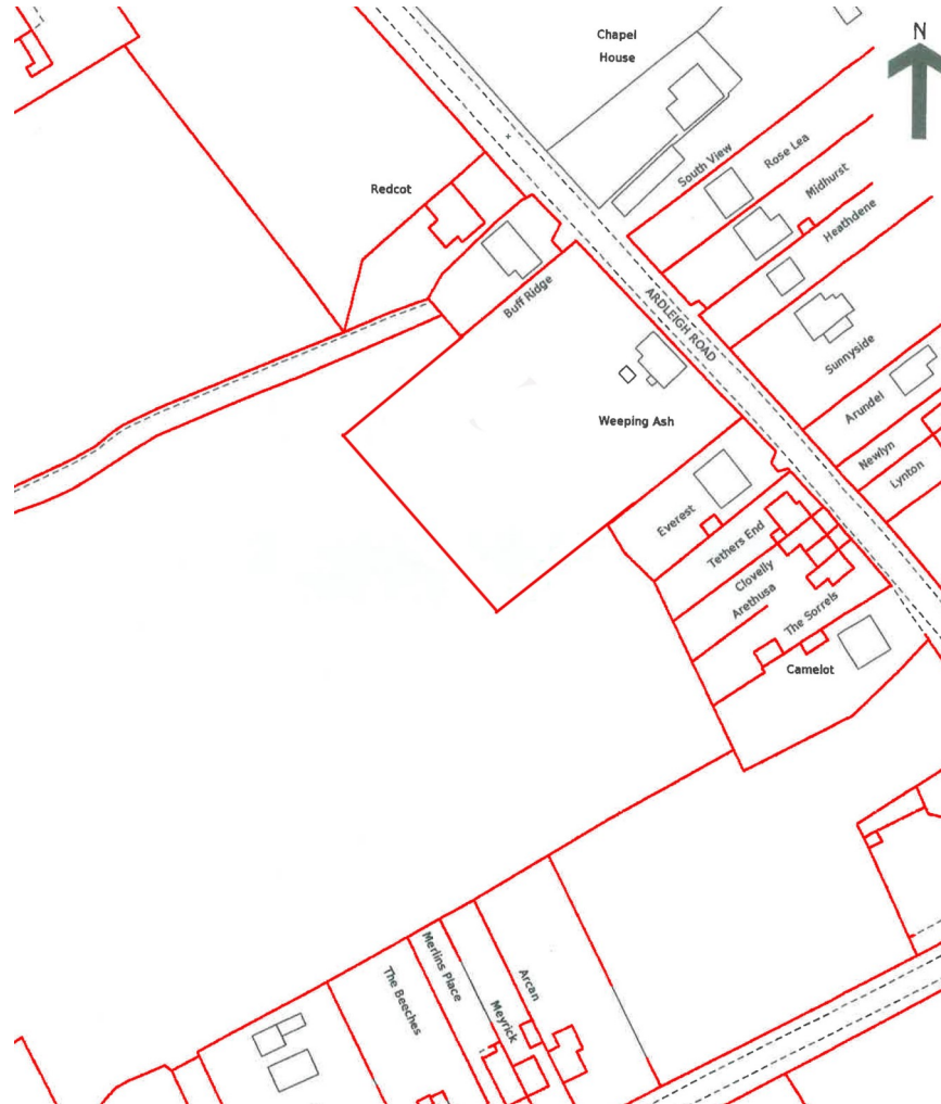
1.0 Location Plan