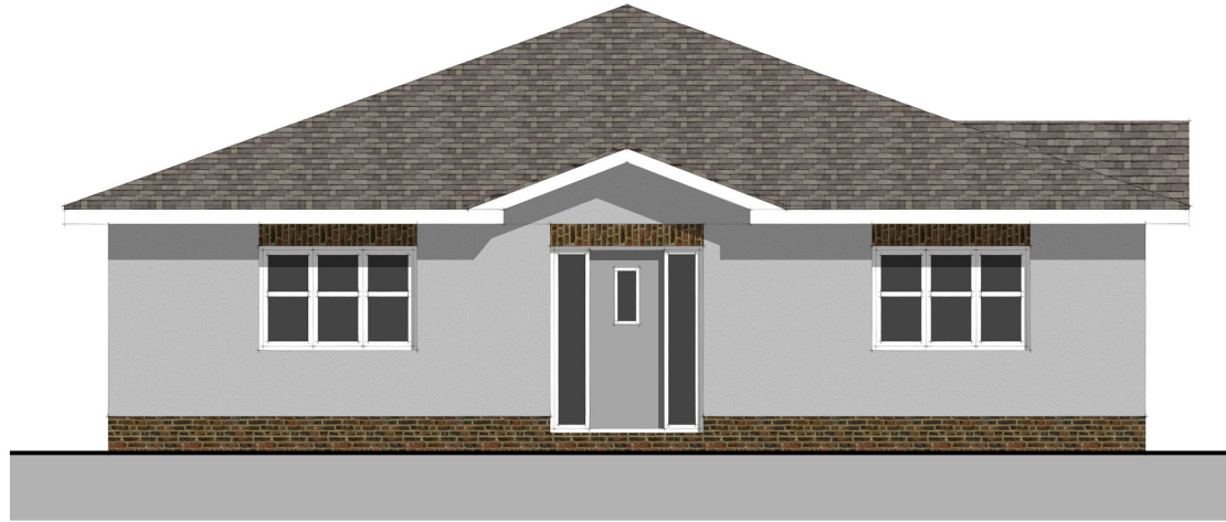
proposed front elevation