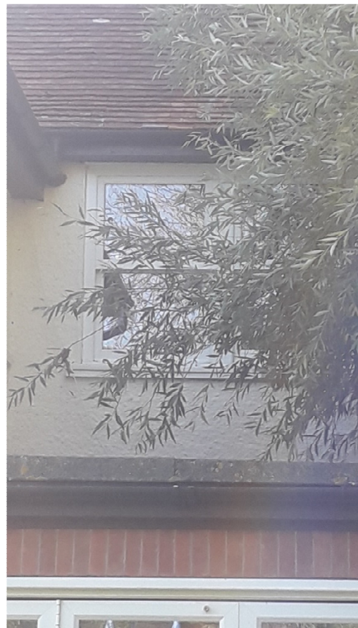
Figure 2. The canopy blocking the bedroom window.