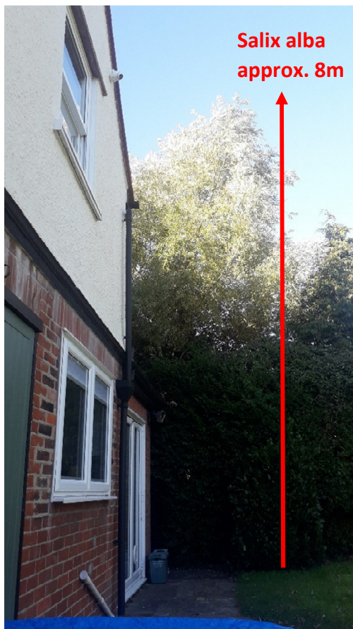
Figure 1. Showing the height and position of the tree in relation to the house.