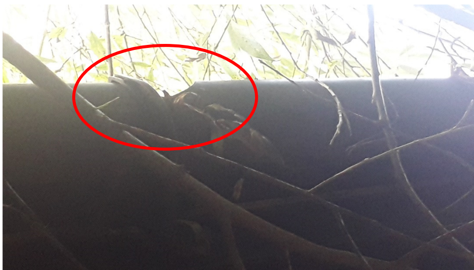
Figure 3. Branches growing against guttering. Red circle highlights damage to gutter.