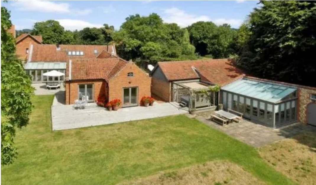
Existing view showing conservatory to right replaced similar design with conservatory at back subject of change to orangery style to reduce solar gain and improve thermal efficiency.

(1782-1845) was founder and first president of the Royal Agricultural Society, and a fellow agriculturalist and friend of Thomas Coke, Earl of Leicester of Holkham nearby.