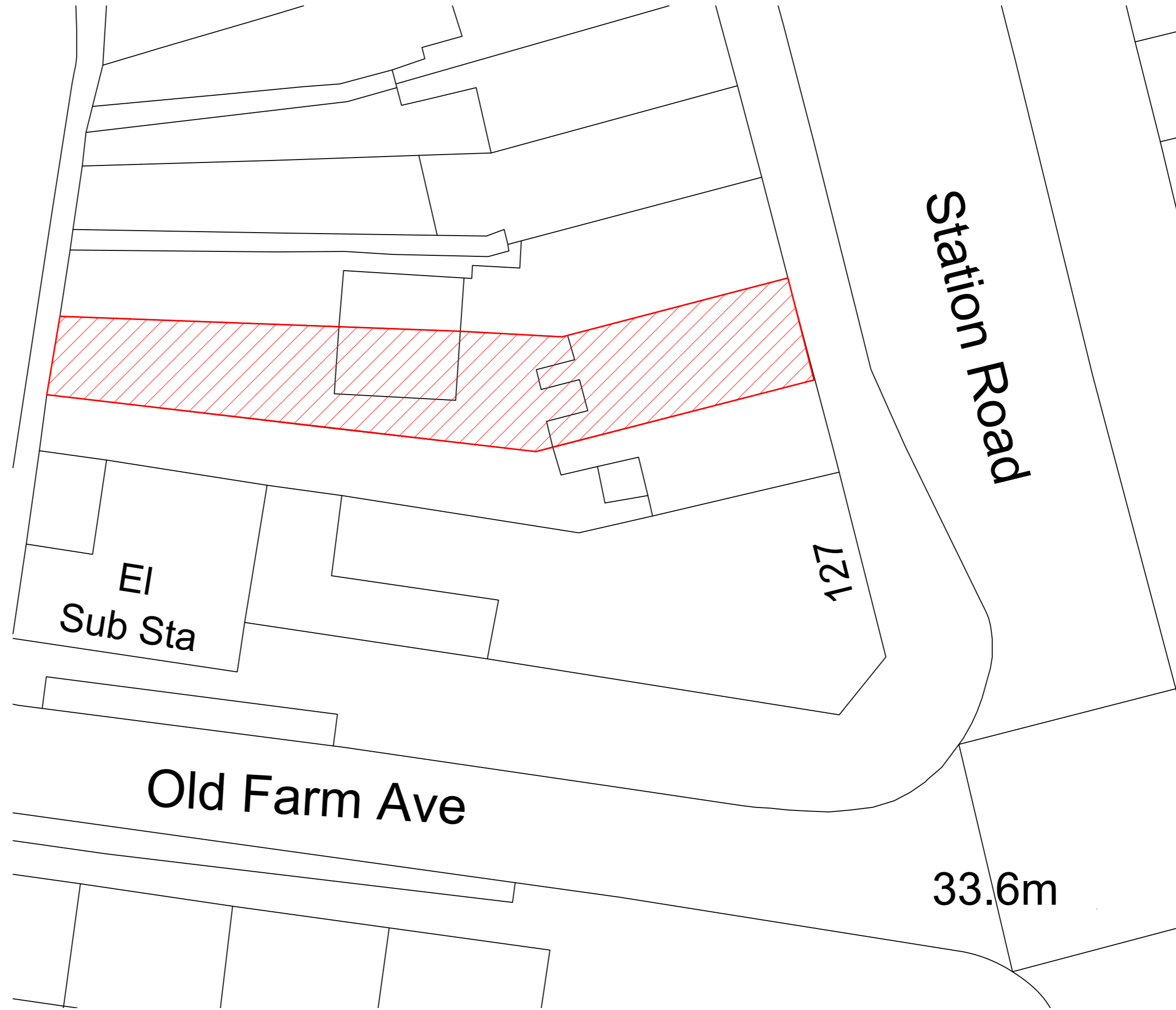
Block Plan Scale 1:200 @ A2