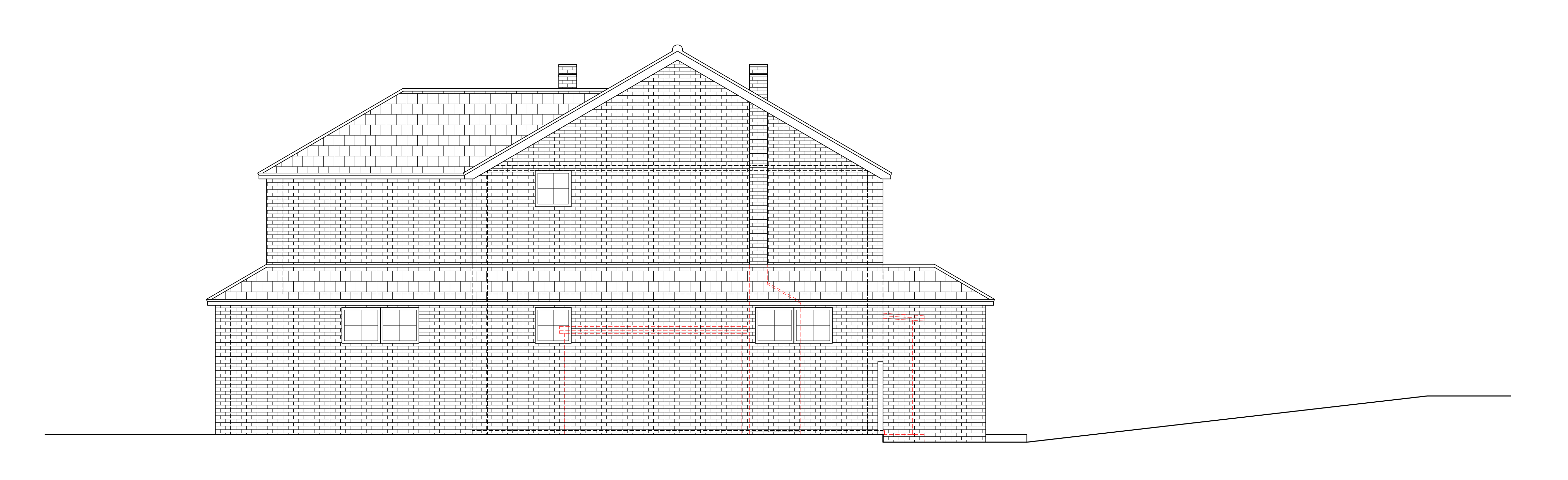
SIDE ELEVATION (NORTHEAST) Scale 1:50