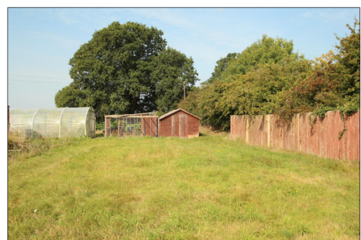
View from C