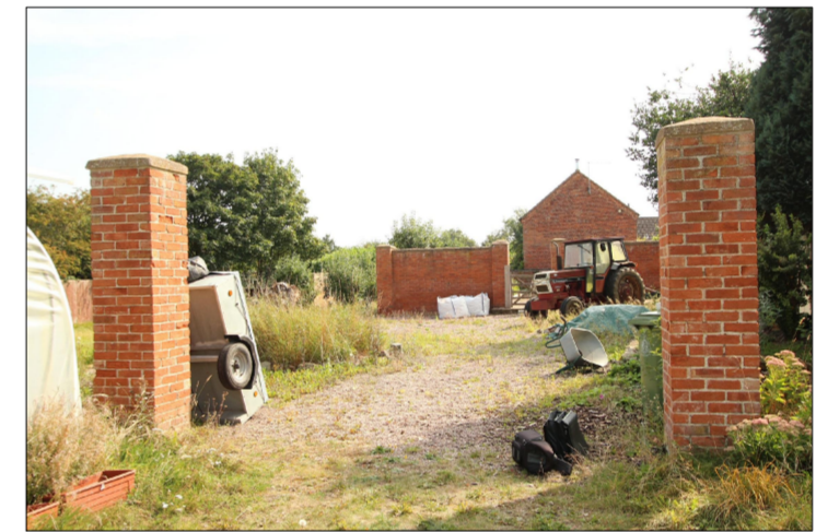
View from D