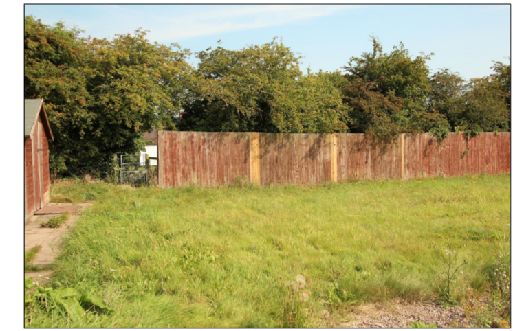
View from B