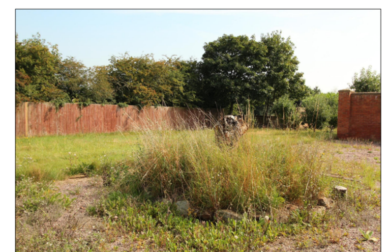
View from E