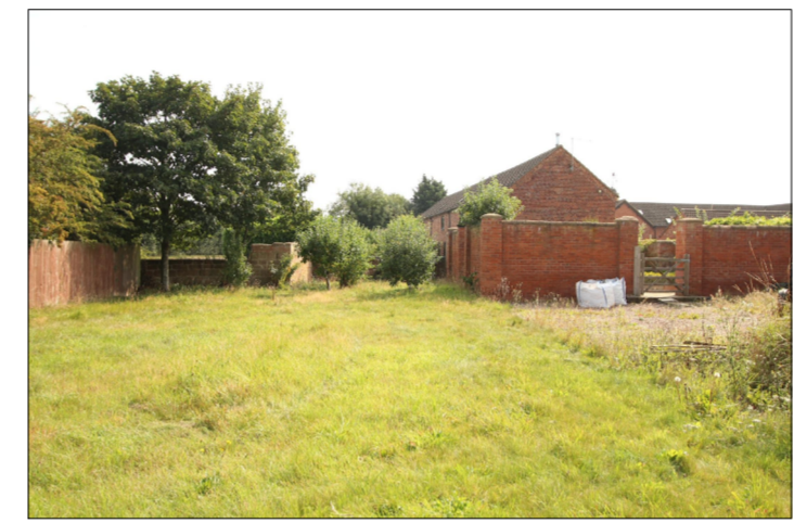
View from A