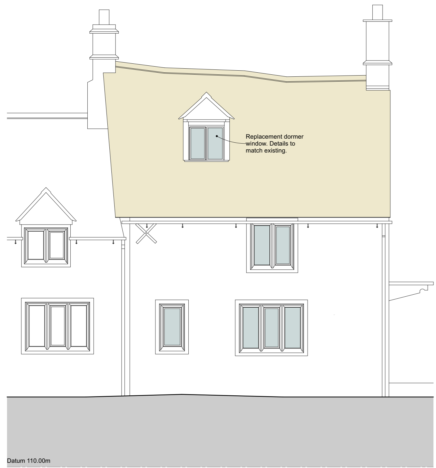
WEST ELEVATION AS PROPOSED

General Notes: 1. This drawing is to be read in conjunction with other consultants drawings. 2. Check site conditions prior to commencement of work. 3. Discrepancies must be reported directly to the Architect. 4. Do not scale off drawing, use figured dimensions only, unless for planning purposes. 5. This drawing may be issued in colour, and may be a non-standard paper size.