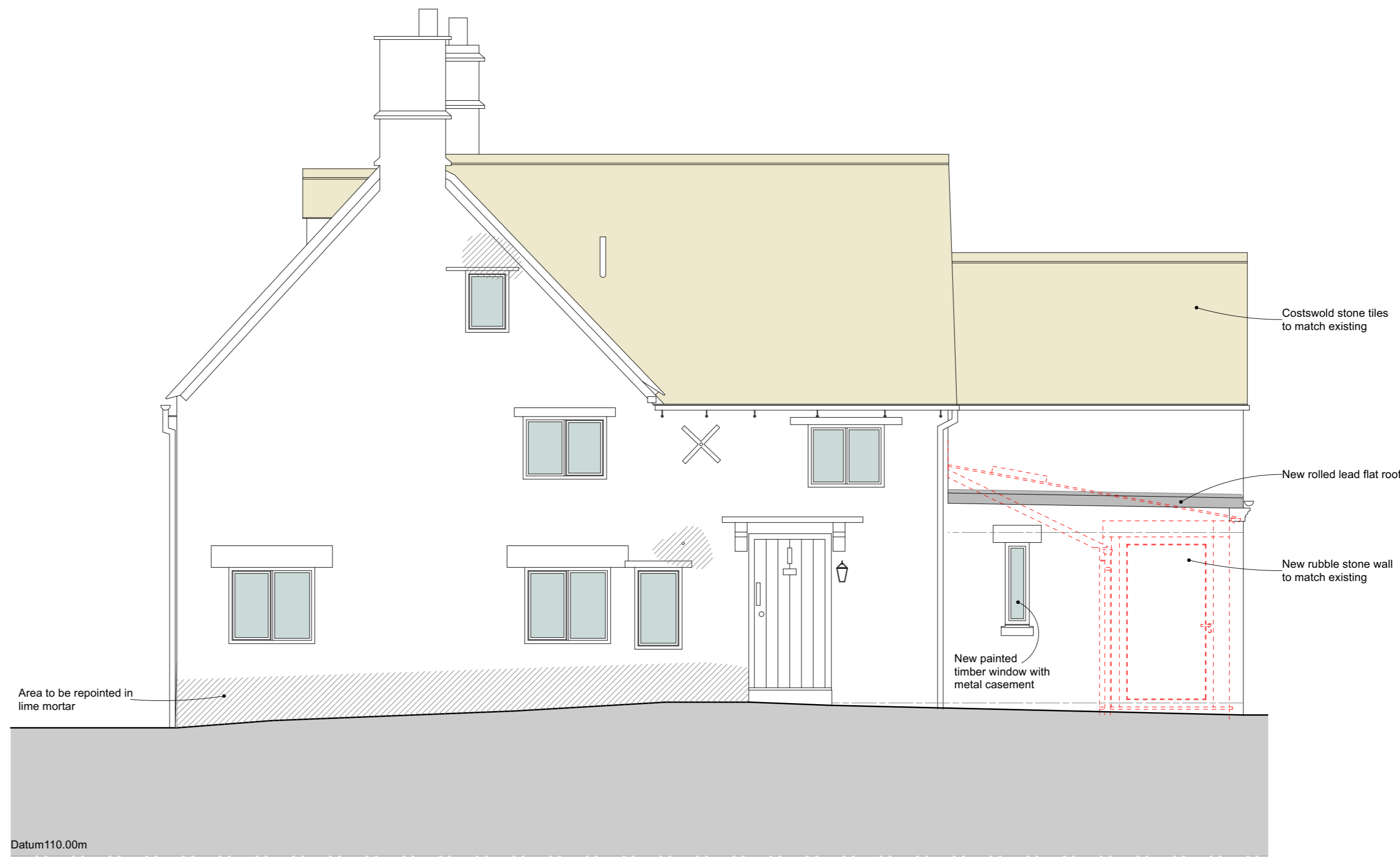
SOUTH ELEVATION AS PROPOSED