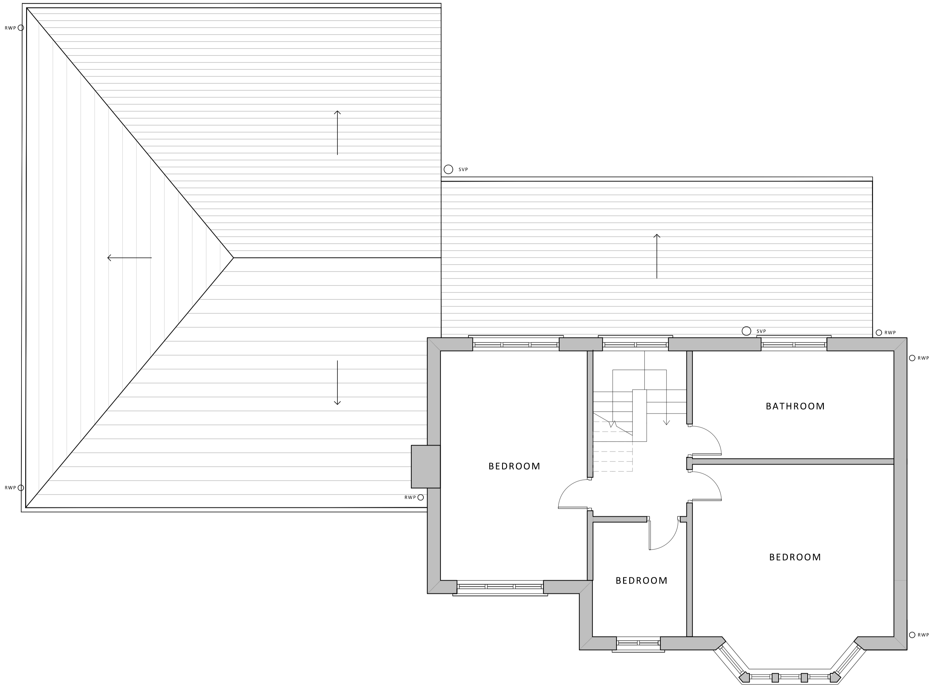
EXISTING FIRST FLOOR PLAN SCALE 1:50