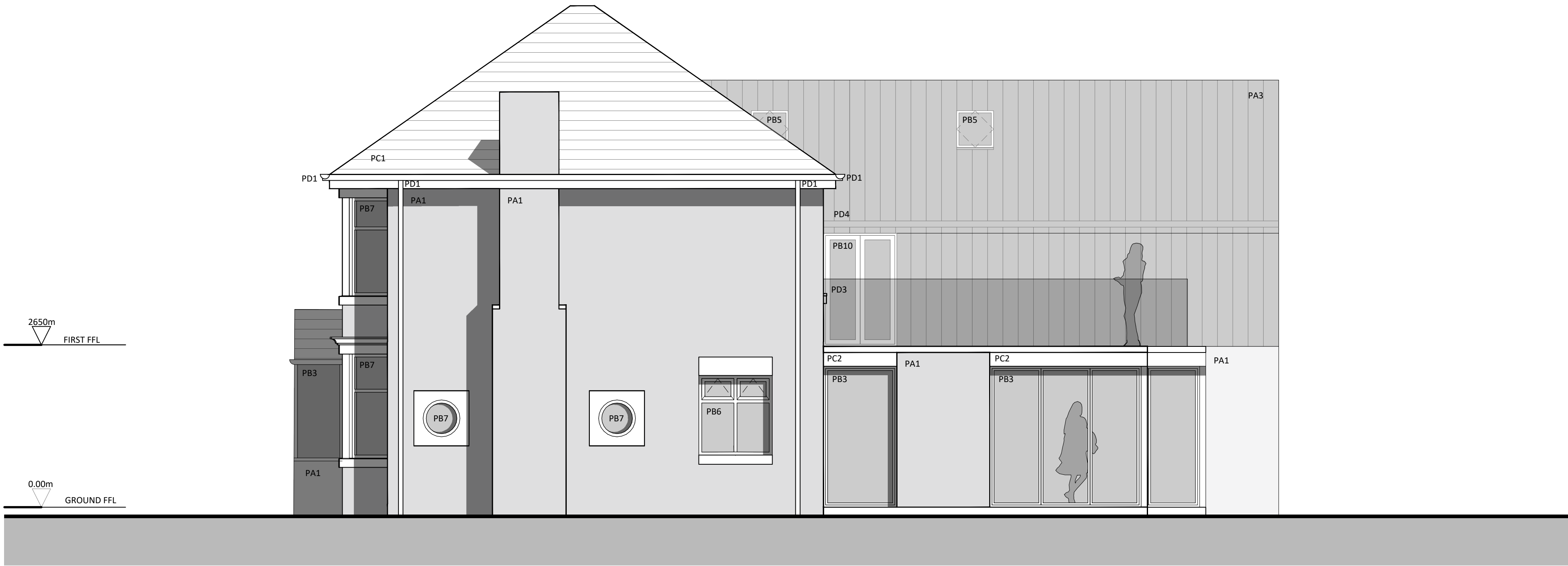
PROPOSED SIDE (SOUTH) ELEVATION