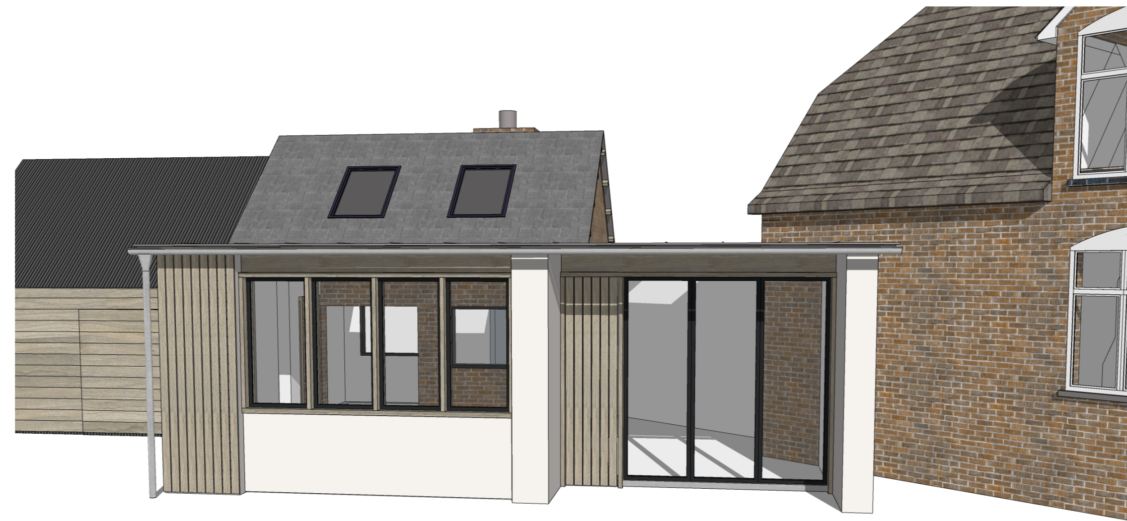
3D View Courtyard 1