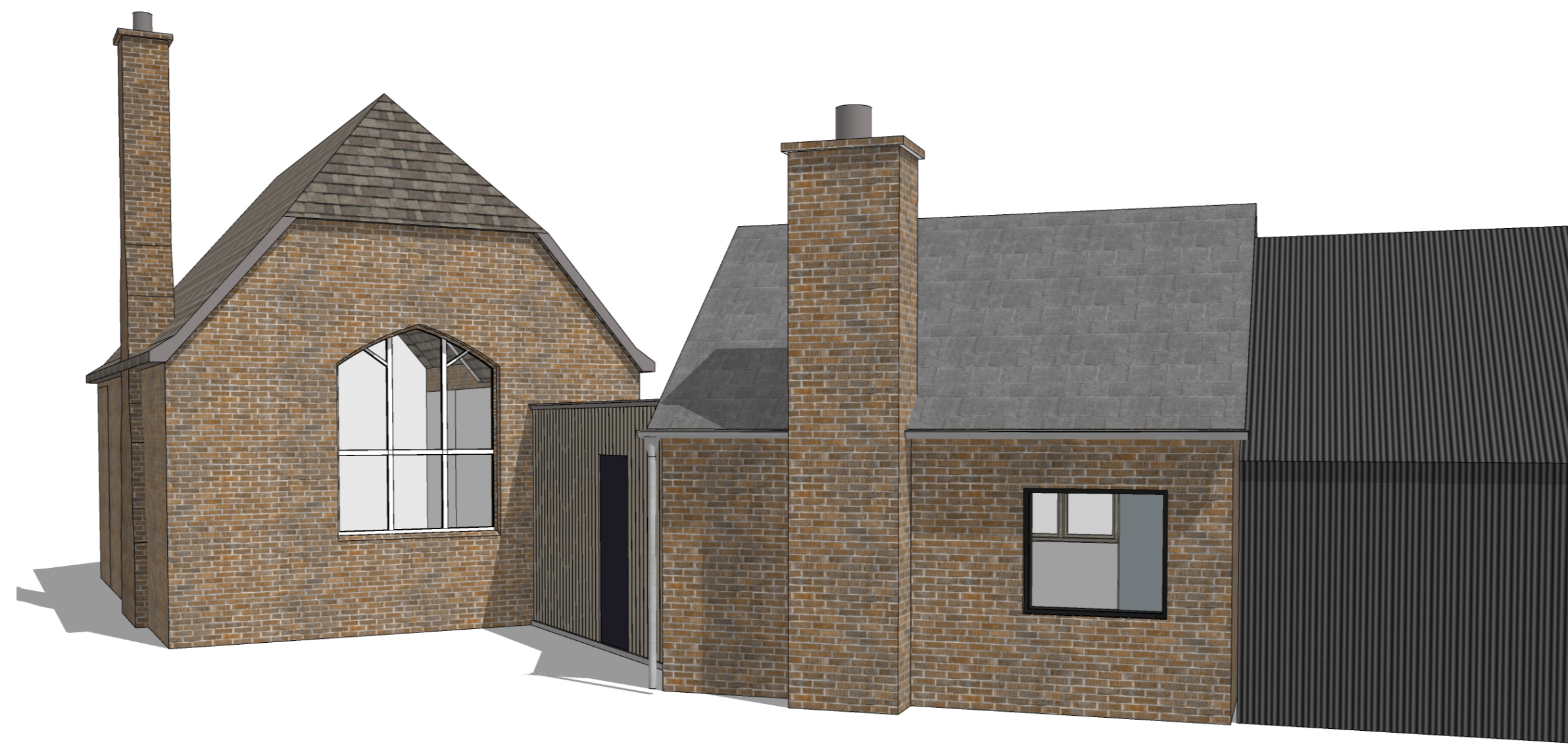
3D View Looking South