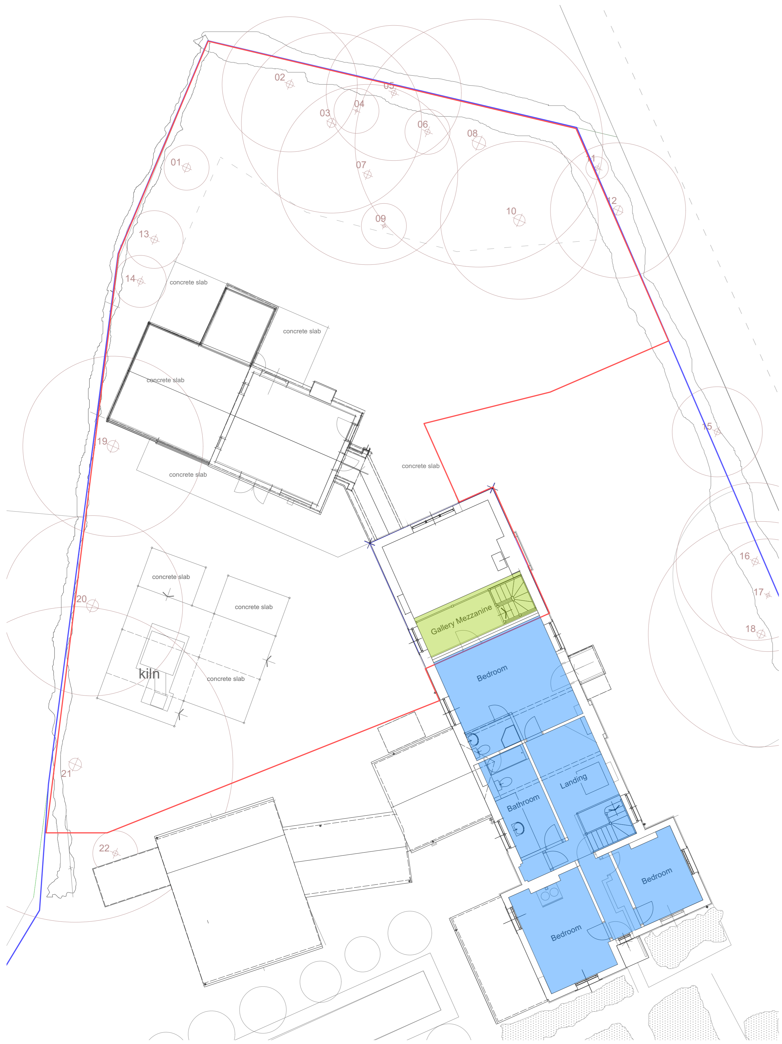
Existing First Floor Plan