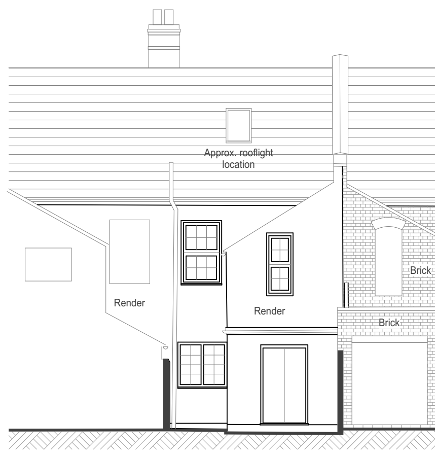
07 1:100 Existing Rear (South) Elevation