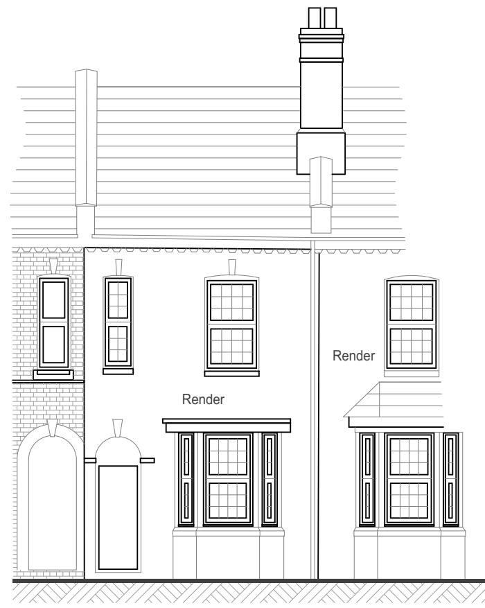
05 1:100 Existing Front Elevation