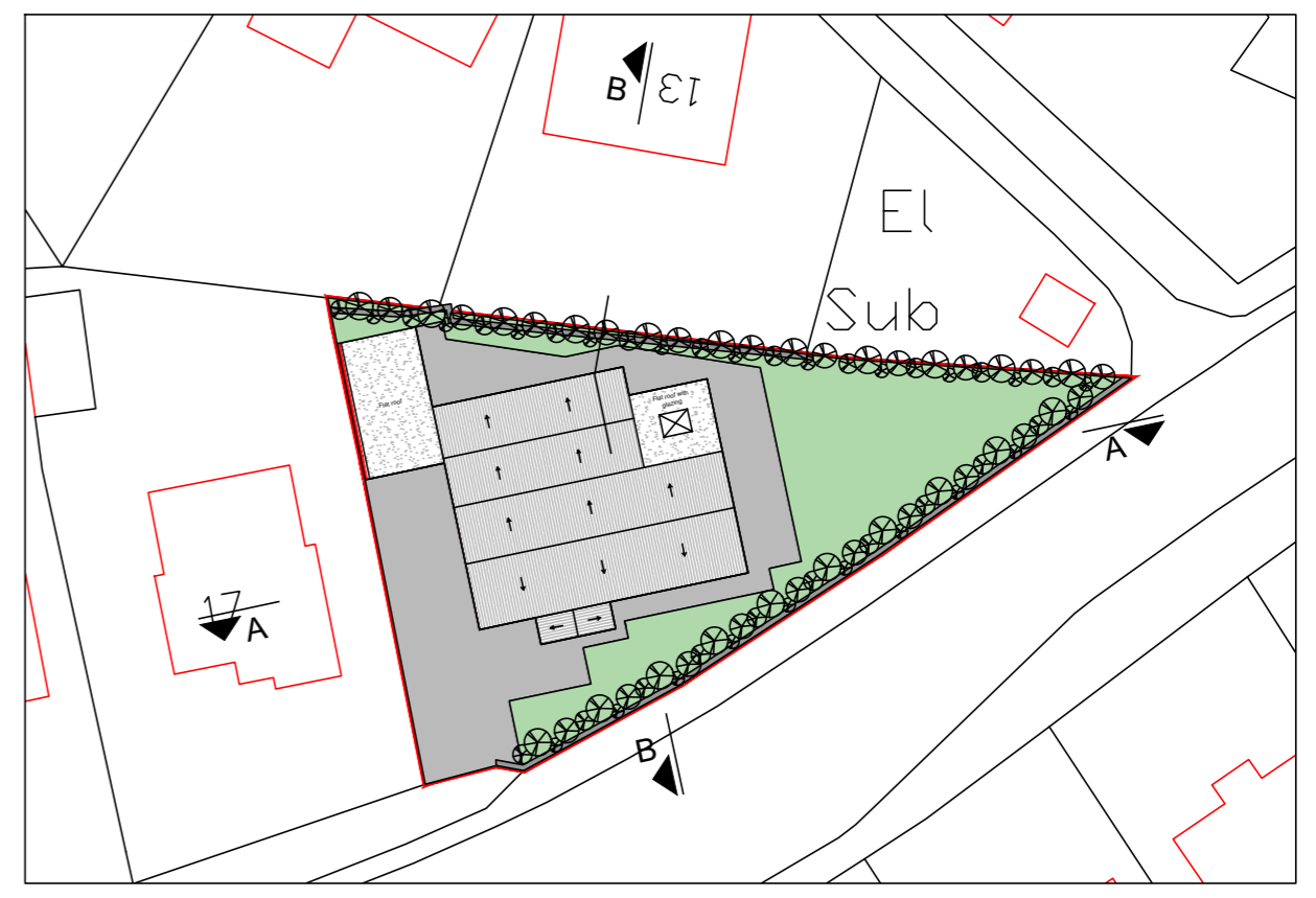
Key Plan SCALE: nts