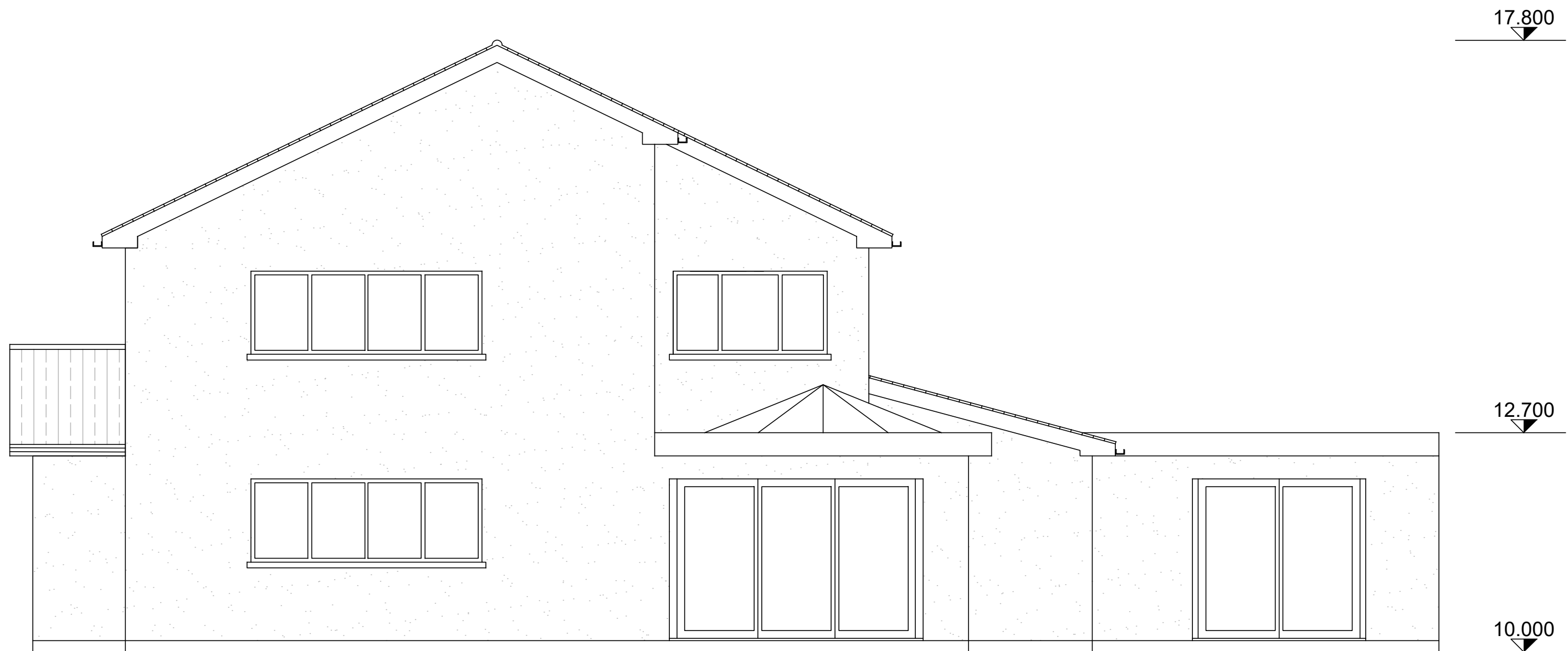
Proposed Elevation D (East) SCALE: 1:50