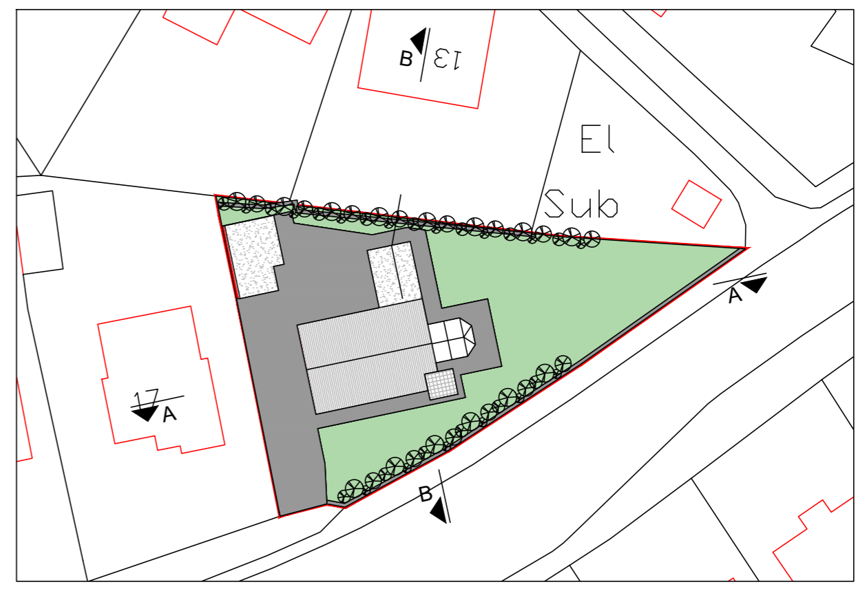
Key Plan SCALE: nts