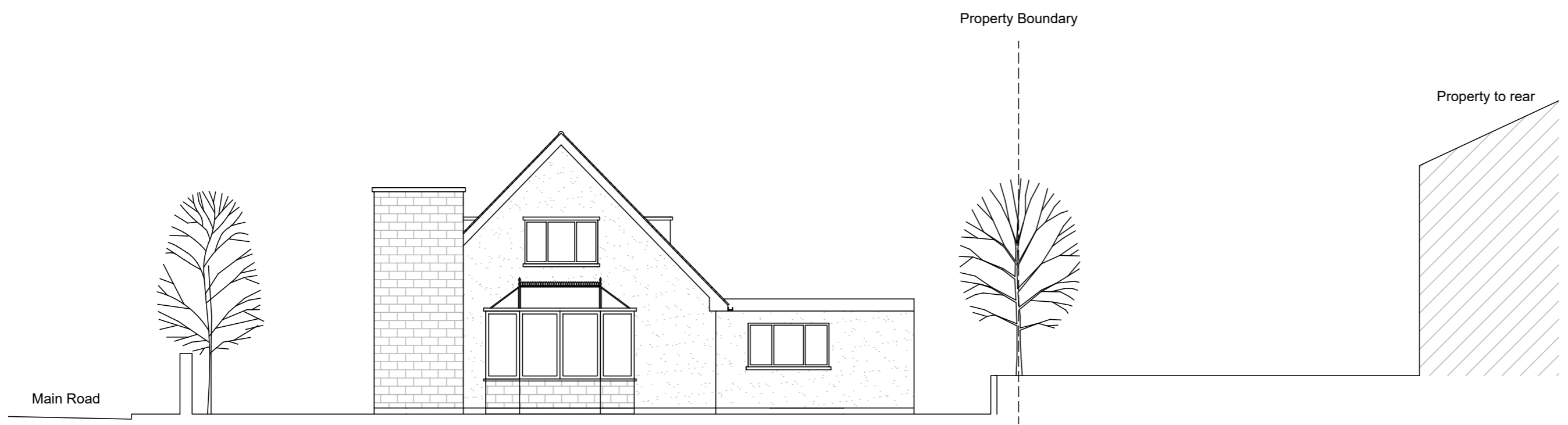
Existing Site Section B-B SCALE: 1:100