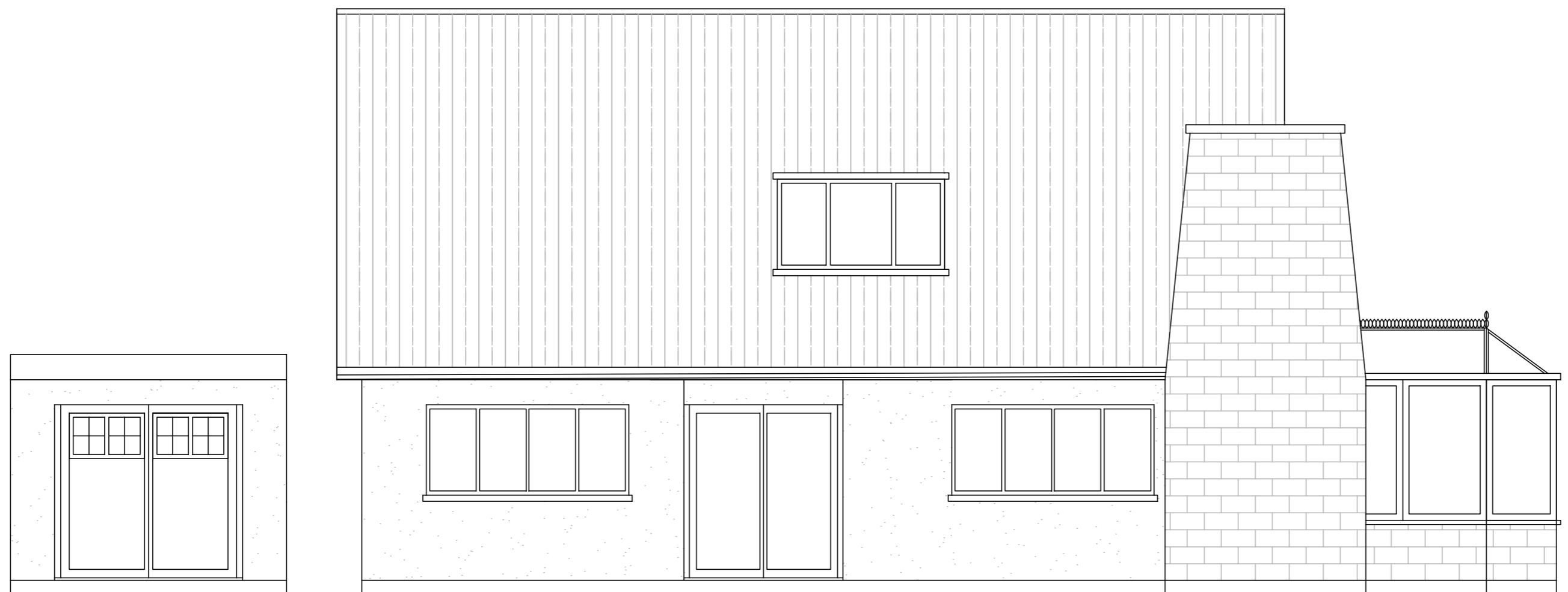
Existing Elevation A (Front) SCALE: 1:50