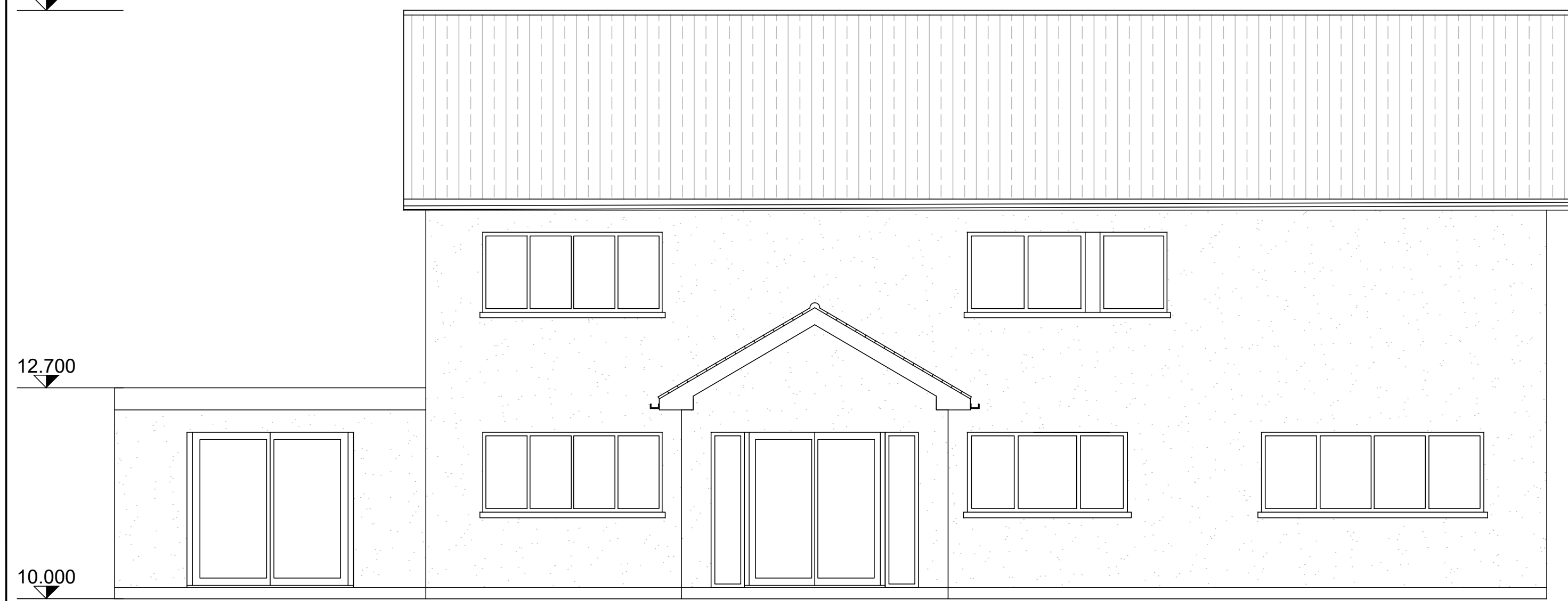
Proposed Elevation A (Front) SCALE: 1:50

Drawing number / Rev SP21001-DWG-105 17.800