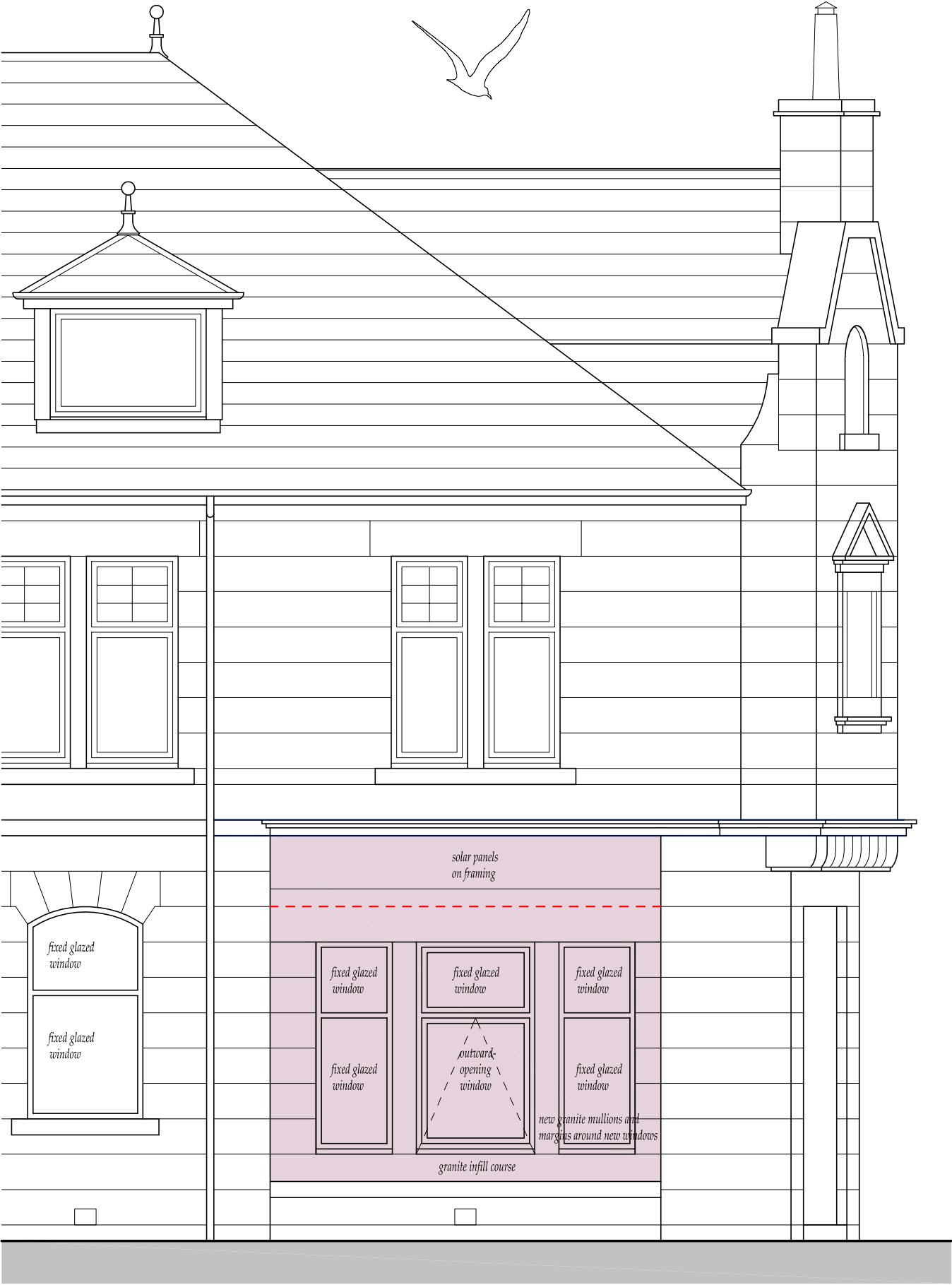
PART SOUTH ELEVATION: AS PROPOSED Scale 1:50 at A3