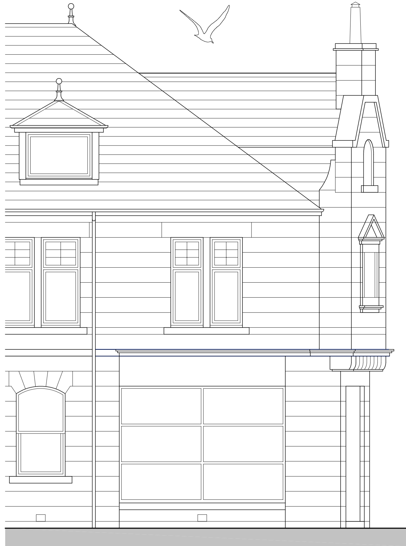
PART SOUTH ELEVATION: AS EXISTING Scale 1:50 at A3