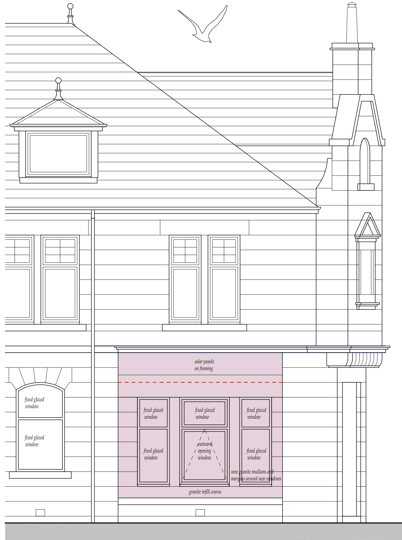
PART SOUTH ELEVATION: AS PROPOSED Scale 1:50 at A3

existing glazed screen to offices to be replaced with triple-glazed, timber-framed windows and fascia replaced with band of solar panels, all set within the existing opening, with profiled granite margins and infill block to match detailing elsewhere