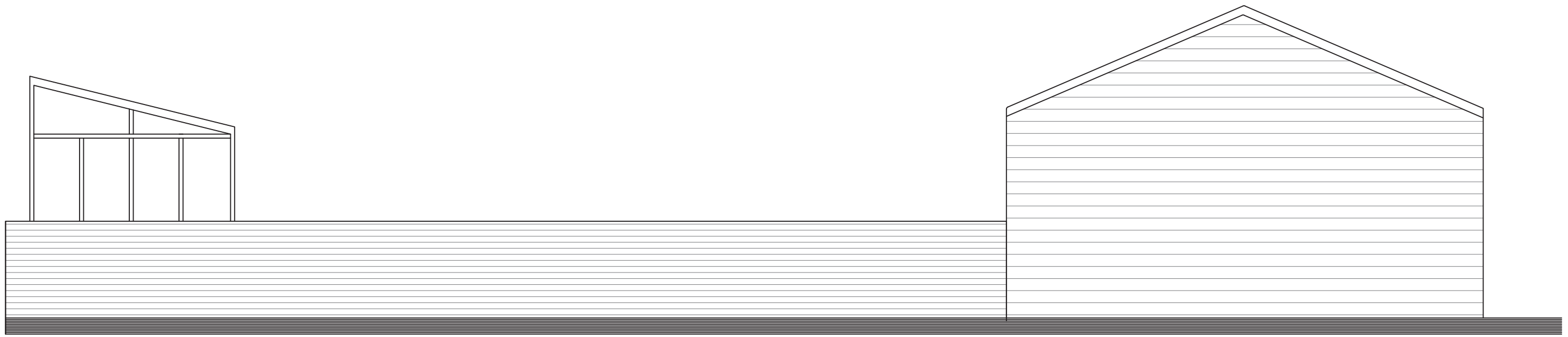
PROPOSED (EAST) ELEVATION